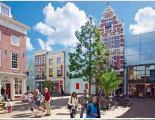
The Hague