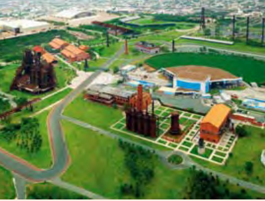
City of Monterrey