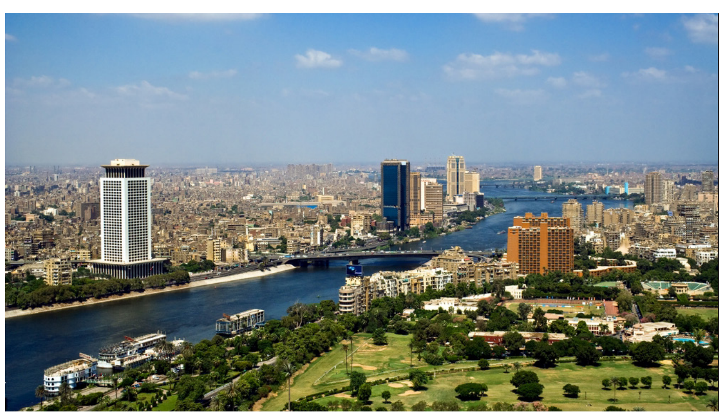
CAIRO EGYPT.

The immediate next steps will consist in reaching out implementation partners, selecting pilot countries and cities and developing specific programme documents.