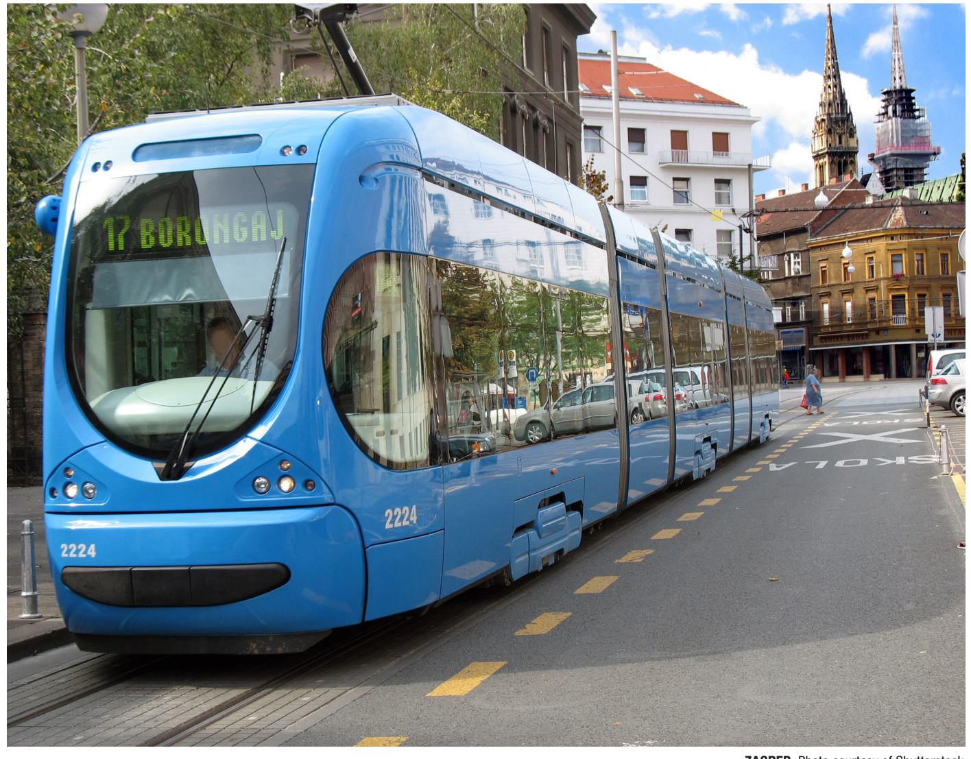
ZAGREB. Photo courtesy of Shutterstock

The Greener Cities Partnership is envisaged to upscale the successful collaboration between UNEP and UN-Habitat. Initially covering the period 2014-2016 leading up to the Third United Nations Conference on Housing and Sustainable Urban Development (Habitat III) in 2016, "Greener Cities" is expected to continue beyond Habitat III. It aims to strengthen synergies between the two agencies and among their partners. Broadly, the objective of this cooperation is to mainstream the environmental perspective into urban policymaking and incorporate urban perspectives into environmental policy-making, as well as to highlight the local-global linkages of environmental issues. Priority areas include resilient, resource efficient cities; sustainable transport and mobility; and waste and waste water management.