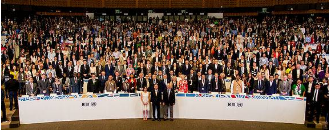
Second World Assembly of local and regional governments, Quito, 16 th October 2016

UNACLA brings local government inputs to the global processes , an essential step to ensure local implementation. UNACLA works to bring local voices and perspectives, as well as to create awareness within local and regional governments about the importance of the global agendas and how to implement them at local level.