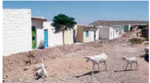
Houses for the permanent resettlement of IDPs and returnees in Hargeisa.