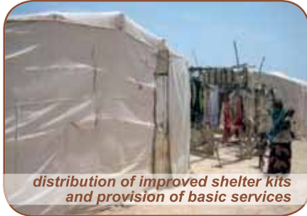
distribution of improved shelter kits and provision of basic services