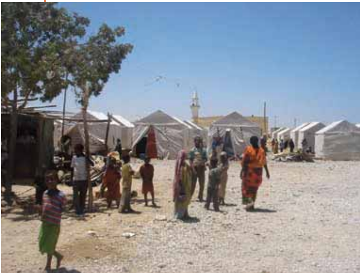
Upgrading of one of the Bossaso IDP settlements jointly implemented by the Shelter Cluster agencies.

In Bossaso, the Shelter Cluster has proven to be an excellent tool for focusing the efforts of all agencies and authorities. The unified "one voice" approach helps to solve longstanding bottlenecks and creates accountability and increased efficiency. The local partners are empowered, while leading activities and actively participating in meetings and action plans build the capacity of staff on the ground. Motivation and self-reliance are improved. The capacity of IDPs and municipal staff is also increased through their active engagement, especially during the implementation phase.