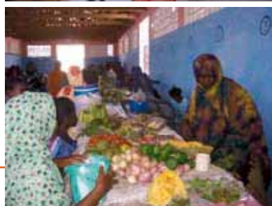
Rehabilitated Abdul Aziz Market, Mogadishu.