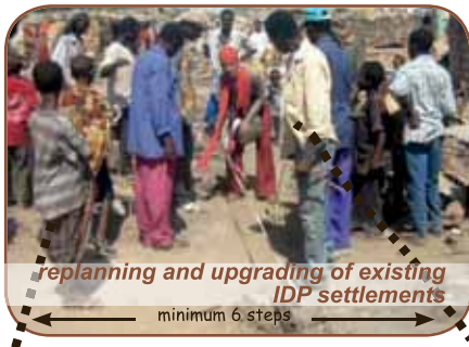
replanning and upgrading of existing IDP settlements