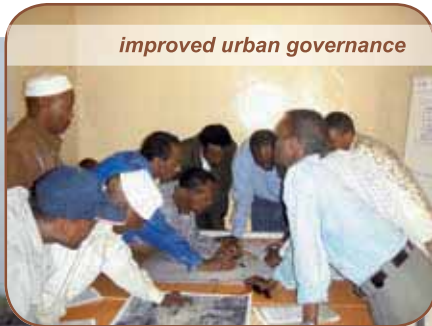
improved urban governance