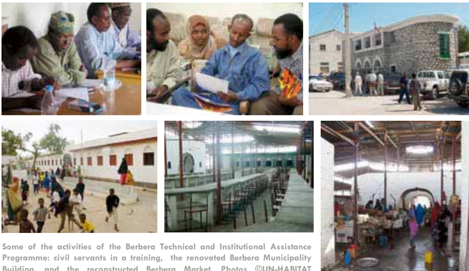
Some of the activities of the Berbera Technical and Institutional Assistance Programme: civil servants in a training, the renovated Berbera Municipality Building, and the reconstructed Berbera Market.

The improved waste management system helps to reduce the risk of disease and sickness among Berbera residents.