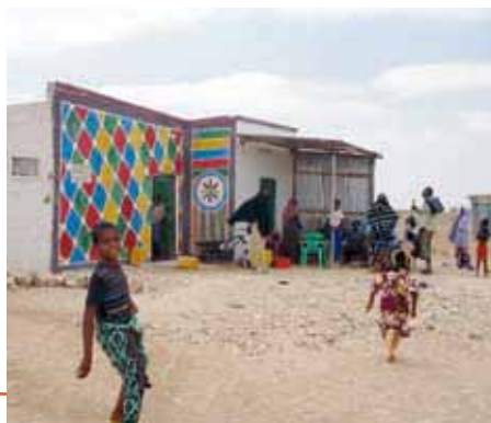
Houses for the permanent resettlement of IDPs and returnees in Garowe.