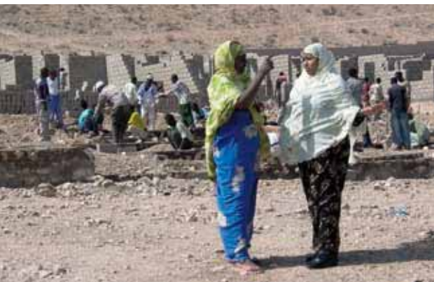
Community mobilizers at work in Hargeisa.

About 2,700 returnees and displaced people, including 2,000 children and 400 women, are the direct beneficiaries of the low-cost housing units. These households will also benefit from awareness