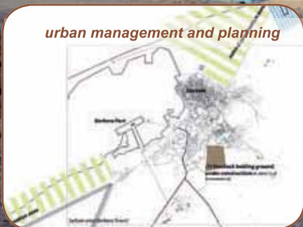
urban management and planning