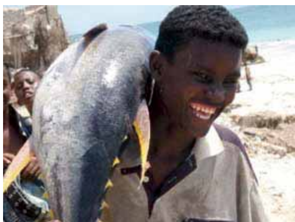
Fisherman in Mogadishu.

UN-HABITAT, through its long-time local NGO partner SAACIID, supports community-based dialogue in the different districts of Mogadishu. Although insecurity in Mogadishu prevents a relevant UN presence, UN-HABITAT believes it is crucial to support the bottom-up strengthening of local governance. This approach contributes to peace and stabilization and stimulates local stakeholders to initiate improvements in basic services and community infrastructure with limited means.