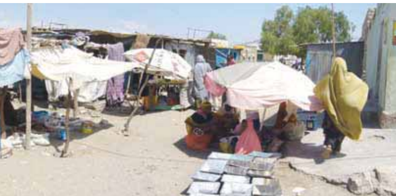
A Burao market scene.

Somaliland and Puntland have meanwhile seen significant economic growth and social development. The northern ports are crowded with outgoing livestock and imported consumer goods from Dubai. Enrolments in primary and secondary schools are growing steadily, and both Somaliland and Puntland have established several small universities. Taking advantage of the prevailing peace, 700,000 refugees have returned from exile to Somaliland, while 400,000 came back to Puntland.