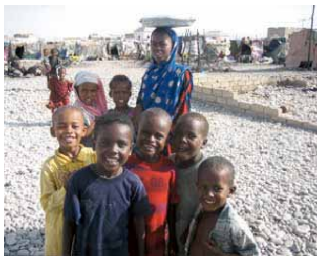
Bossaso IDPs.

Five implementing UN partners have conceived this project as a joint programme and it is leveraged by recently strengthened UN capacities for the field-based coordination of humanitarian assistance. A joint programme manager coordinates the implementation and ensures delivery on targets.