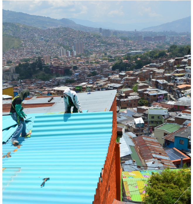
Men building their roof in Medellín, Colombia.

An investment of 200 million Euros in PSUP could address the needs of an estimated 35 million slum dwellers in ACP Countries over five years, more than double that achieved in the improvement of living conditions against the MDG 7d for Africa in 15 years. Moreover, UN-Habitat expects to expand its resource bases more broadly even when not directly managing investments in informal settlements. Just in Ghana and Kenya, the World Bank will invest around 100 million US dollars over 15 years, and the PSUP is a prime tool for SDG achievement.