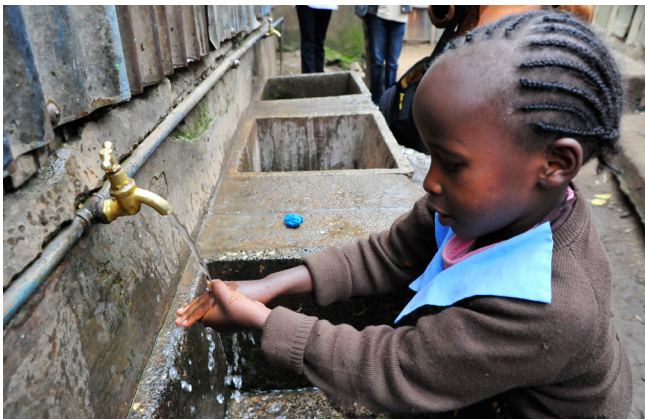
A school girl cleaning her hands during break time Nairobi, Kenya.

To get slum households out of slum conditions, focused and integrated investments need to be made towards improvement of access to potable water, sanitation, quality of housing, access to healthcare, education facilities, security of tenure, employment and public space. The level and nature of intervention by different actors should be aimed towards the reduction or improvement of slum households and enable the sustainable transformation slum neighbourhoods driven by slum dwellers.