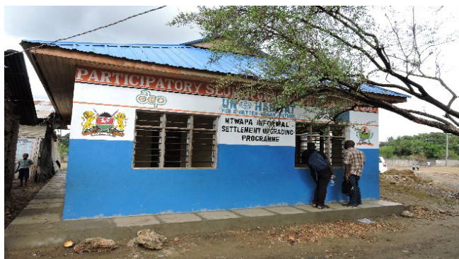
PSUP community resource centre in Mtwapa Kenya.

Good partnerships are the critical element to support the multiplier effect of participatory slum upgrading. The Participatory Slum Upgrading Programme (PSUP) consists of several levels of partnerships. Globally the partnership is anchored by a tripartite partnership with the European Commission and the ACP Secretariat as well as the 79 Member States of the ACP Countries. The visibility and knowledge platform has built trust and encouraged countries beyond ACP borders to join the programme. UN-Habitat is building a regional knowledge and capacity hub in the Arab States which will facilitate expansion to countries like Egypt, Iraq, Jordan and Lebanon, and there are current expressions of interest for informal settlement upgrading in Indonesia, India, Myanmar, Pakistan and Thailand.