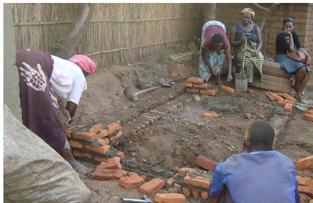
Gamashie Community road during upgrading.

Coordination mechanisms and urban forums have been established in more than 30 countries. National Urban Development and Slum Upgrading and Prevention Policies have been developed and approved in Burkina Faso, Cameroon, Cape Verde, Fiji, Kenya, Ghana, Papua New Guinea and Uganda. More than 800,000 slum dwellers now have secure tenure in Burkina Faso, Cameroon, DR. Congo, Ghana, Kenya, Malawi, Mozambique, Niger and Senegal). Around 67,600 slum households will see improved water and sanitation, better housing, access to public spaces and better roads.