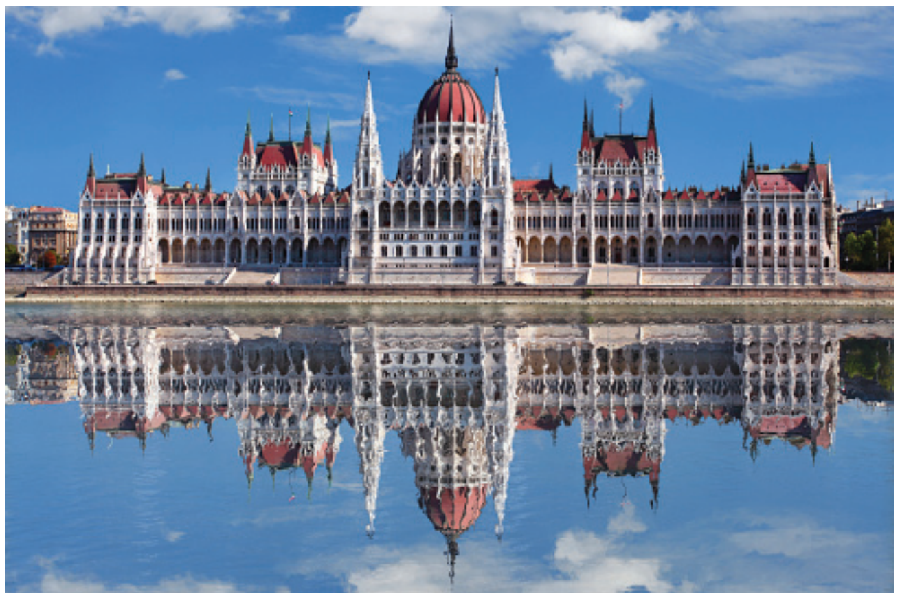
The parliament building in Budapest, Hungary. All transitional countries have made progress in their transformation from Socialist centrally-planned economies to democratic and market-based systems.

Clustering (networking) of municipalities is a clear and desirable possibility in most countries, with some initial steps