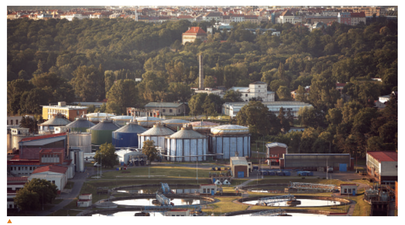
A water treatment plant in Prague, Czech Republic. The Czech Republic's water supply and wastewater treatment services are highly privatised.

consumption structures differ significantly from country to country. For instance, if Ukraine were to implement technically-possible improved standards, even though these are not the best available technologies, they could still lower overall energy losses to 38 per cent. Such savings would be critically important given Ukraine's dependency on imported natural gas.