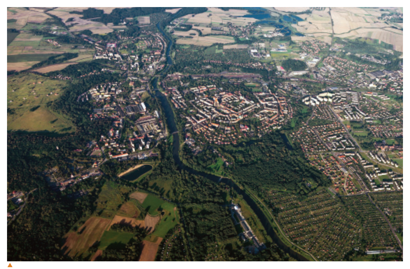
Nysa City, southwest Poland, population 47,000. In Poland, polycentrism has successfully established urban areas of different sizes within the national urban network.

From 1991 onwards, the EU had to review fundamentally its relations with European nations beyond its eastern boundaries. With the EU eastward expansion, the question arose of how to secure peace and stability at the EU's new periphery. Various policies came into being, including the European Neighbourhood Policy (ENP) and the European Security Strategy (2003).