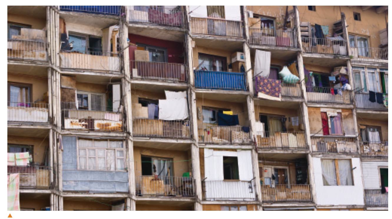
Tbilisi, Georgia. An example of the proliferation of 'vertical slums' across the region's cities.

There is a need to increase the supply of affordable urban rental housing throughout the region rapidly. Better articulated regional development policies could contribute to geographically-improved housing distribution with new or renewed policies and programmes for the social housing quantities in each country. In addition, well-functioning housing markets require responsive land markets but urban land supply is often problematic. Large tracks of urban land have unclear ownership while others are heavily polluted or have been abandoned.