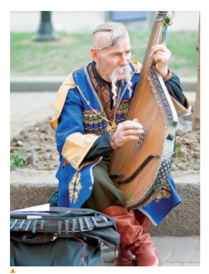
A Kobzar singing to his own accompaniment in Kiev. Demographic ageing has put pressure on Ukraine's economy.

However, it is important to understand that perceived urban shrinkage, especially where it concerns the larger cities, is to some extent a matter of definition rather than an urban population issue per se . Whereas population data based on cities' administrative area (the municipality or the city proper)