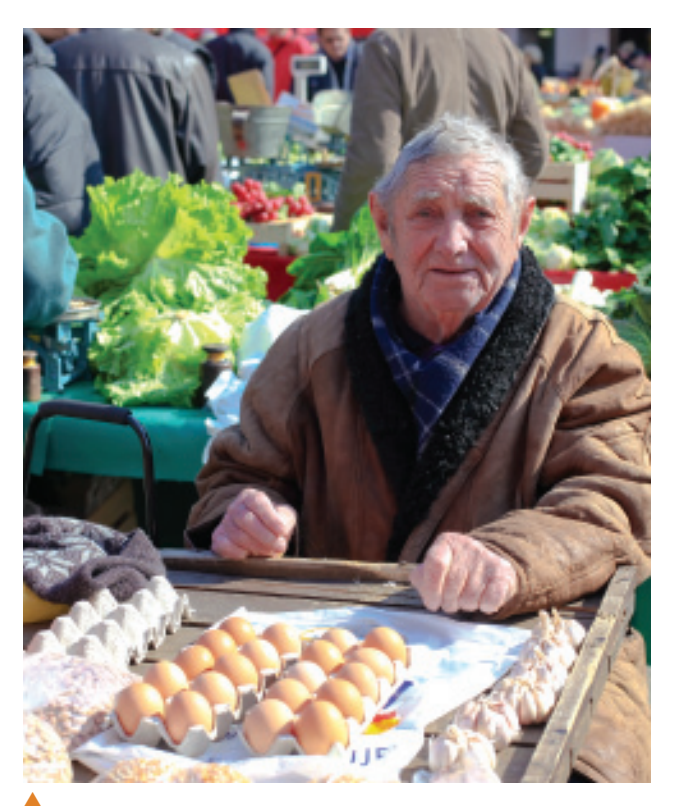
Zagreb, Croatia.

Throughout the region, rural dwellers are generally poorer than urban ones. However, as explicitly noted in the case of Albania and Romania, extreme poverty associated with social