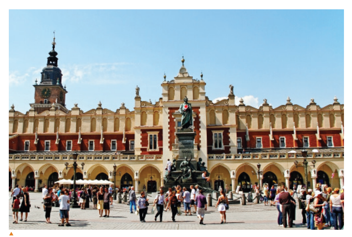
The Renaissance Sukiennice (Cloth Hall) in Krakow, Poland, is one of the city's most recognizable icons and a huge tourist attraction.