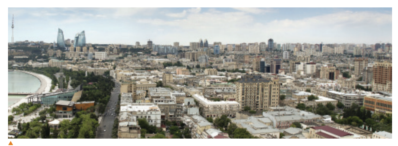
Baku, the capital of Azerbaijan, is the second largest but fastest growing city in the region