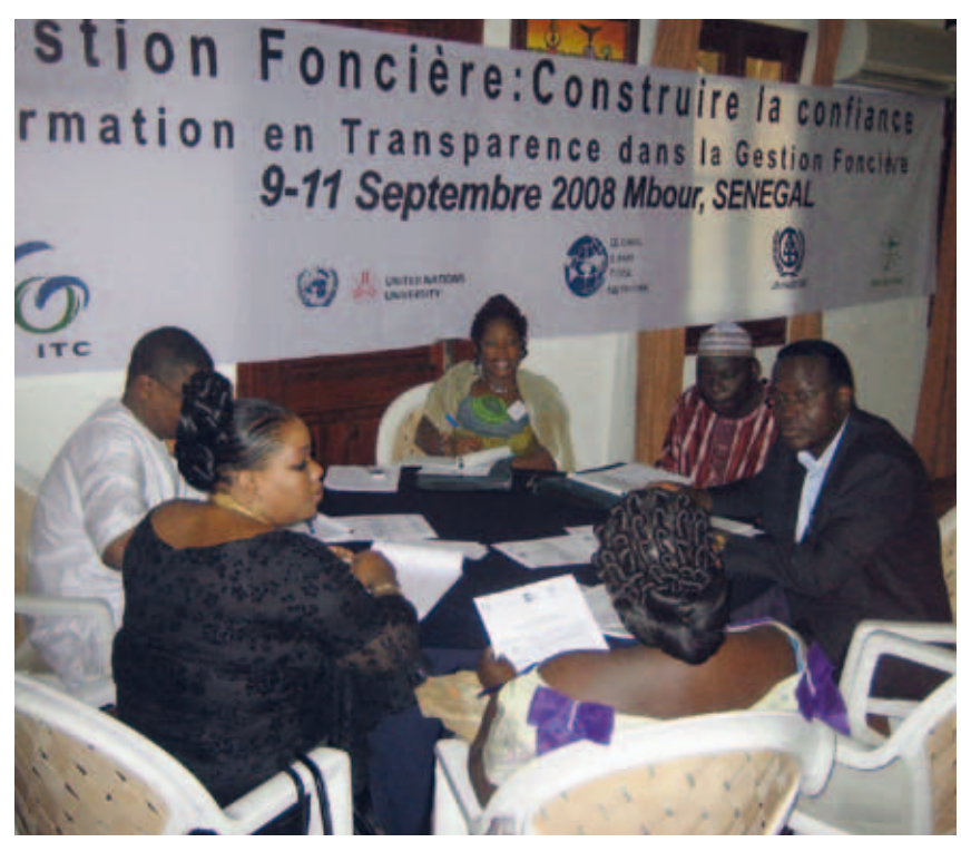
Capacity building, innovation and joint effort are important ingredients of success.

Concerns about environmental consequences may call for regulation of land rental markets, particularly if the rental contracts are of short duration. Shortduration contracts can suppress investment incentives, leading to non-sustainable land management practices. Some evidence of that has been found in Uganda by Nkonya et al. (2008), however, the cause may not always be clear i.e. whether landowners prefer to rent out their poorly managed land, or whether poor management is a consequence of the land being rented out. This requires further investigation under diverse conditions since land renting has become so common and is on the increase in many parts of the world.