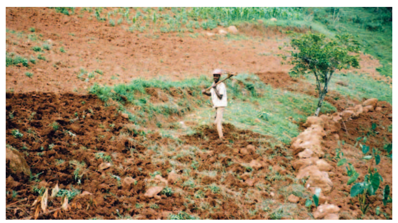
Productive land use is essential to meet competing needs and demands. Cultivation on steep slopes in Wollaita, southern Ethiopia.

Establishing better standards for transparency and accountability and increased international pressures and support to implement such standards will be important to reduce levels of corruption and elite capture.