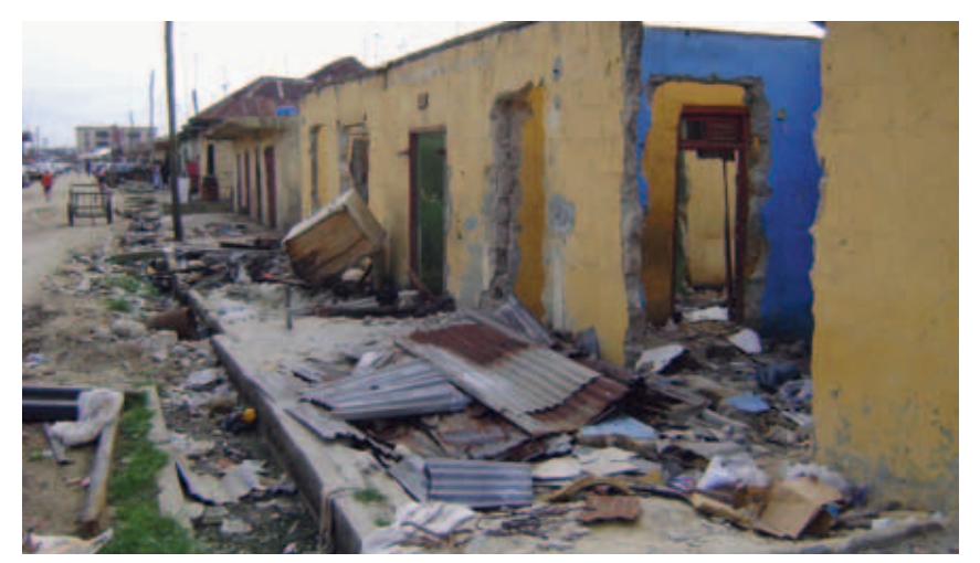
Pikine, Dakar; houses of residents being destroyed

It is not obvious what the most appropriate methods of enforcement are butpilot testing at a small scale gives valuable insights before scaling up. Local land administrations and land use planning committees at community level play important roles in the dissemination and enforcement of land laws and regulations. Box 5.7 provides an example of such interactive regulation of land management in Norway.