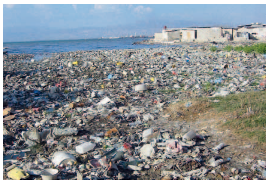
People living along the coast are at risk of sea level rise.

There is a risk that those managing rented land invest less in conserving such land than if they owned the land. As land renting expands there is a growing need for legislation that protects rented land by signaling clear responsibilities of owners and tenants. Longer-term contracts may reduce this problem and very long-term contracts, i.e. 99-year leases are treated almost like sales. Enforcement of longerterm contracts may be an option but that may also reduce the flexibility advantage of short-term contracts. Imposing sustainable management requirements as a part of the contract may be an alternative approach that should be tested in diverse environments.