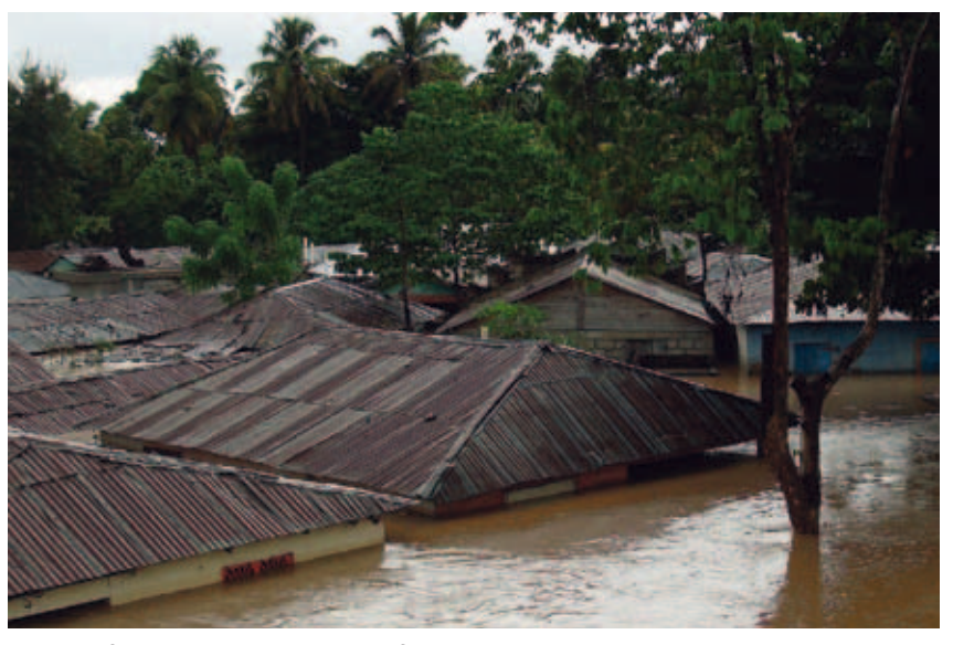
Extreme flood events will be more frequent as the planet heats up.

and can contribute substantially towards more sustainable land management by giving stronger focus to this in its core areas of competence. Environmental issues can be integrated systematically in all areas as a cross-cutting issue.