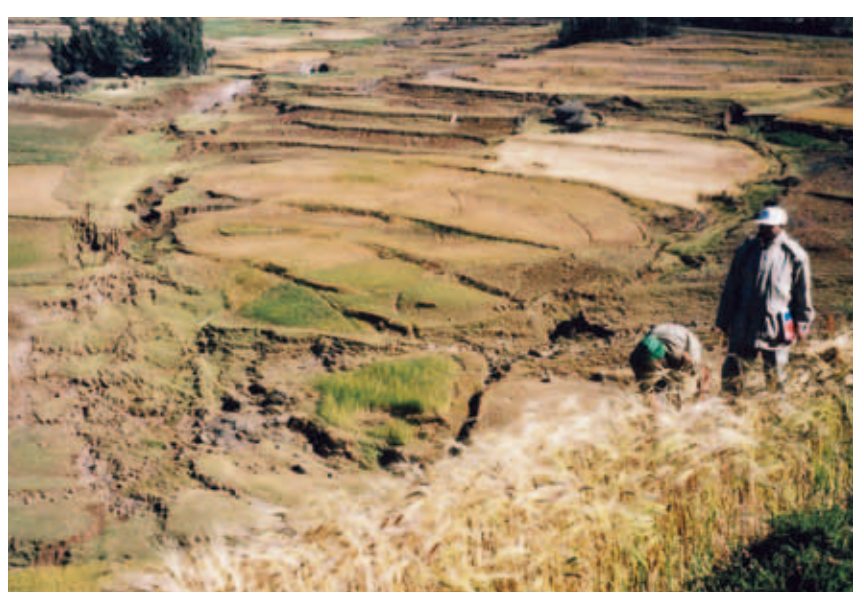
Soil erosion due to poor conservation, North Shewa, Amhara Region, Ethiopia

The existence of market failures implies a need for policy interventions to internalize the externalities caused by these market failures. Existence of high transaction costs and asymmetric information are important reasons for imperfections in markets, including non-existence of markets.