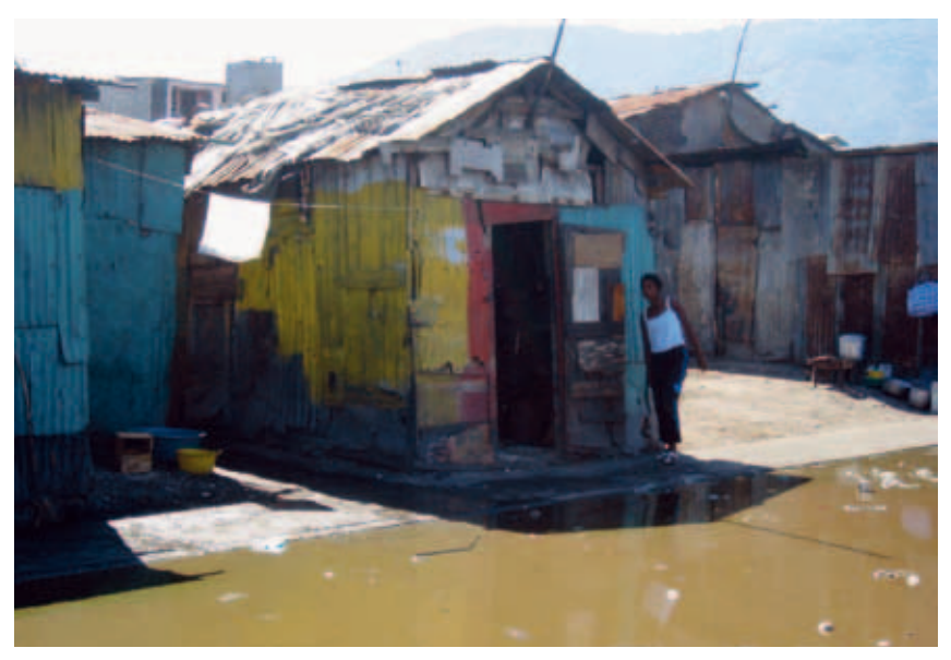
Tenure security for people in slums is an important step towards improving living conditions.