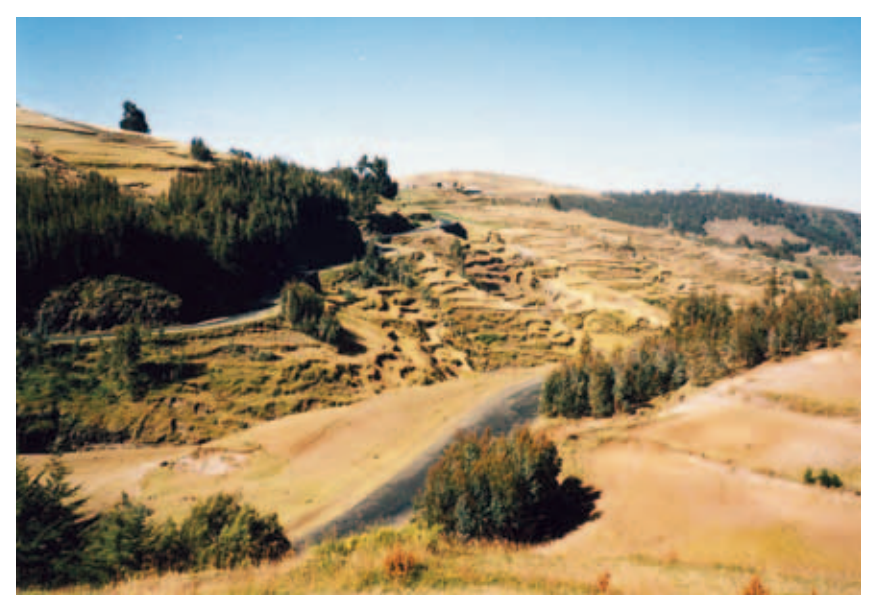
Woodlots on small farms in North Shewa, Amhara Region- Ethiopia.

most of them this is not so clear. If intensity of production is lower on rented land then this may have ambiguous effects on long-term land productivity.