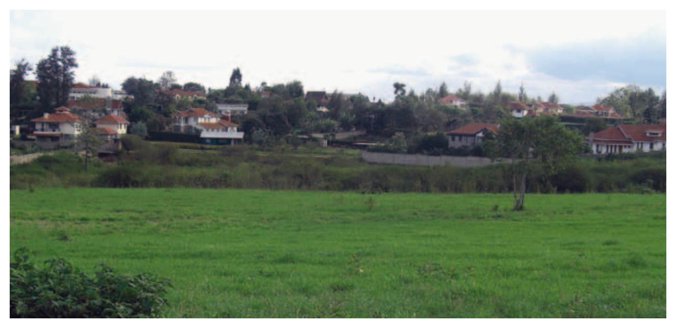
Productive land use is essential to meet competing needs and demands.