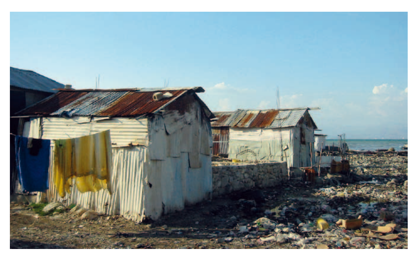
Urban slum on the waterfront, Haiti. Most of Port-au-Prince's residents live in vulnerable areas.

Furthermore, monitoring of climate change in selected cities and capacity building and knowledge sharing will be central activities.