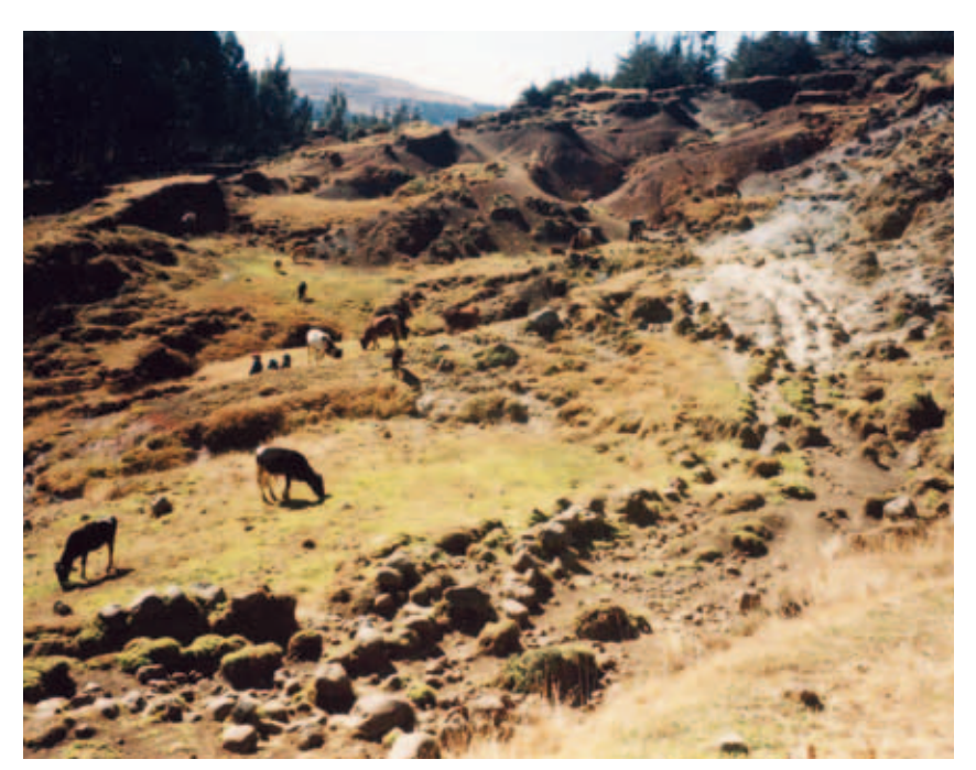
Land degradation caused by overgrazing and lack of soil conservation, Amhara Region, Ethiopia

Negotiated land reforms have been attempted that rely on voluntary land transfers based on negotiations between buyers and sellers and governments providing grants for the buyers, to reduce the political tensions (Deininger, 2001). Box 3.13 describes the experience with negotiated land reform in Columbia.