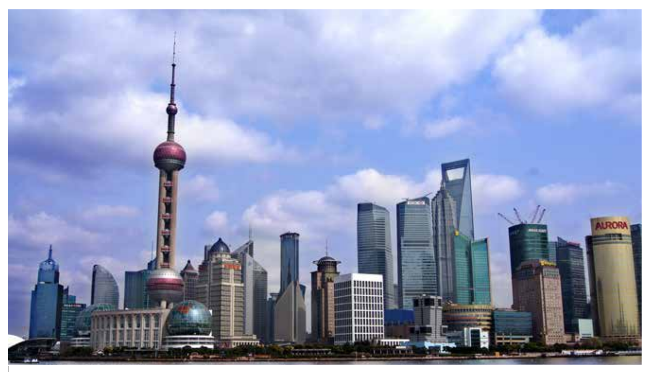
Urban skyline of Pu'dong district in Shang'hai- China