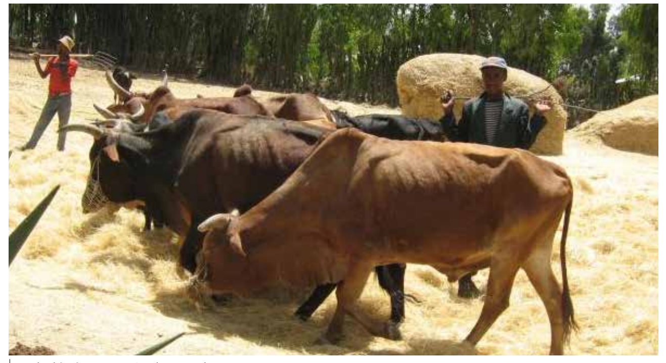
Rural Ethiopian Farmer

Land security issues are already addressed in both the federal and regional constitutions. The government is committed to the better implementation of