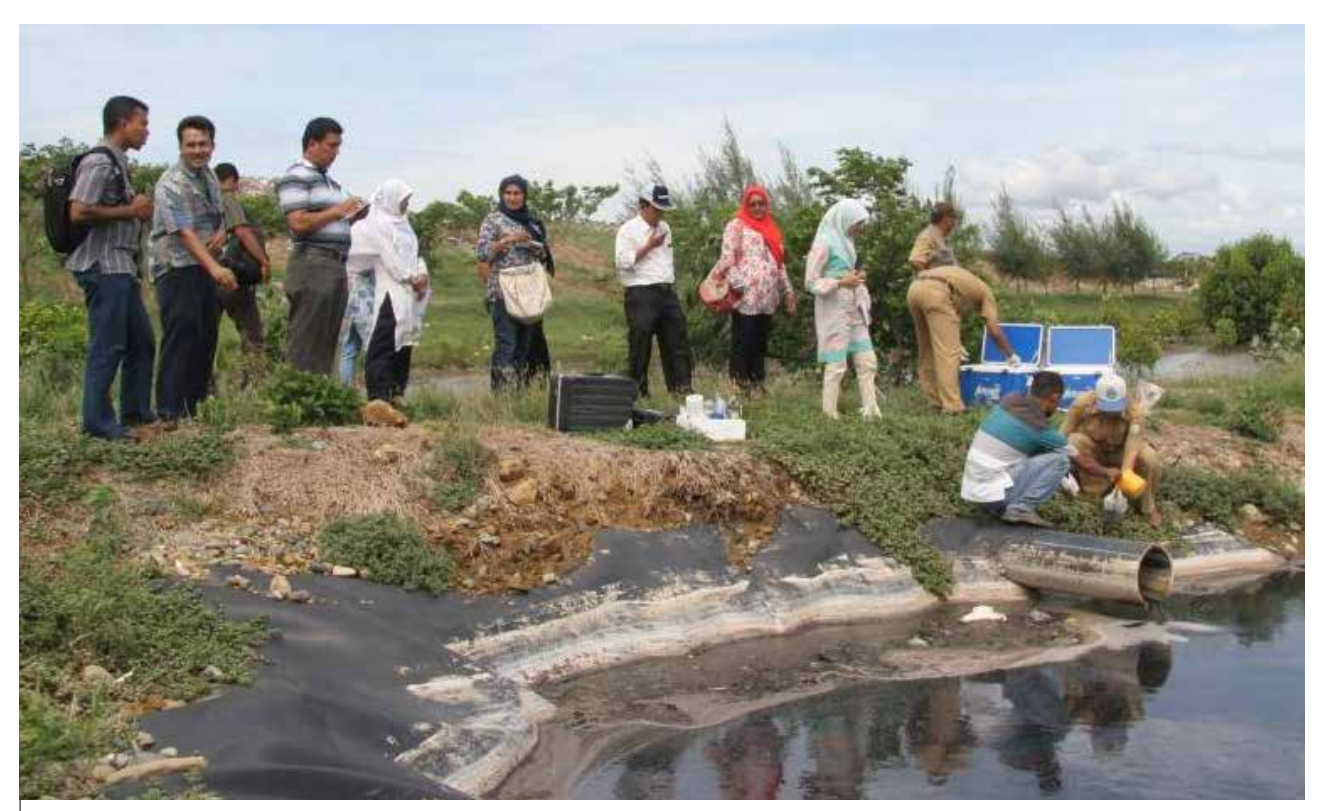
Improved Municipal Solid Waste Management in Aceh - Indonesia