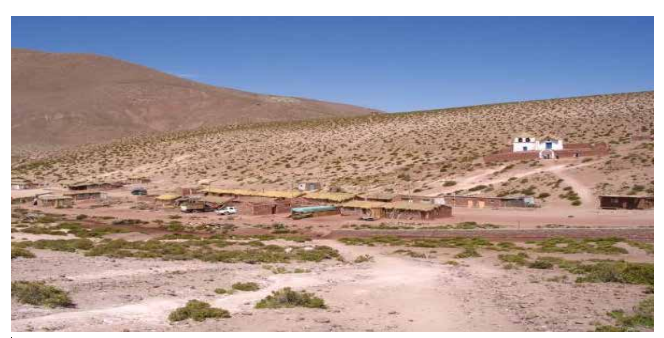
A rural village located in the Atacama desert in the north of the Chile

Having achieved a good economic position in the regional and global contexts, Chile is a strong partner in international markets. This increases the motivation for public and private investment in modernization and reform. OECD membership has meant a number of policies have been improved in order to meet OECD standards and this is a great opportunity for the country to move forward towards its development targets. Global trends underline governance of the land sector as a way to understand the system, how it operates and what and how to intervene and to improve it. Because governance of the land sector in Chile is still weak, it is an important and relevant opportunity to improve the situation by building on international experience and collaboration.