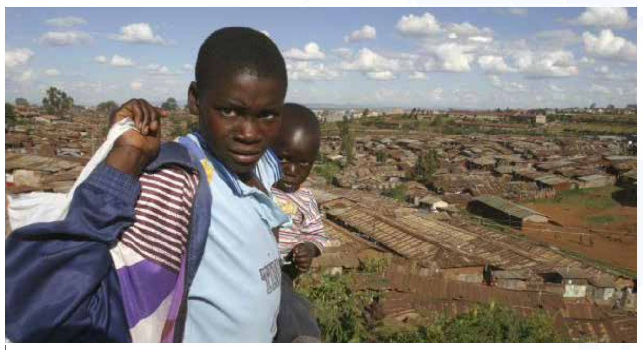
A child carries his brother near an informal settlement/slum in Kenya