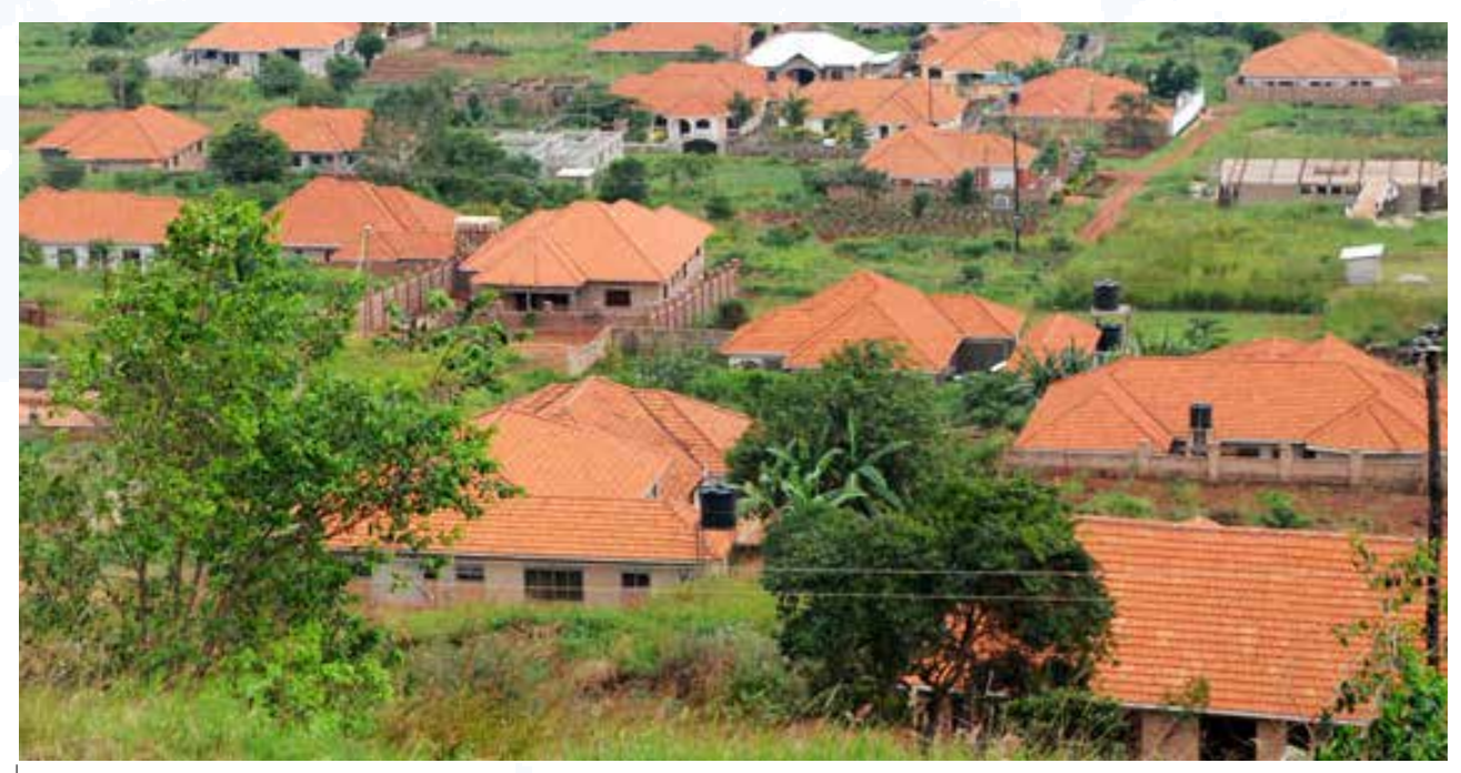
Uganda's real estate industry is affected by land tenure insecurity

poor (professional) education and training within Nigeria and the West African region remains a bottleneck. Relevant institutions are still not able to adequately deal with land issues. The natural resource "curse" based on crude oil still applies to Nigeria and has resulted in many conflicts and security issues. This in turn led to the country's poor reputation with the international community and socio-economic instability. Amendments to the 1978 Land Act are impeded by constitutional rigidity. There are serious challenges posed by institutionalized corruption at all decision-making levels and these are a major setback to the smooth functioning of systems.