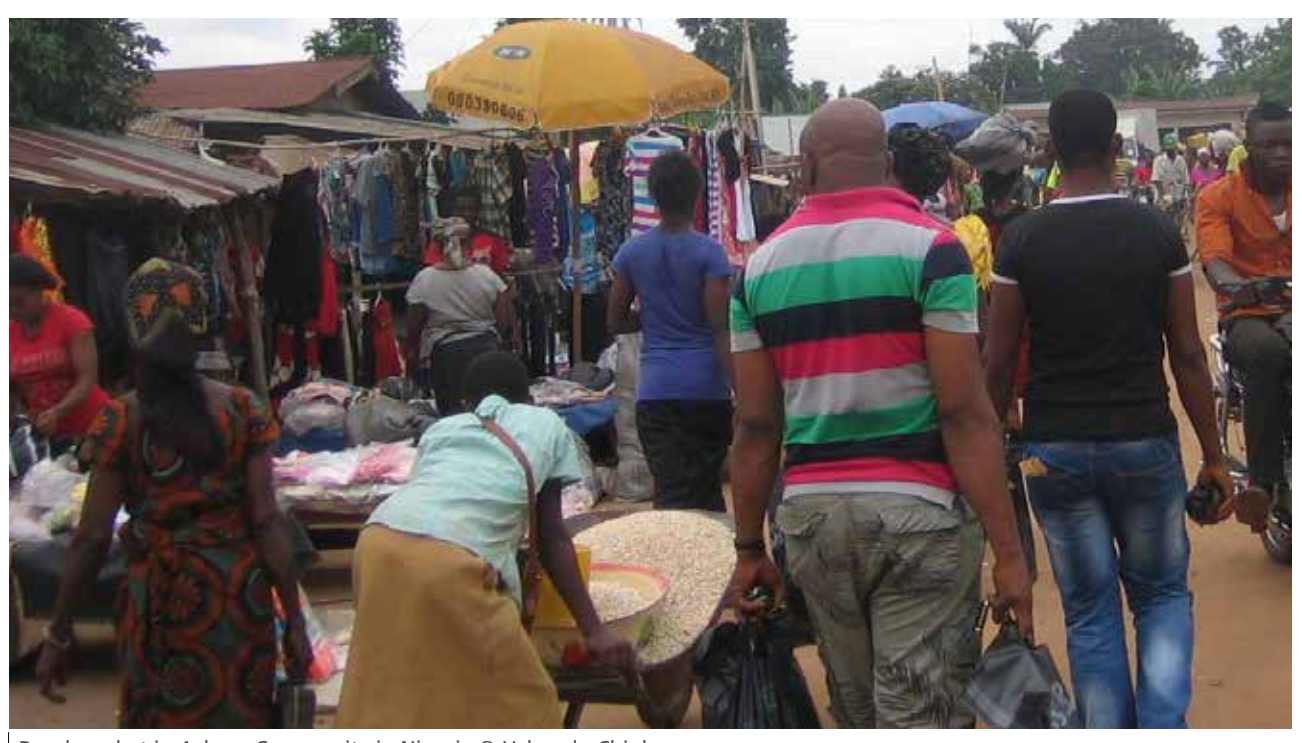
Rural market in Achara Community in Nigeria

Tenure is still characterized by poor enforcement of laws, rules and regulations. As for land management,