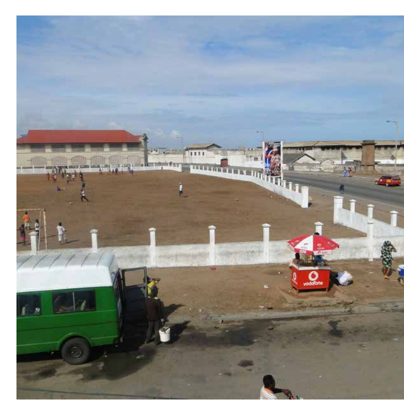
Public space along the coast of Accra, Ghana

Ghana is characterized by a peculiar, complex land tenure system that reflects the unique indigenous political organizations and socio-cultural differences of its ethnic groups, clans and families as well as differences in the natural environment. There are two major systems in which rural and urban land is held and these are based on customary and