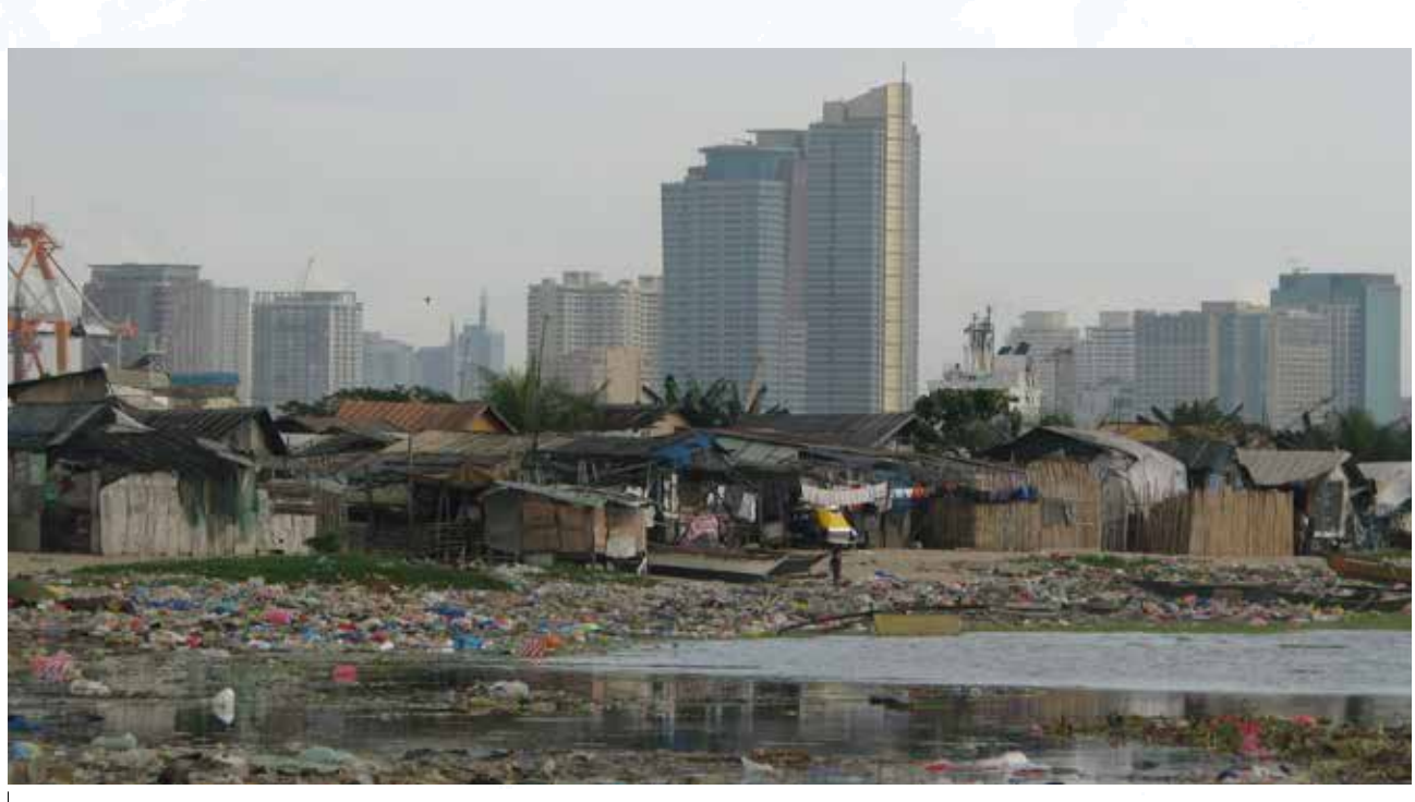
Baseco informal settlement in Manila, the Philippines

land acquisition for public investment by the state. Corporate ownership is still restricted and may reduce the opportunities for effective cooperation, leading to an underdevelopment of the land market. The law does not explicitly limit land size or the number of individual holdings, which encourages land market development but may result in a concentration of land ownership in the hands of a few influential actors. The concentration of power at numerous levels and points of registration, as well as complex regulatory systems, create incentives for additional informal fees or "rent seeking". Limited local staff in terms of numbers, skills and professional abilities is the reason for the observed postponement of land service applications and may result in institutional inefficiency. Mistrust of the government due to complicated, time consuming and bureaucratic registration processes is prevalent. In most large cities, there is no security of tenure for squatters, which may create social unrest but is understandable from the viewpoint of owners whose land has been occupied. Due to insecurity, the granting of rights of possession and squatting on land is not guaranteed because it may include other parties reclaiming land. No clear rules exist for closing off decayed land claims, so land disputes have increased. Land titles connected to commercial and industrial use are not sufficiently secured to fund commercial lending in the capital market at international rates