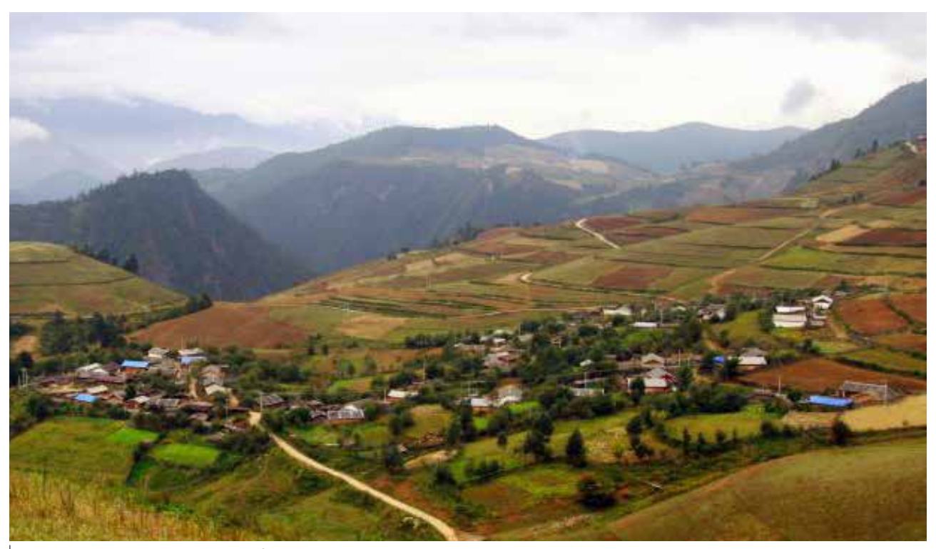
Remote village in the mountains of the Yun'nan plateau in China

of a colonial power's legal system in the past or more recently through internationally harmonized statutory law and global treaties such as those on indigenous peoples, the environment or gender equity. In some cases, tenure systems have been determined by revolutionary processes and the resulting turnover of existing land tenure systems through redistributive land reform or forced land collectivization. Even in countries where gradual changes in land tenure systems were initiated, policy makers may have strengthened the role of the (central) state in allocating and even managing land. Often in these cases, this vision materialized with the nationalization of non-registered lands held under customary tenure and of forest or pasture resources, and the influence of government organizations that directly interfered in land use and management.