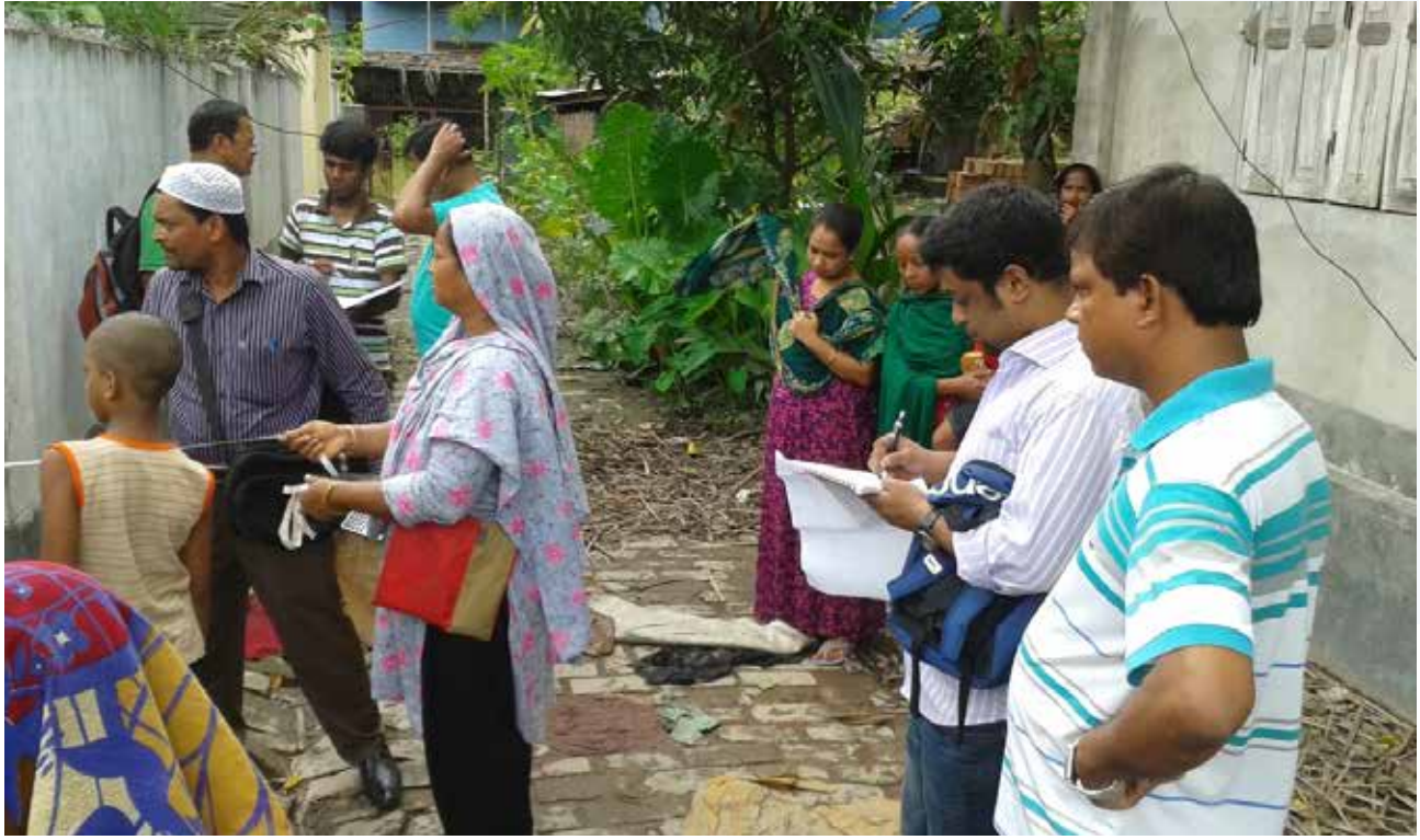
Parcel demarcation in Bangladesh