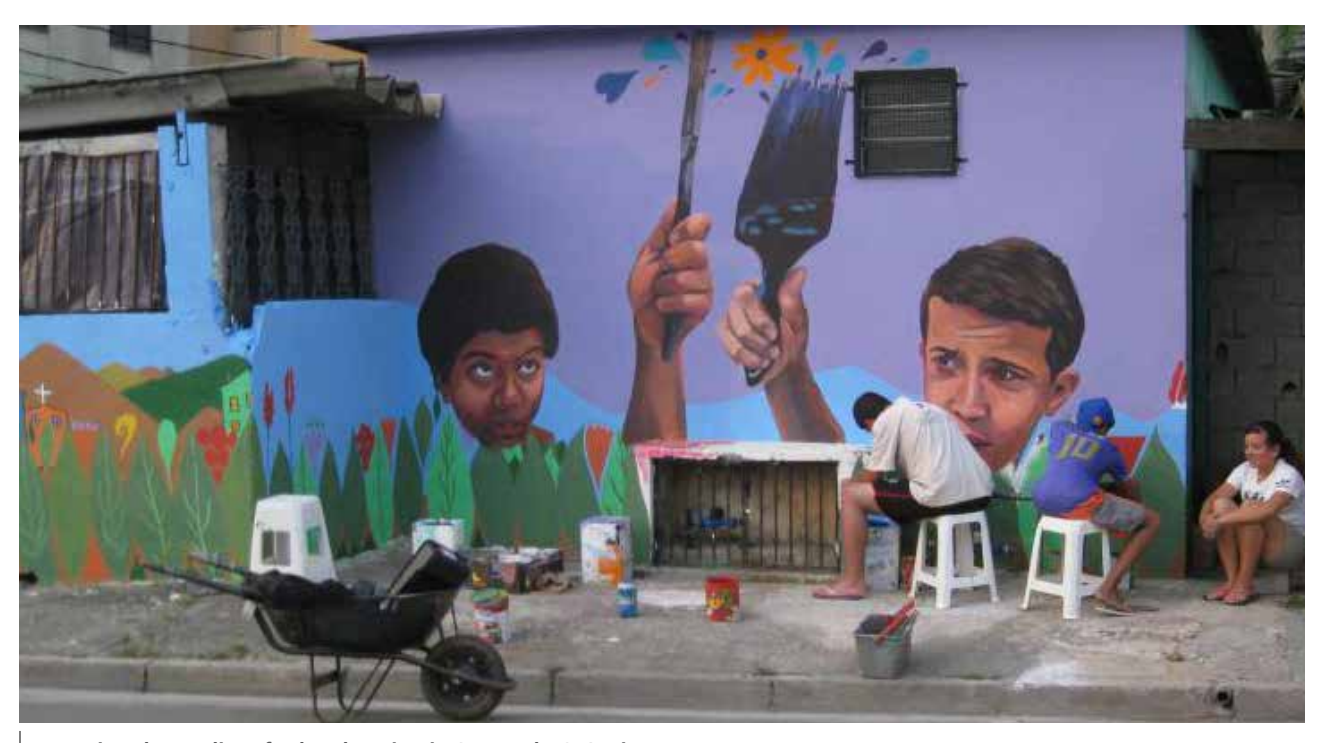
Improving the quality of urban housing in Sao Paulo © Conjunto Pretes.

Financial resources have been allocated and bound to investments in institutional improvement, land regularization, technology acquisition and capacity building. The federal, state and municipal rural land institutions work together closely based on a priority policy previously agreed upon. A modern multifunctional cadastre based on a geo-referenced information system is in progress and will comprise of land information from government land-related institutions. Efforts to combat forgery have been made and special funds are allocated for urban land issues. In addition, a ministry has been established to deal with land issues, especially urban issues: this ministry