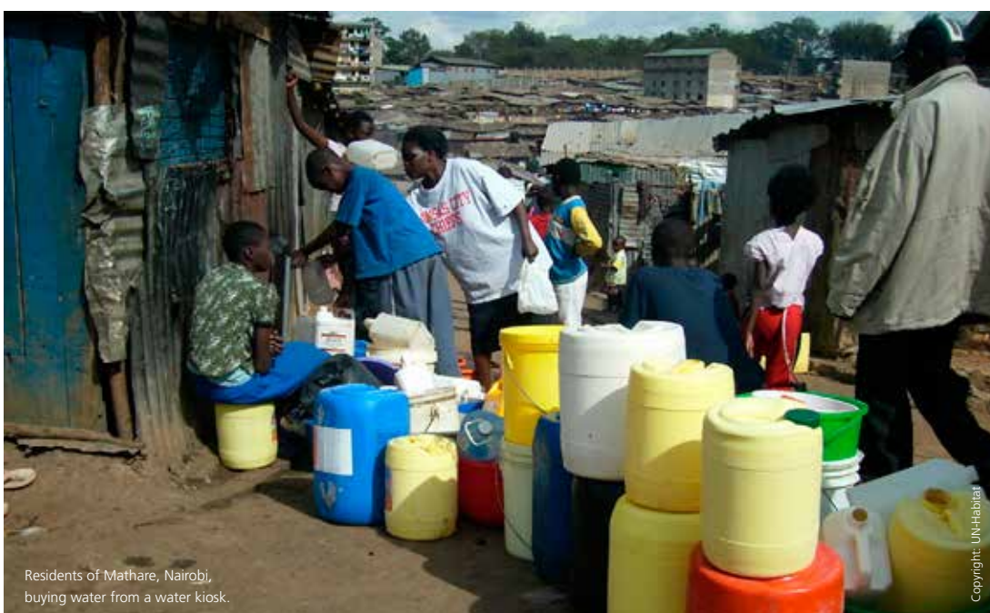
Residents of Mathare, Nairobi, buying water from a water kiosk.

UN-Habitat, Nairobi Water and Ericsson are now entering the second phase of this joint research project in order to investigate, evaluate and possibly test a connected water infrastructure in informal settlements in Nairobi. In this phase, the concept and the scenarios serve as a way to frame the conversations with stakeholders. And to develop the concept as one component in a sociotechnical system, recognizing the interaction between human behaviour, society and its institutions (i.e. informal and formal laws, structures, hierarchies, regulation and norms) and technology.