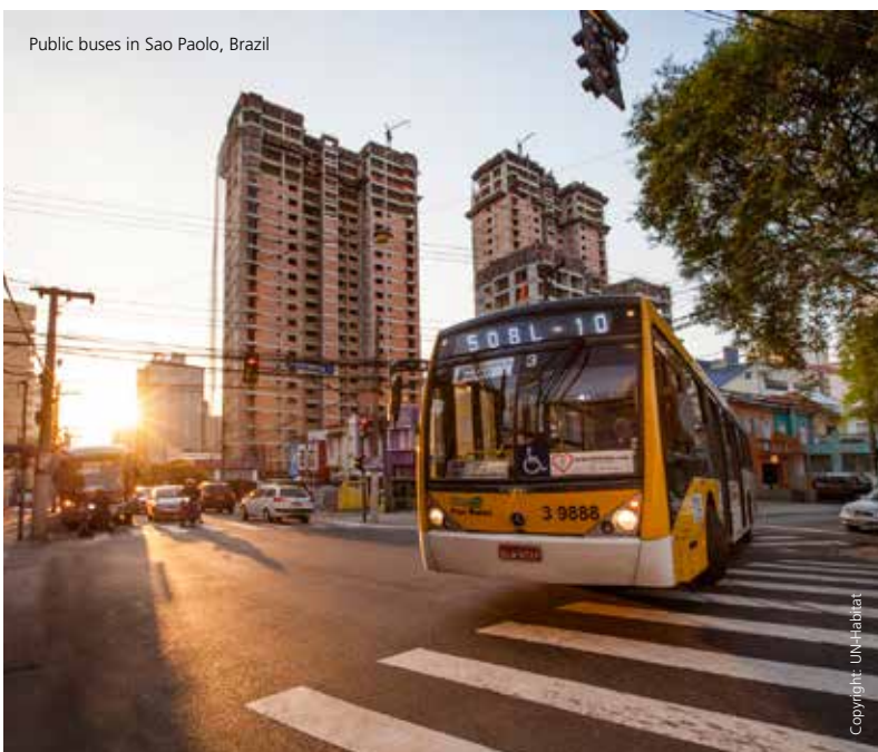
Public buses in Sao Paolo, Brazil

Finally, in the high reduction scenario, home energy and management systems, temperature monitoring and control and smart grid solutions were included. This increases the added energy consumption and CO 2 emissions related to the technology itself, but the potential reductions is now increased to 10 percent. However, the high reduction scenario is not likely to be achieved in the near future, at least not across average households. Nevertheless, especially if combined with visualization systems and feedback mechanisms for users, it is a realistic scenario for the future.