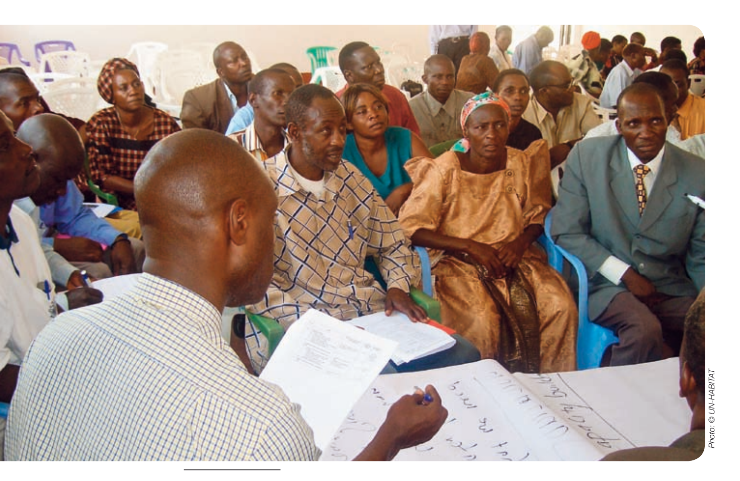
13. International Finance Corporation. 2007. Stakeholder Engagement: A Good Practice Handbook for Companies Doing Business in Emerging Markets, Washington D.C.

Workshops were held in the participating towns to sensitize stakeholders and build local consensus on the proposed immediate interventions. The workshops were held in Kyotera (Uganda) on 15 December 2005; Homa Bay (Kenya) on 24 January 2006; Kisii (Kenya) on 27 January 2006 and Nyendo (Uganda) on 3 February 2006. Additional stakeholder workshops have also been held in Bukoba, Muleba and Mutukula.