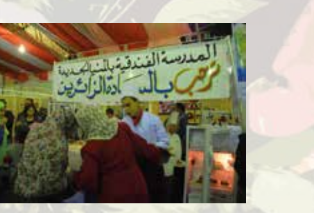
Youth employment is a top priority on the development agenda of the Governorat of Minya

HAYAT is supporting the Governorate of Minva in upgrading/expanding local infrastructures. The above photo shows a newly installed water connection in Salagos Village in Edwa District, Minva.