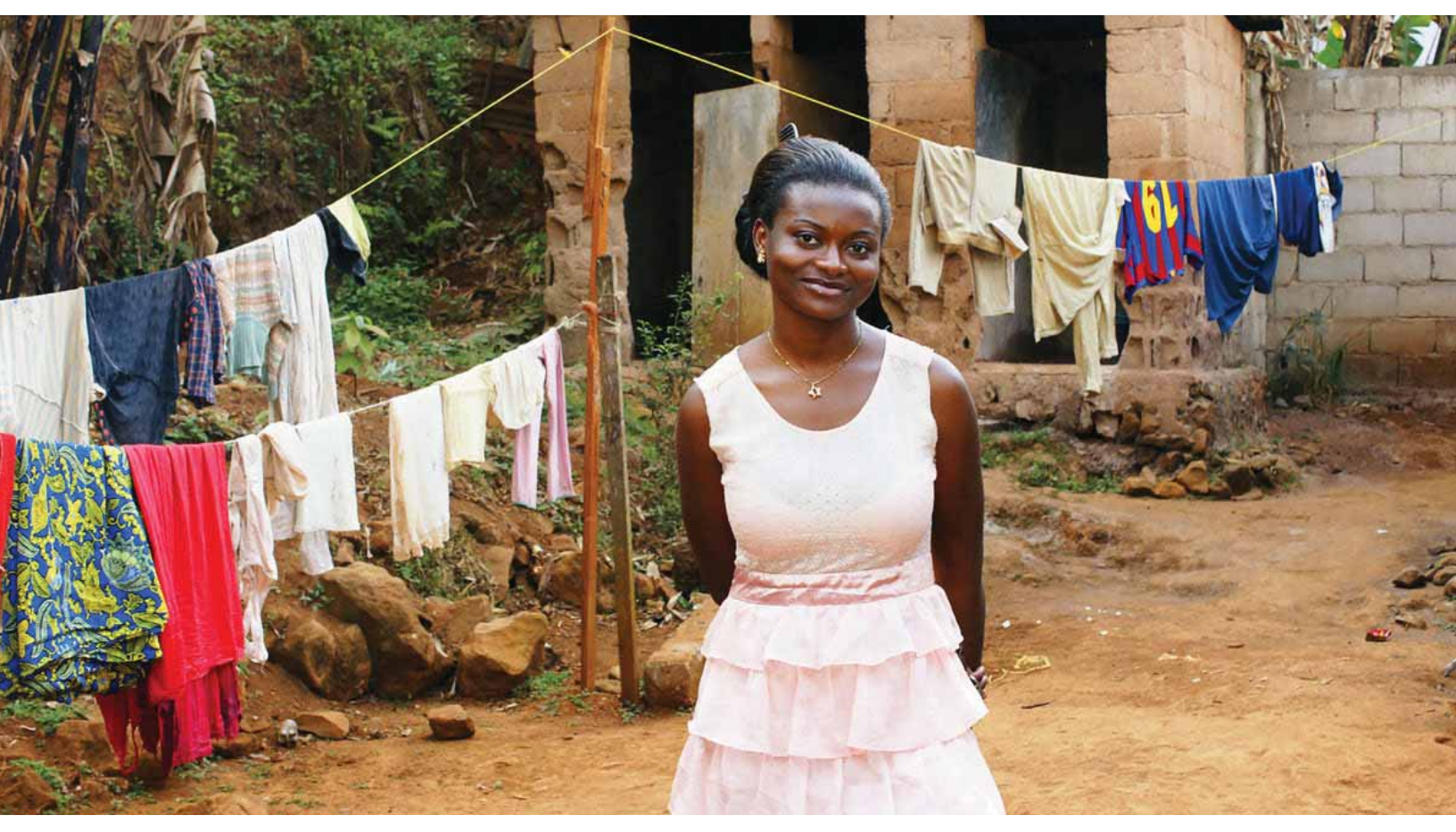
Beautiful young African woman in backyard with clothesline.

with the competence to ensure that gender-related project outputs and expected accomplishments are pursued actively.