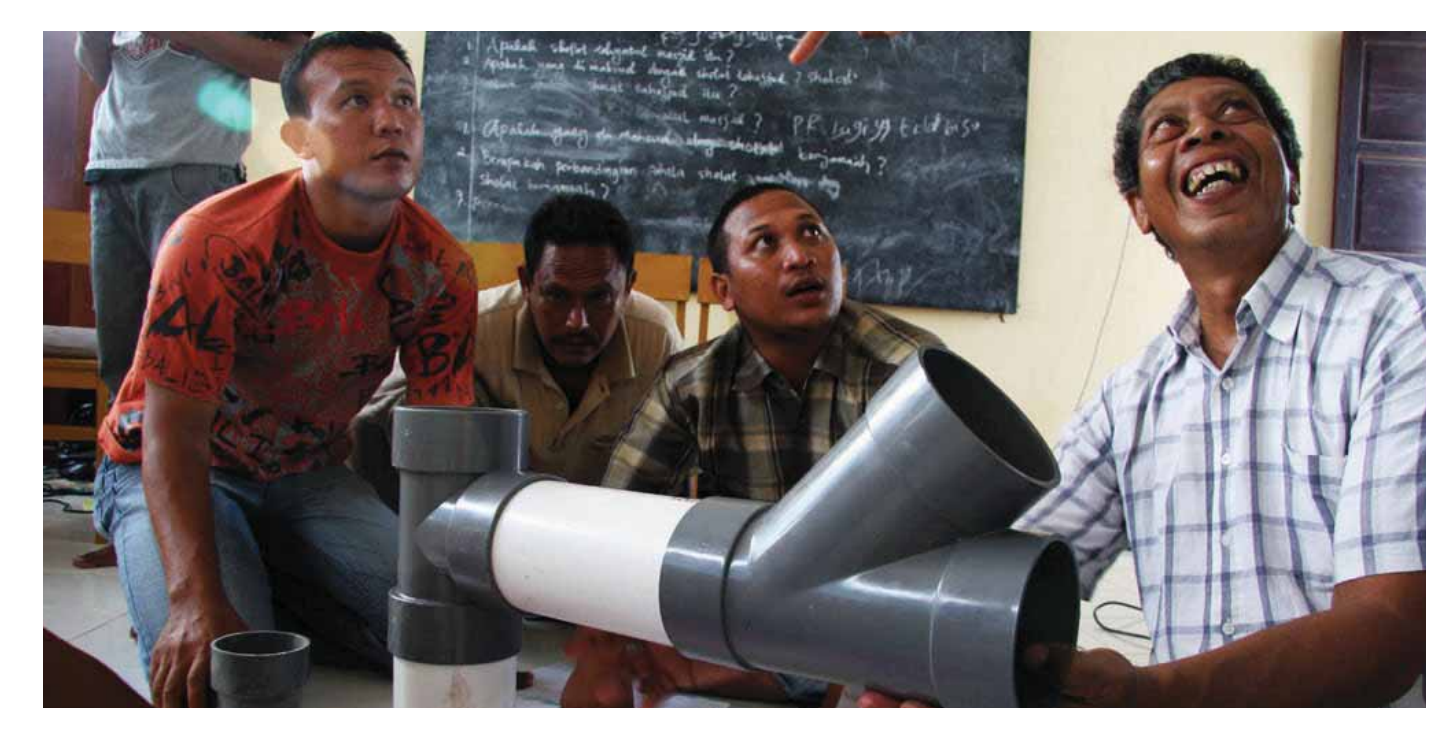
ASAAP, Indonesia.

Governing Council Resolution 23/11 of April 2011, requested the Executive Director to ensure that the Strategic Plan 2014-2019 has the achievement of gender equality and empowerment of women as one of its objectives, with gender results defined at the higher and lower levels of the expected accomplishments and gender outputs per focus area clearly integrated into the work programme.