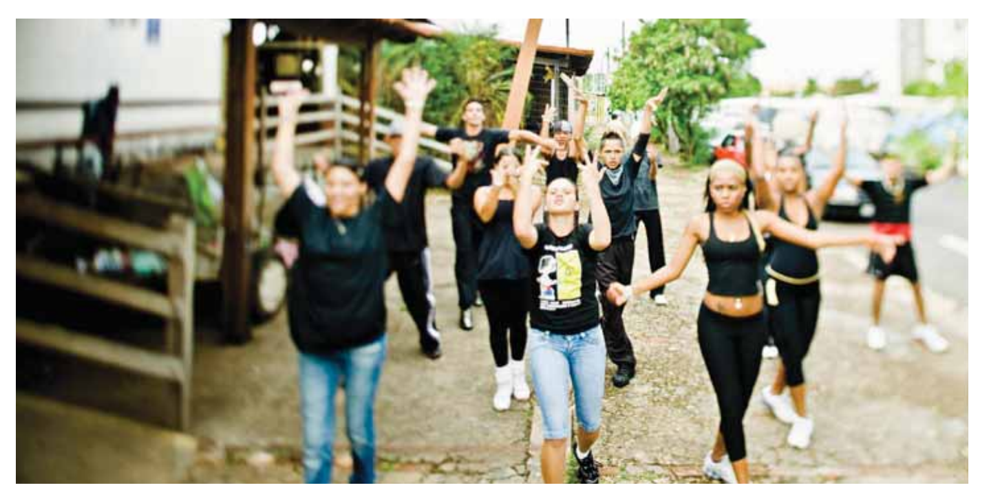
Youth participation, Uberlandia, Brazil.

men's concerns and experiences an integral dimension of the design, implementation, monitoring and evaluation of policies and programmes in all political, economic and societal spheres so that women and men benefit equally and inequality is not perpetuated. The ultimate goal is to achieve gender equality<sup>9</sup>.