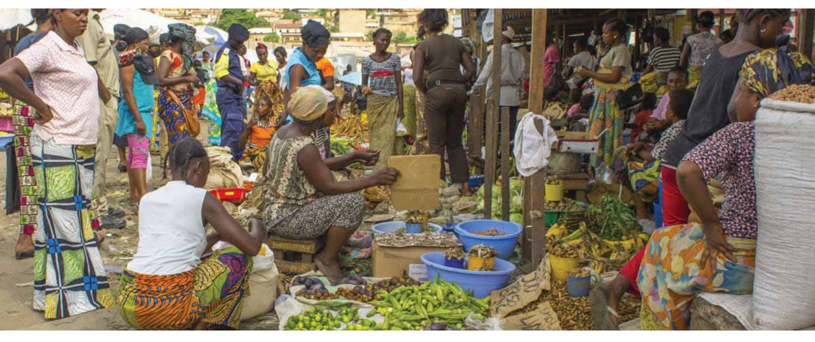
Open food market in Matadi, Democratic Republic of the Congo. Circa January 2014.

Where there is risk of shortfall in any of the commitments made in this document, the Office of Internal Oversight Services will be invited promptly to undertake an audit, so that remedial action can be taken in a timely manner.