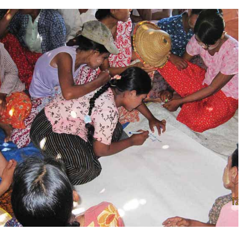
women role in community development, Myanmar.

To this end, all instructions to Branches, Regional and Liaison offices to prepare periodic reports on implementation of the SP 2014-2019 will also request reports on implementation of this Policy and Plan, and its corresponding Work Plans, leading to development of a joint report for submission to governments<sup>43</sup>.