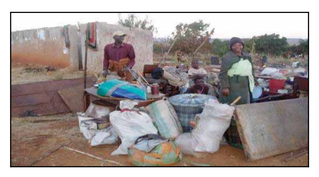
Evictions and Demolitions in Hatcliffe Extension, Zimbabwe

In the wake of Operation Murambatsvina and Zimbabwe's economic crisis, millions of evictees continue to face poverty, malnutrition, starvation and disease. In June 2005, the Government of Zimbabwe launched Operation Garikai/Hlalani Kuhle (Better Life) to provide housing to many of those who lost homes under Operation Murambatsvina. However, over one year after the programme was launched; the Government had built approximately 3,325 houses, to accommodate those left homeless from the destruction of approximately 92,460 structures. At least 20 percent of the houses were earmarked for civil servants, police and soldiers, while some victims of Operation Murambatsvina were provided small plots of land without assistance with which to build homes. Furthermore, many of the homes designated as "built" are not finished, do not have water and sanitation facilities, and have not been allocated. In fact, even if a victim of Operation Murambatsvina was able to access a home through the highly corrupt allocation process, the majority of victims would not be able to afford the homes.<sup>111</sup>