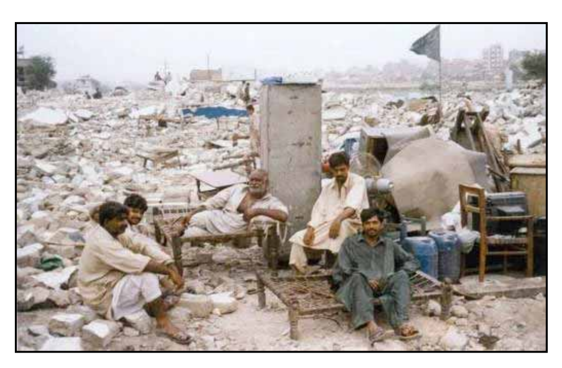
Aftermath of a forced eviction, Lyari Expressway, Karachi, 2002

Forced evictions invariably fail to deliver the outcomes claimed for them by the implementing governments or agencies. In many instances, large-scale evictions are intended as an antidote to uncontrolled and unauthorised urban settlement, in the hope that this will encourage investment and development. However, the causes of rural-urban migration are so varied and deep-seated, the resulting population pressure on cities so overwhelming, that resorting to forced eviction as a solution to illegal settlement amounts to little more than a futile gesture. Evicted individuals, families and communities do not disappear. Nor do they tend to remain for long if relocated to far-flung areas. They tend to find their way back to unoccupied land closer to services and survival opportunities and to resettle and rebuild, as before. In addition, by focussing on the need to get people away from an area, governments often miss the very unique developmental opportunities presented by informal settlements. Properly conceived and implemented settlement upgrading, done in close consultation with the affected parties, has proven itself as a much more effective option in addressing urban development challenges, with great potential benefits for all concerned.<sup>15</sup>