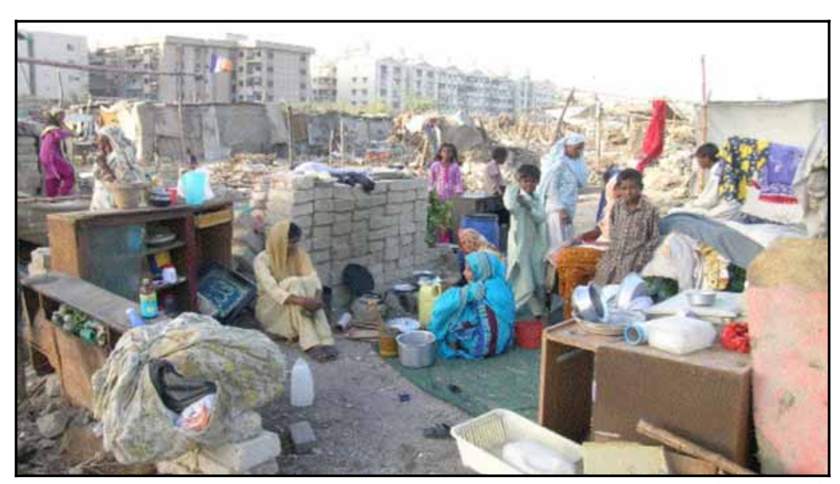
Aftermath of Evictions in Jumma Goth