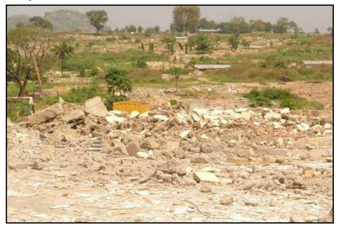
Demolished homes of Kuchigoro settlement, Abuja: November 2006

Since EI-Rufai's appointment as Minister of the FCT in 2003, the FCDA has targeted over 49 such settlements in Abuja for demolition, arguing that land was zoned for other purposes under the Master Plan and, in some cases, has already been allocated to private developers. To date, these evictions have affected approximately 800,000 people, as estimated by local organisations. Although the FCDA argues that this number is inflated, they have not released their own figures from their enumerations of the informal settlements.