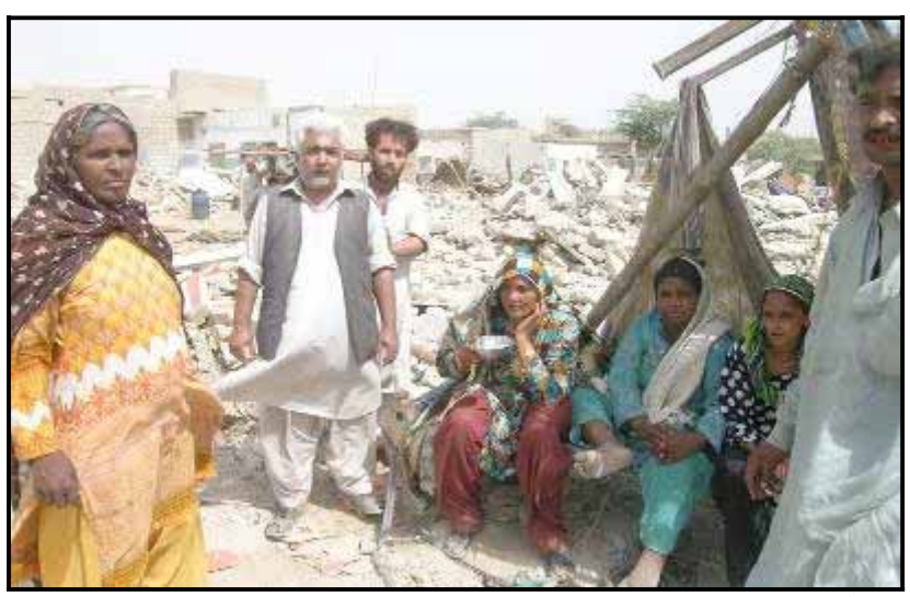
Recent demolitions in Sikander Goth, Pakistan

The communities are being supported by Eviction Watch – Asian Coalition for Housing Rights, and Urban Resource Centre (URC), Karachi