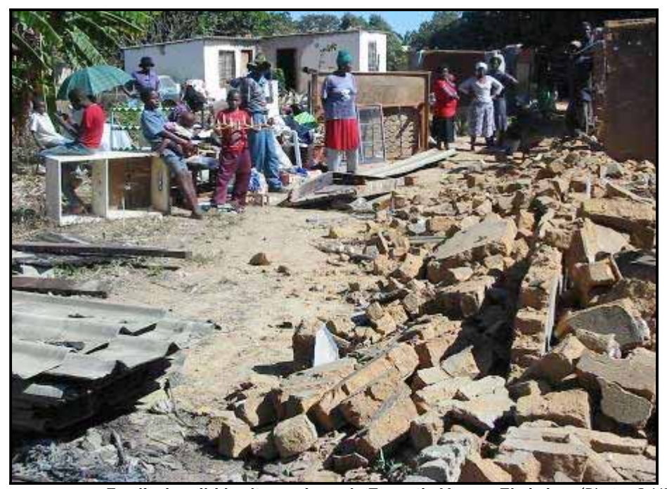
Family demolishing its own house in Epworth, Harare, Zimbabwe

Evictions were carried out without notice or court orders and with disregard for due process and the rule of law. During the forced evictions, police and security forces used excessive force. Reportedly, several children have died during the demolitions. There are also reports that police deterred civil society organisations from providing assistance to those affected. For example, on the night of 26 May 2005 more than 10,000 people were forcibly driven from the informal settlement of Hatcliffe Extension in Harare, where people had been settled by the Government itself.<sup>110</sup>