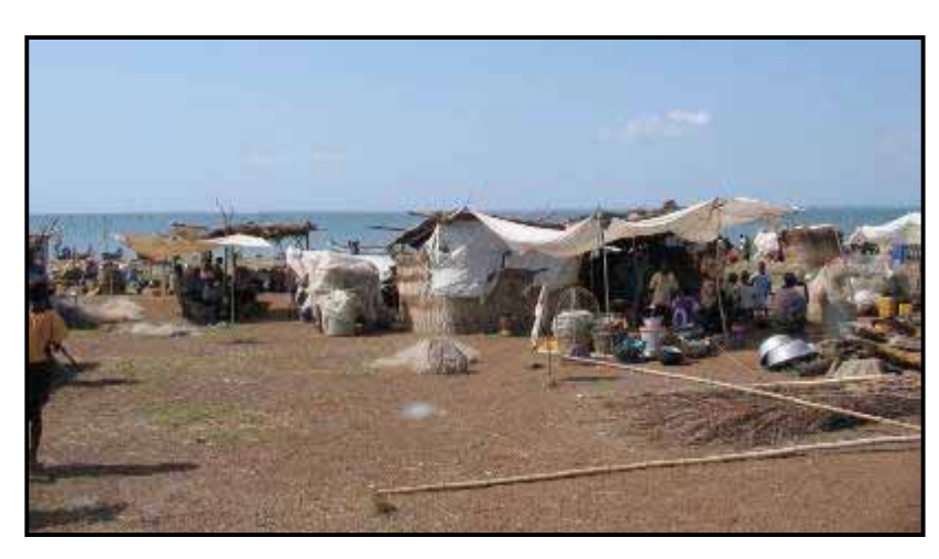
Evictees forced to camp at Mankyere Island, 5 May 2006

The Minister of Ports, Harbour and Railways instituted an inquiry on the boat disaster and presented their findings to the Government of Ghana, which promised to release a white paper on the findings.