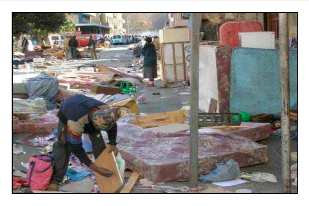
Evicted residents scramble to save and protect their possessions – Bree Street, Johannesburg, 2005