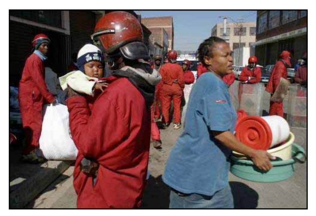
Forced eviction in progress: Johannesburg, 2004

The judgment is a partial victory for the inner city poor. The law is now clear on the point that the inner city poor cannot be evicted without any alternative accommodation. However, the judgement has effectively denied the right of inner city residents to live near their place of work. The judgment appears to condone the City's practice of denying adequate hearings to affected residents before taking decisions to evict, and effectively leaves it to the City to decide if and when the occupiers of "bad" buildings should be consulted prior to future eviction applications." 45