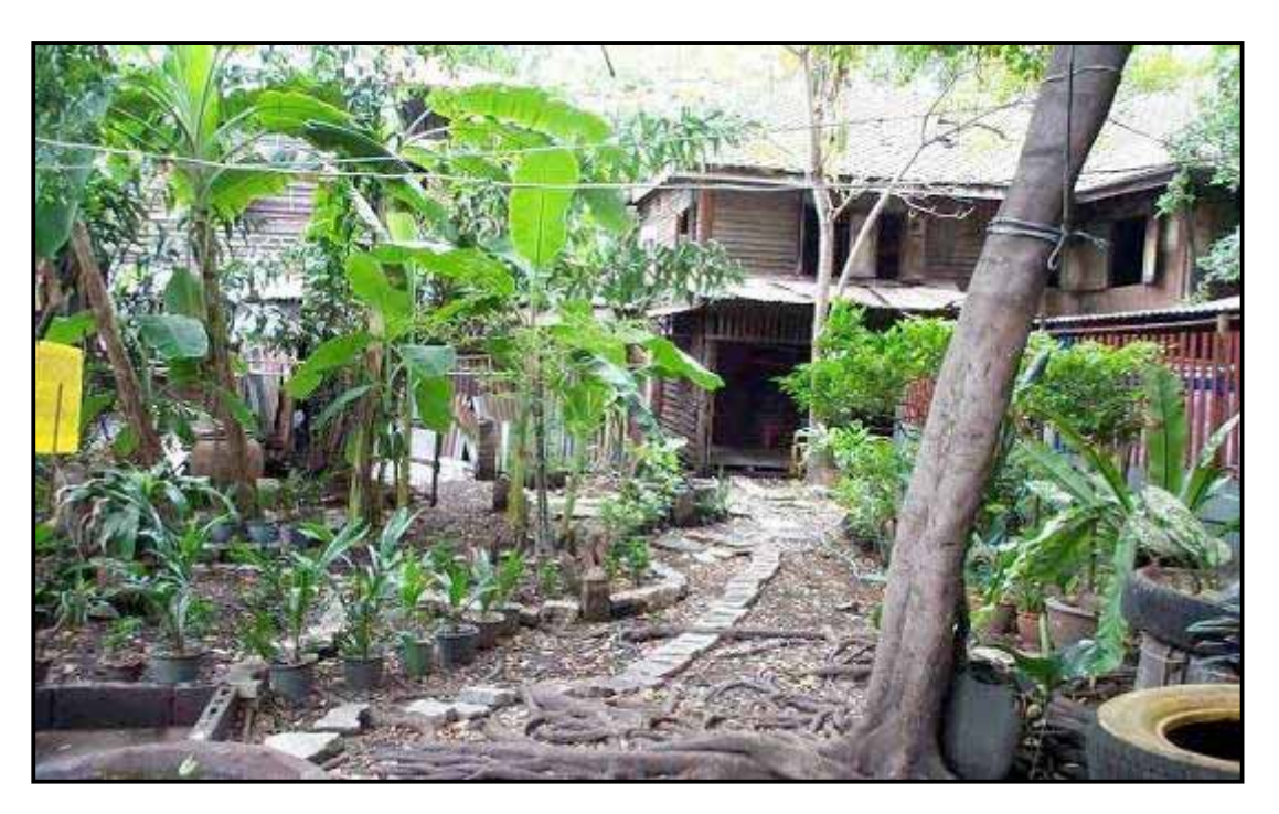
Community demonstration garden: Pom Mahakan, Bangkok

Administration and the University had resulted in an agreement to preserve and develop the area as an 'antique wooden house community'. 43