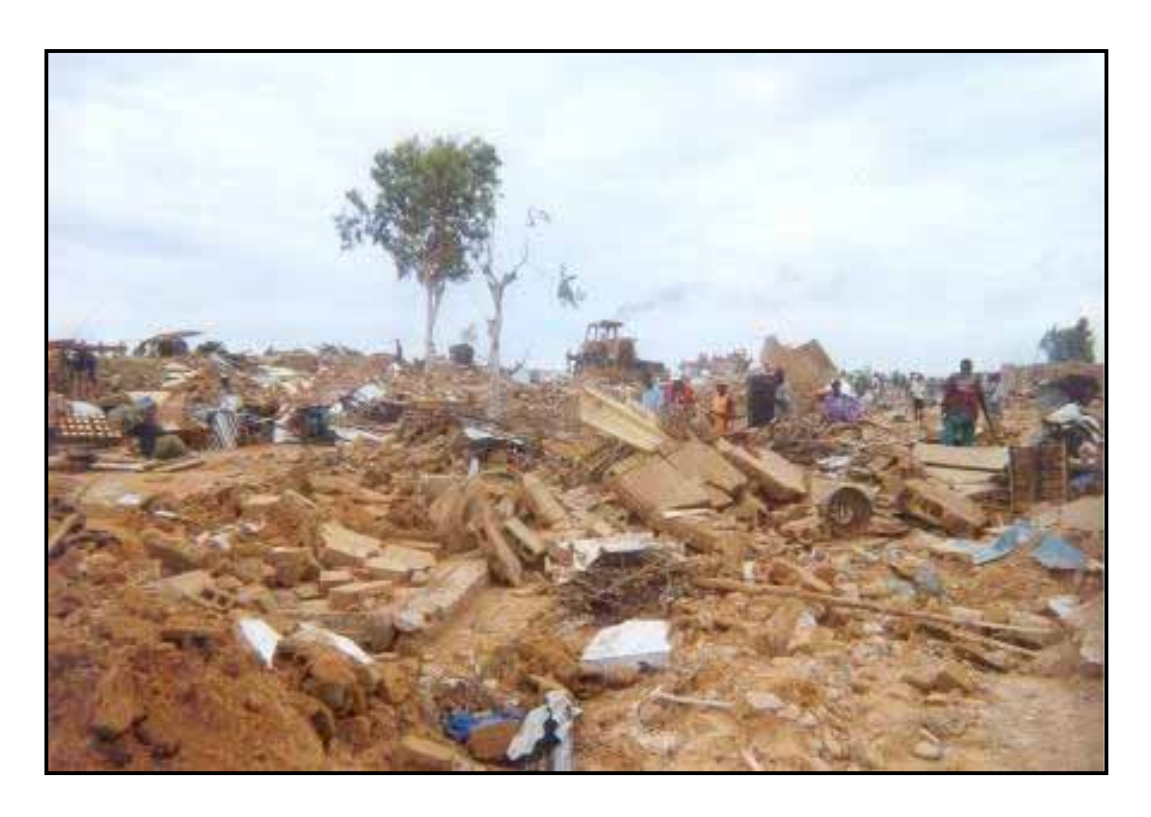
Bulldozer governance: Senegal September 2002

As the outspoken author Wole Soyinka said in protest to the events in Zimbabwe, "Bulldozers have been turned into an instrument of governance and it is the ordinary people who are suffering."<sup>37</sup> Subsequent evictions in Abuja (Nigeria), Digya Forest (Ghana) and others in Pakistan, Angola, China and elsewhere, seem to indicate that this is indeed the emerging trend.