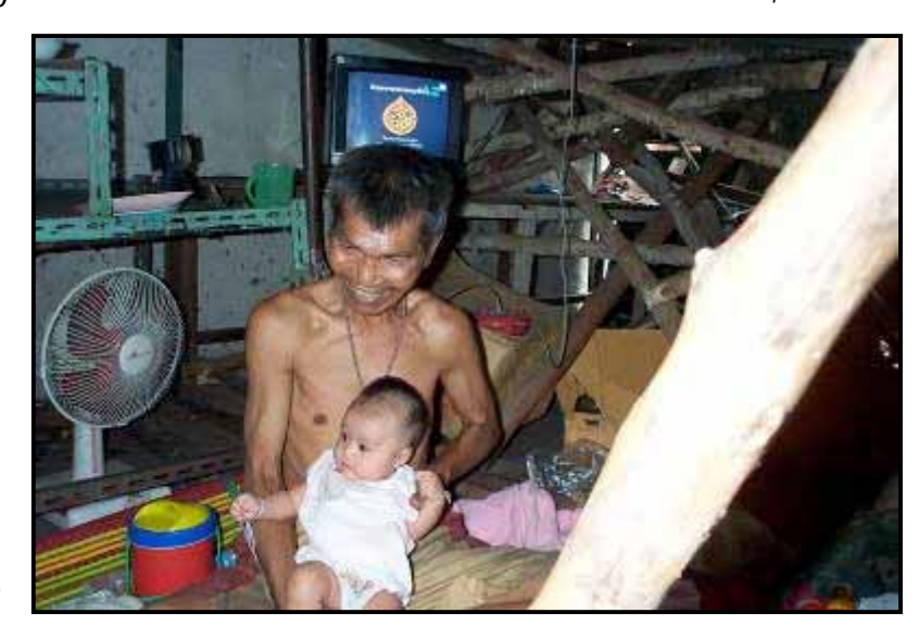
Guarding a barricaded entrance: Pom Mahakan

the old city wall and the canal in central Bangkok, Thailand. In January 2003, the Bangkok Metropolitan Administration (BMA) served the residents with a notice to vacate their homes. Residents were offered relocation to a place 45 kilometres away, on the outskirts of Bangkok. The proposed relocation was part ٥f the Governmentsponsored Rattanakosin Island development plan, to make way for a manicured urban park.