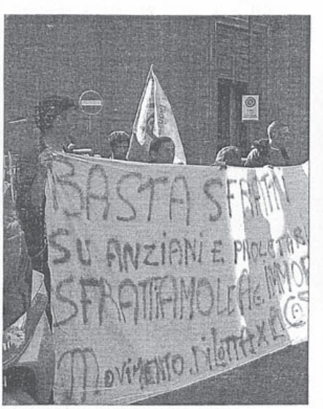
Sfratti sotto i riflettori Sull'emergenza casa c'è un'iniziativa internazionale

messaggio rassicurante rispetto alla messaggio rassicurante rispetto alla situazione abitativa in Italia. "Abbiamo voluto stendere, in base ai dati in nostro possesso – continua Simoni – un vero e proprio contro-rapporto, che illustrasse la realtà