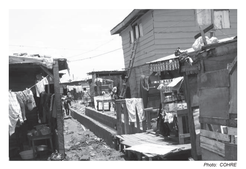
Community members constructing drainage trench Agbogbloshie, Accra, Ghana

In general terms, the field visits conducted have revealed that this community is well organised. Striking levels of initiative is evident in the management of issues affecting the whole community. These include, for example, the arrangement of water points, wash houses, the digging of drains and fire-fighting. At the economic level, the general activity is even more striking, and indicative of a complex, diversified economic sector.