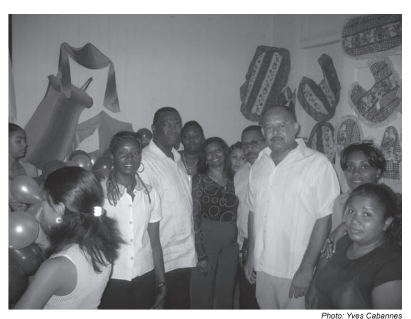
The AGFE team met with the Mayors of Boca Chica and