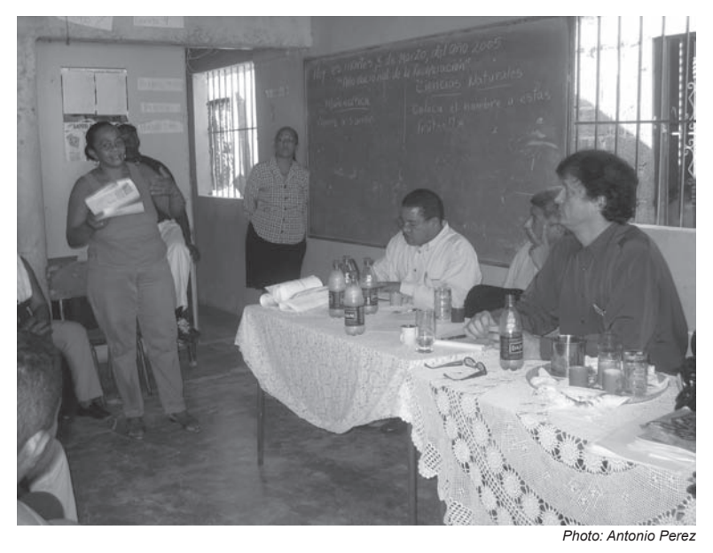
A resident holding her title deed addresses the AGFE Mission team during a consultation in the Dominican Republic

Other neighbourhoods presented their experiences and testimonies during the Public Session which the AGFE Mission held on Saturday 12 March 2005. A dossier containing testimonies, press clippings, Dominican legal documentation was also delivered to the team by Espacio de Coordinación Urbano Popular and other organizations.