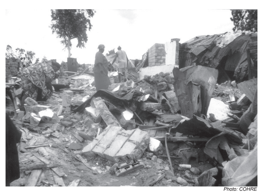
Eviction, Captage, Senegal - September 2002

The reason given for the evictions was the irregular occupation of zones designated by lease to several people. The evictions were instituted by the Governor of Dakar and the Mayor of the Common District of Grand Yoff. The evictions were implemented by the Deputy-Prefect and the policemen of Hann. The duration of the summons issued was from 20 February – 15 April 2004. Offers of relocation were made verbally by the Mayor of Dakar, who was also the President of the National Assembly.