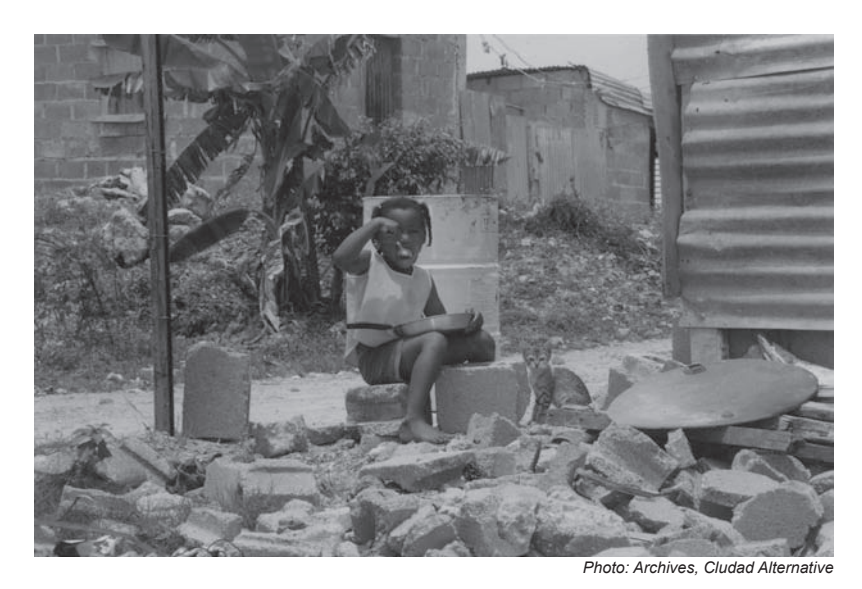
During public consultations the AGFE mission heard testimony of forced evictions at places such as Brisas del Este in 2004

The Mission received ample documentation and testimony about evictions and had the opportunity to directly assess the situation in visits to barrios and in massive meetings, such as Valiente, Isabelita, Brisas del Este, Los Tres Ojos and Parque del Este; and at the Public Audience with some 500 persons on Saturday 12 March 2005. Thousands of families participated in the Mission visit to Villa Esfuerzo, the barrio subject to eviction, on Sunday 13 March 2005.