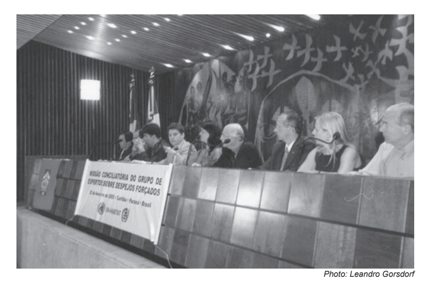
AGFE Public Hearing, Curitiba, 25 February 2005