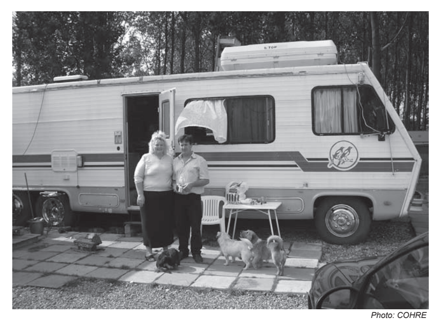
Two UK Gypsies outside their caravan at Woodside, UK. This couple have resisted eviction for years to protect their lifestyle.

The current legislation, which criminalises Gypsies and Travellers from stopping anywhere along the road, together with the fact that public caravan sites are being reduced and are often inadequate, also constitute important factors explaining why this group is becoming more and more sedentary. However, a large psychological barrier to living in a built home remains, and psychological and physical problems often ensue after a Gypsy or Traveller has moved into a bricks and mortar house. Many Gypsy and Traveller communities still want to live in their caravans, albeit that the caravans may be standing still. Hence, they face serious difficulties and constraints due, among other factors, to the existing legislation and prejudices against them.