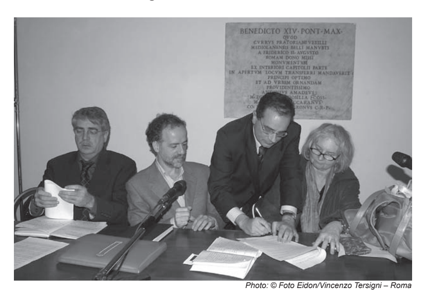
Signature of the joint statement between the Municipality of Rome and the AGFE Mission 19 February 2005