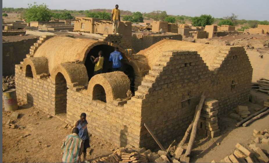
A vaulted house being constructed in Burkina Faso. Earth bricks make the structure, which is then finished with water repellent mud mortar.

Building with cob, rammed earth and adobe all present similar benefits, considerations and challenges. Earthen homes are generally best suited to hot and dry climates, since earth is a thermal mass and responds well to daily and seasonal changes in temperature. Structurally, earth has good load-bearing and compressive strength, but is much weaker when it performs in tension. Additive materials like straw (used to make cob) will enhance tensile capacities while structural frames made from wood or bamboo (used for rammed earth and adobe) can absorb perpendicular forces. Tensile and structural reinforcement also improves resistance to certain climatic challenges such as strong winds and earthquakes though generally earth may not be the best choice in disaster prone areas.