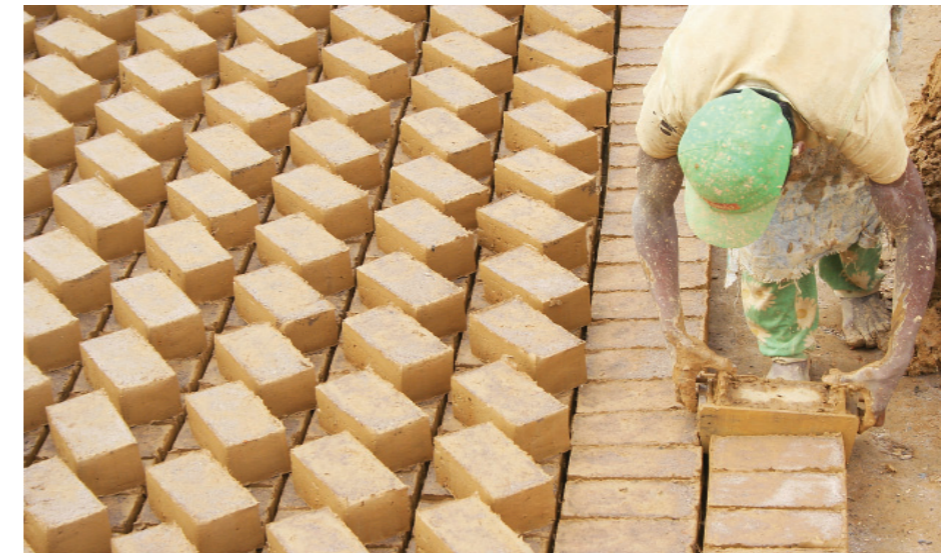
A worker forms traditional craftsmanship adobe bricks and sets them to dry in a construction site in Madagascar

ibility and earthquake/hurricane resilience. Building with ISSBs is advantageous since they need less cement than conventional bricks.