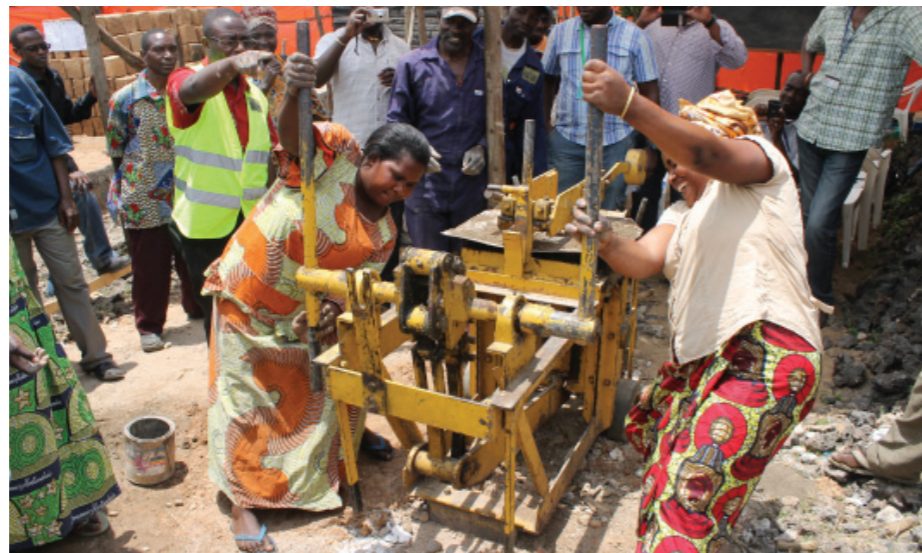
Women use press to make unstabilized soil blocks in DRC

CEBs are made with moist soil that is poured into a steel mold, compressed and cured for approximately four weeks. A single press can produce between 250-350 bricks a day. Compared to adobe bricks, CEBs can build taller and thinner walls with better compressive strength. The production of CEBs is both more cost and energy-efficient than adobe, and is adaptable to a wider range of climate types.