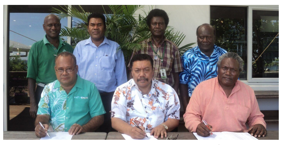
The Honiara Urban Resilience and Climate Action Plan has been formally endorsed by Honiara City Council and the Government of the Solomon Islands.

This joint effort led to the release in 2016 of the Honiara Urban Resilience and Climate Action Plan. This plan