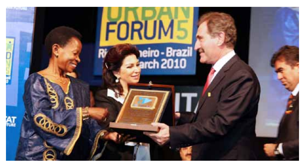
Turkish Minister of Culture and Tourism, Mr. Ertuğrul Günay receives on behalf of Turkish Prime Minister, the inaugural Rafik Hariri UN-Habitat Memorial Award during WUF 5, Rio de Janeiro. 2010