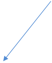
Figure 2: UNDAF III Results Framework Overview 38