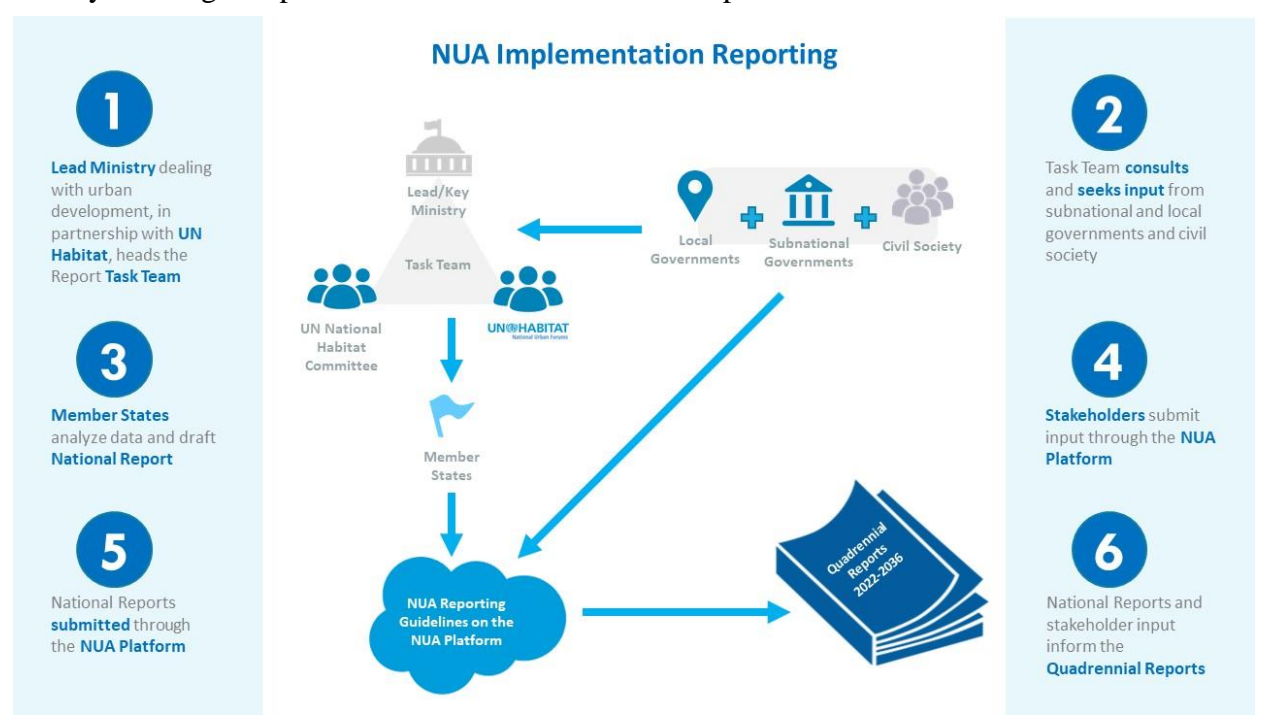
Figure 1. Inclusive NUA Implementation Reporting Procedure

NUA National Reports will provide essential inputs to the Secretary General's Quadrennial Reports, efforts to measure implementation of the New Urban Agenda and SDG-11. Best practices, lessons learned, and case studies included in the report will contribute to country-to-country learning and provide a common resource for implementers.