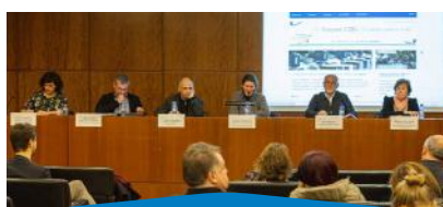
“Ciudades para la Vida. Equidad Urbana en el desarrollo”