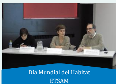
Día Mundial del Habitat ETSAM

- Superior Technical School of Architecture of Madrid (ETSAM) (Madrid, 7 Noviembre): the ETSAM hosted the last event celebrated during the Urban October that