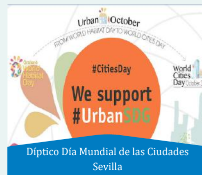
Díptico Día Mundial de las Ciudades Sevilla

- Sevilla, 27 October 51 : Support to the MINFOM of the Regional Government of Andalucía for the celebration of the World Cities Day 2014 in Andalucía. Among the people who participated were the General Director of Rehabilitation and Architecture of the MINFOM of the Regional Government of Andalucía and two Cooperation Coordinators of the Regional Government of Andalucía.