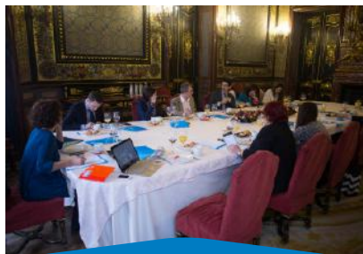
Meeting with Mass Media