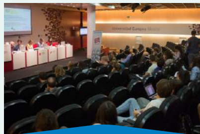
Día Mundial del Habitat Universidad Europea de Madrid