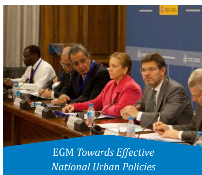
EGM Towards Effective National Urban Policies

55 experts participated in this EGM, organized in collaboration with Barcelona City Council, Cities Alliance and the Spanish MINFOM. The aim was to share recent experiences and best practices on National Urban Policies (NUP), and develop a comprehensive “roadmap”, as well as a Communiqué 19 , to serve as a strategy in the implementation of these urban policies at the national and local levels.