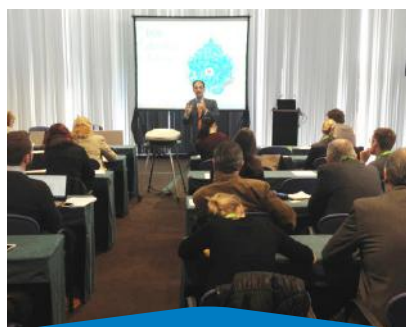
Urban Journalism Academy en el Smart City World Congress