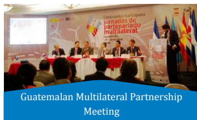
Guatemalan Multilateral Partnership Meeting

- Participation at the Guatemalan Multilateral Partnership Meeting organised by ICEX, to promote the collaboration between local and Spanish companies. 14 Spanish companies and representatives from UN-Habitat attended a round table on “Emerging and Sustainable Cities in Latin America”; Guatemala, 27-30 October 2014.