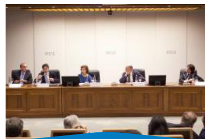
“Smart and Human Cities”. IESE