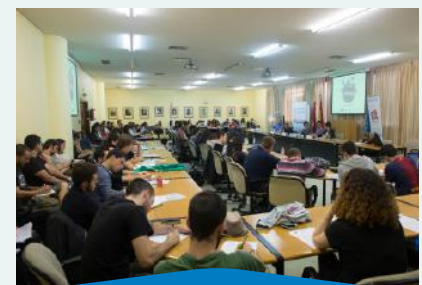
Día Mundial del Habitat Universidad Complutense de Madrid