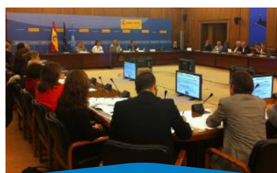
Habitat Committee in Spain. 31 October 2014

• Support to the Habitat Committee in Spain: The General Directorate of Architecture, Housing and Land (MINFOM), with the support of UN-Habitat, organized two meetings of the Habitat Committee Spain during 2014 (22 May and 31 October). These meetings informed about the outcomes of the VI World Urban Forum, the preparatory process towards HABITAT III, presented the Habitat III National Report prepared by the MINFOM 11 .