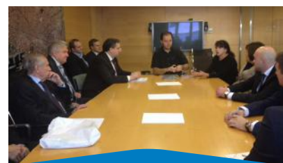
Mission of high authorities of the Saint Petersburg City Council

- Mission of high authorities of the Saint Petersburg (Russia) City Council. A delegation composed of 16 representatives 3 travelled to Barcelona, where management models and mobility policies, the relationship between both cities, and other experiences on “Smart Cities” were debated; Barcelona, 18-21 November 2014.