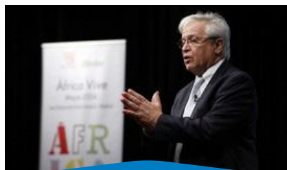
“Ciudades africanas. Reto urbanístico y social”. Casa África

Conference at the round table “African cities. Urbanistic and Social Challenge”, organised by Casa Africa at the Cervantes Institute; Madrid, 12 May 2014 38 .