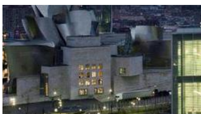
Working meeting SMART LOCAL GOVERNANCE: The challenge of good governance in local administrations