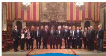
Misión de altas autoridades del Ayuntamiento de San Petersburgo