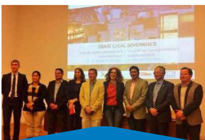
“Smart Local Governance: El Reto de la Buena Gobernanza en la Administración Local”