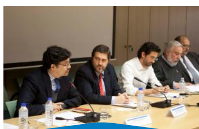
“La Nueva Agenda Urbana en América Latina”. SEGIB