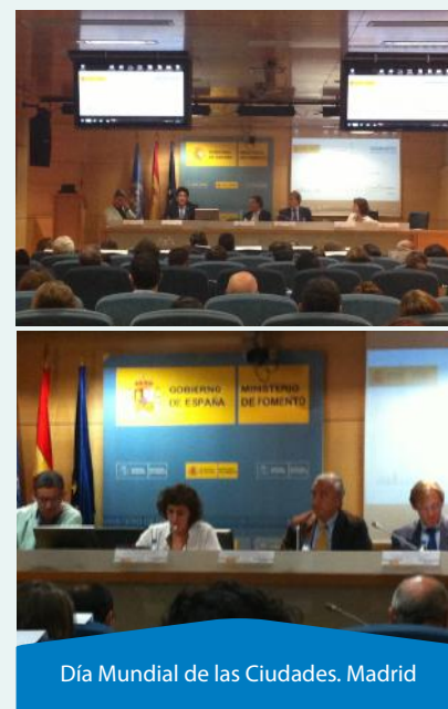
Día Mundial de las Ciudades. Madrid

Habitat Committee and the civil society.