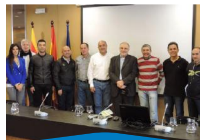
Mission of Local Authorities of the Metropolitan Area of the Valle de Aburra

- Mission of high authorities of the Saint Petersburg (Russia) City Council. A delegation composed of 16 representatives 3 travelled to Barcelona, where management models and mobility policies, the relationship between both cities, and other experiences on “Smart Cities” were debated; Barcelona, 18-21 November 2014.