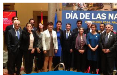
UN Day in Spain 24 October 2014

• Support to the organization and participation in the United Nations Day celebration where the Minister of Foreign Affairs and Cooperation of Spain and the Secretary General of the World Tourism Organization, along with representatives of UN Agencies in Spain participated; Madrid, 24 October 2014.