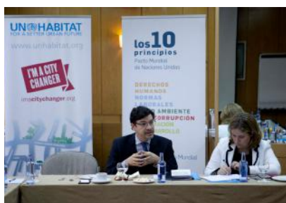
Meeting with UN Global Compact Companies