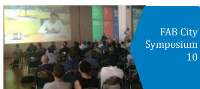
FAB City Symposium 10