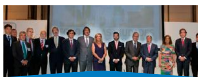
Foro de las Ciudades. IFEMA