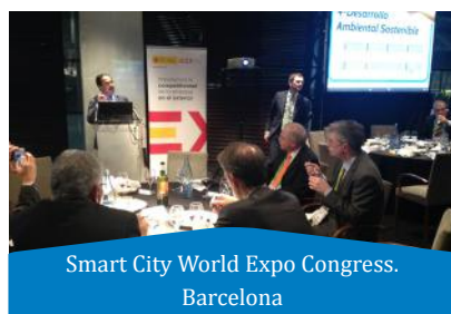
Smart City World Expo Congress. Barcelona

- UN-Habitat's participation at a meeting organised by ICEX during the Smart City World Expo Congress. Representatives from more than 80 Spanish private companies attended; Barcelona, 10-12 November 2014 62