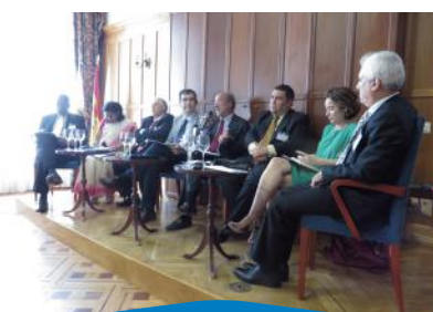
“Tecnologías Smart para la sostenibilidad municipal”

Additionally, during 2014, technical assistance was provided in response to requests from several cities and international institutions. Access to technical knowledge learning opportunities was facilitated, allowing the provision of solutions on a urban multi-sectorial basis: