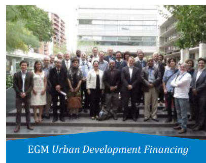
EGM Urban Development Financing

39 experts debated on how to improve the key elements that local authorities need in order to effectively use the different financing mechanisms to implement plans for city extension and other urban development projects.