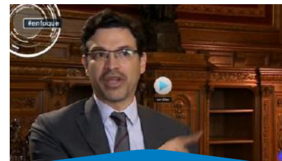
Report "La tecnología: una herramienta para las ciudades del futuro"