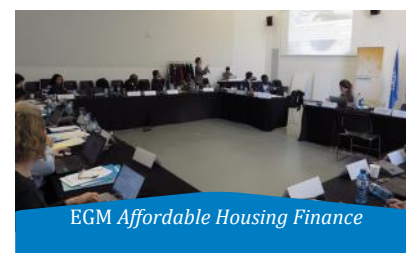
EGM Affordable Housing Finance

28 international experts, contributed their perspectives and recommendations with aim to reviewing and improving focus and impact of UN-Habitat programmes (“enabling approach”) for the financing of an affordable and inclusive housing 26 .