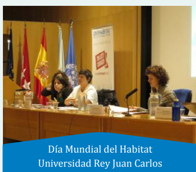
Día Mundial del Habitat Universidad Rey Juan Carlos

- Rey Juan Carlos University (Madrid, 6 November): Round table to which 60 students attended, including participation of the Dean of the Rey Juan Carlos University, the Director of the Rey Juan Carlos University Foundation, the Coordinator of the UN Millennium Campaign for Europe and Latin America and academics of the School of Architecture.