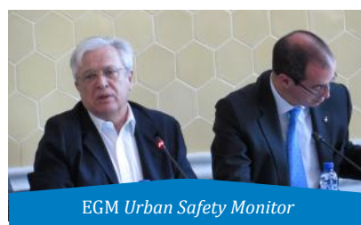
EGM Urban Safety Monitor

49 experts met to promote the “Urban Safety Monitor” prototype that facilitates the formulation of public policies and strengthens the accountability of local governments through monitoring and analysis of security indicators in several cities. Specific indicators and existing vigilance systems were reviewed.