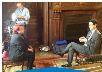
Interviews with Media