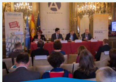
Conversatorio Casa América

Casa América, of a round table with participation from the Director of the UN-Habitat ROLAC, the General Directorate for Architecture, Housing and Land of the Spanish MINFOM, the Deputy Director for Development Policies of the Office of the Secretary-General for Development Cooperation (SGCID) of the Ministry of Foreign Affairs and Cooperation, the Secretary General of the Superior Council of the Spanish School of Architects, and representatives of the Superior Technical School of Architecture of Madrid and Media.