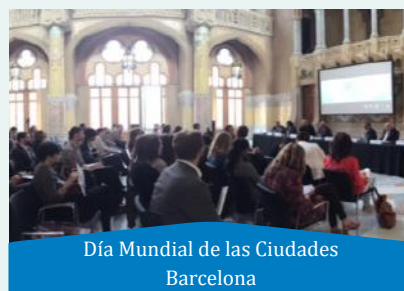
Día Mundial de las Ciudades Barcelona

- Barcelona, 30 October: UN-Habitat Programmes established in Barcelona (Global Water Operators' Alliance –GWOPA- 48 and City Resilience Profiling Programme 49 ), together with the Barcelona City Council and the Sant Pau Foundation, celebrated the first annual World Cities Day and presented the work both programmes develop.