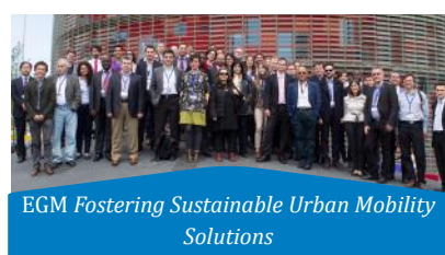
EGM Fostering Sustainable Urban Mobility Solutions

taking into account, among others, the experience of Barcelona. The EGM, supported by the “Solutions Project” of the European Union, resulted into a Communiqué on urban electric mobility, which served to fuel ideas to develop the “Action Plan on Urban Electric Mobility (UEMI)” initiative, which was presented at the Climate Summit 2014.