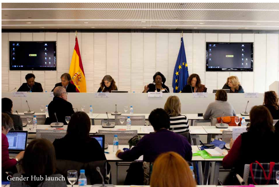
Gender Hub launch

• International meeting “ Promising Practices for effective dialogue and sustainable urban development with a gender perspective ”, jointly coordinated by UN- Habitat and the European Network of Scientific and Technological Cooperation (COST); Madrid, January 20-21, 2014. Attended by 50 experts from over 20 countries, and served to launch a GENDER HUB (networking group to advise on global urban development issues from a gender perspective). In addition, different networks were articulated on issues such as planning and gender research, urban transport, security, urban economy, services and facilities and accessibility.