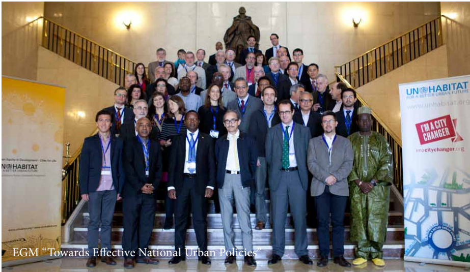
EGM "Towards Effective National Urban Policies"