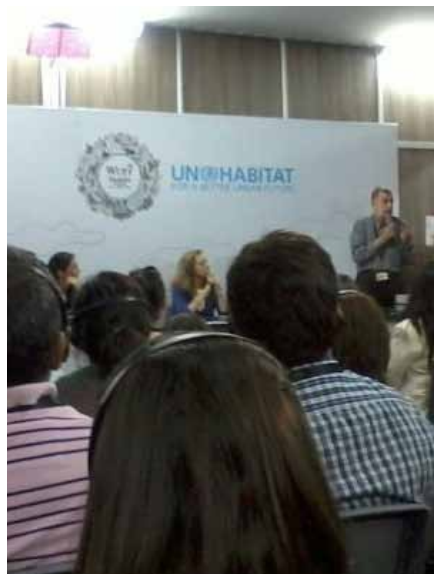
VII World Urban Forum

• Support to the Spain Habitat Committee : A meeting of around 60 participants was celebrated on the New Urban Agenda and on the Spanish feuille de route towards HABITAT III (Madrid, October 7, 2013). Organized by the Ministry of Development of Spain, the meeting aimed to present key elements of the Roadmap such as the World Urban Campaign, the National Urban Forums, the VII World Urban Forum and the preparatory process of the Habitat III National Report, among others.