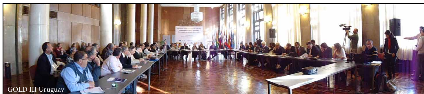
GOLD III Uruguay

• Support and facilitation of the Spanish delegation in events and activities of UN-Habitat (i.e. Inter - Ministerial Meeting on Sustainable Latin American Cities, New York, December 11, 2013, etc. . ).