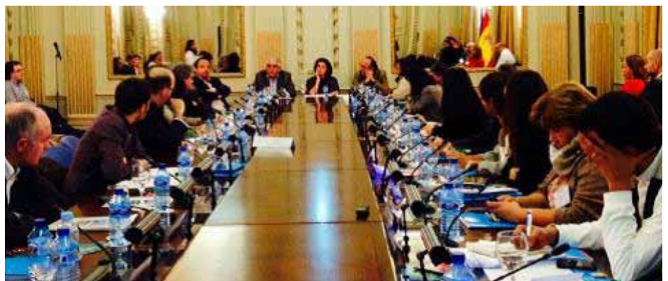
Presentation of Results - City to City final Workshop

The workshop was attended by 30 institutions including latin american partners FEMP, UCLG and AECID. It created a space for exchange and knowledge sharing among key actors, and promoted collective reflection on decentralized cooperation analyzing challenges of urban sustainability and formulas from the experience developed during the project. It was also a great opportunity to strengthen work networks.