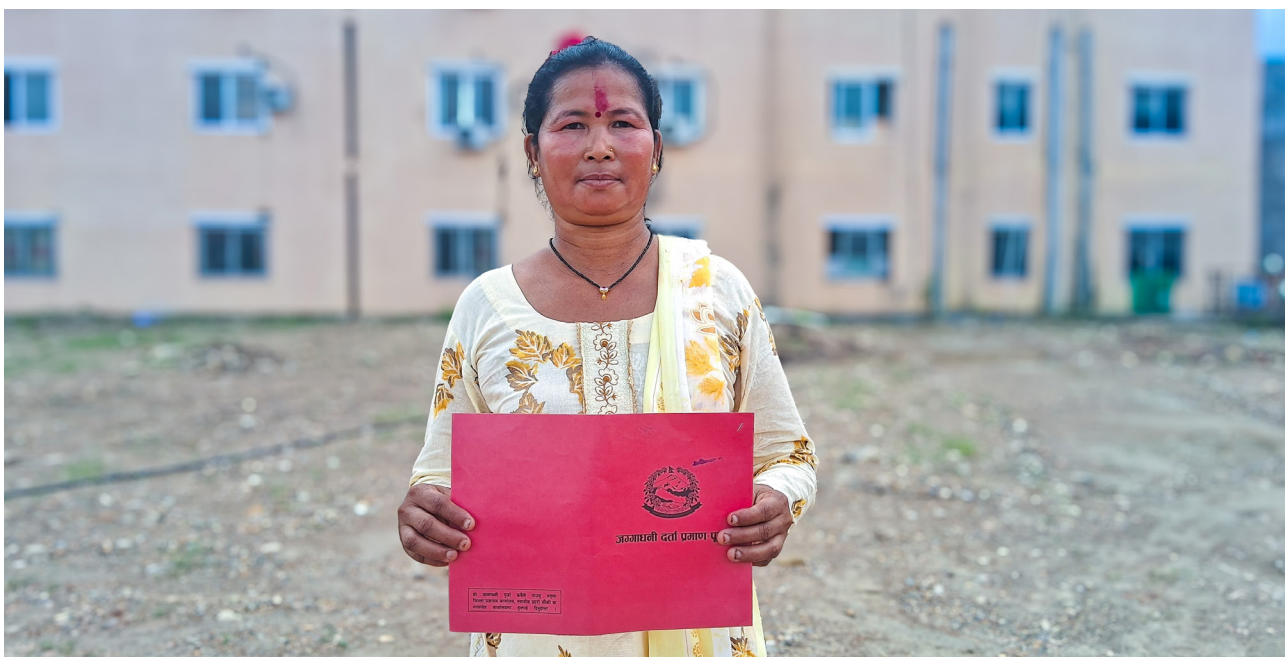
Figure 1. A beneficiary in Nepal holds up her land ownership certificate.