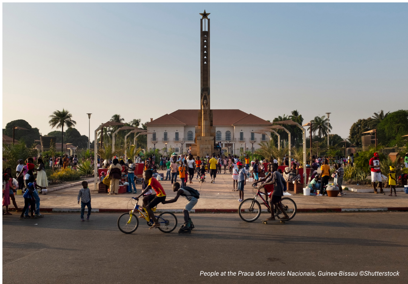
People at the Praca dos Heróis Nacionais, Guinea-Bissau

In case of any changes to the registration details, please login online to your profile to amend the details yourself at: events.unhabitat.org . In case you encounter problems write to unhabitat-events@un.org .