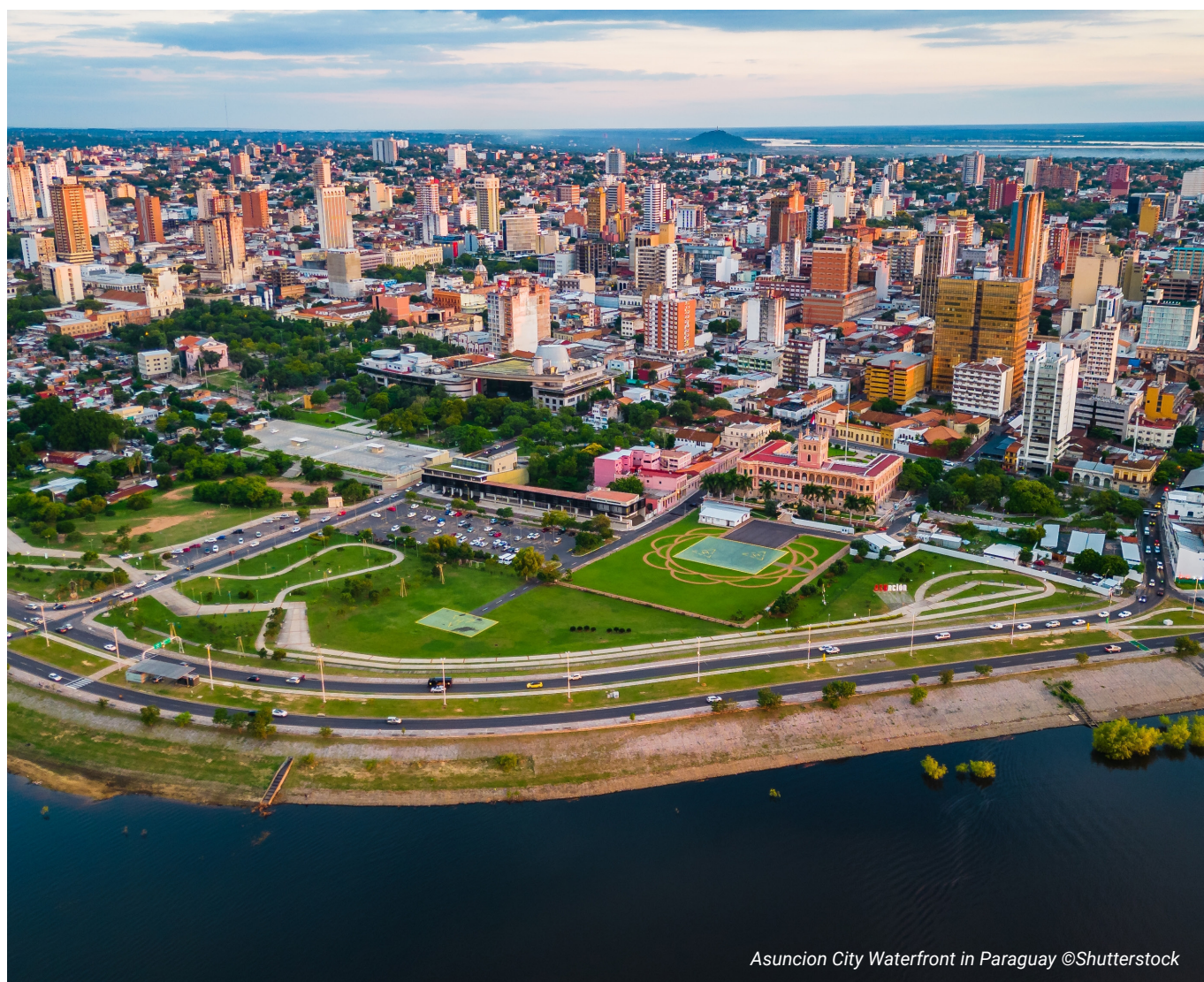
Asuncion City Waterfront in Paraguay

Accordingly, the OECPR will consider, among other matters, the progress in the implementation of the New Urban Agenda, the report of the twelfth session of the World Urban Forum and preparations for the thirteenth session of the Forum, progress in the implementation of resolutions adopted by the UN-Habitat Assembly and the Strategic plan of UN-Habitat. The third OECPR will also prepare the draft outcomes of the resumed second session of the UN-Habitat Assembly. The notification of the Executive Director for the session can be found here .