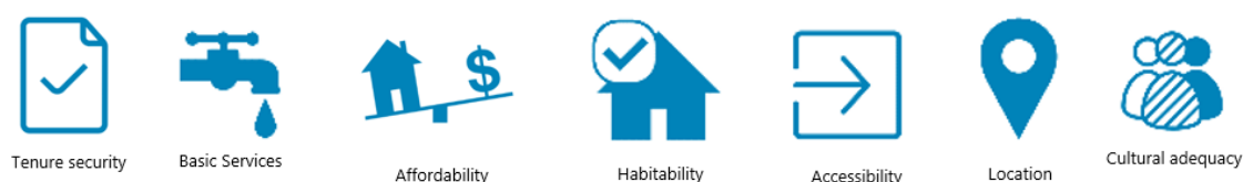
Figure II The seven aspects of adequate housing

29. Access to adequate housing, as a fundamental human right, in all seven of its aspects (see figure II) 30 is a cornerstone of a new social contract and is crucial to fostering inclusive, sustainable and equitable development. Due to its multifaceted and cross-sectoral nature, adequate housing has shown its potential as the engine of inclusive and sustainable urbanization with linkages to most of the other Sustainable Development Goals (see figure III), in particular Goal 1 (End poverty in all its forms everywhere), Goal 10 (Reduce inequality within and among countries), and Goal 5 (Achieve gender equality and empower all women and girls). Many of the Goals cannot be achieved if people do not have adequate housing.