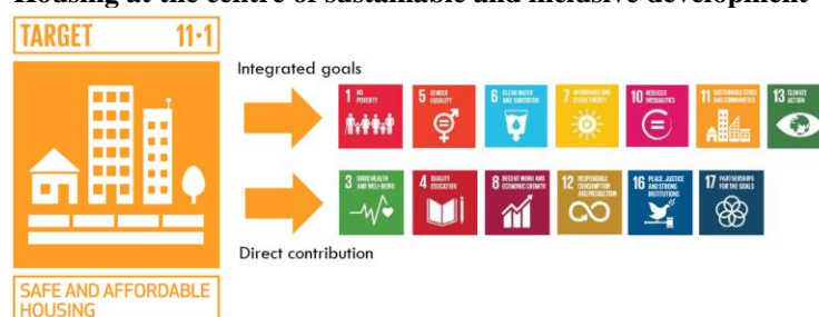
Figure III Housing at the centre of sustainable and inclusive development

29. Access to adequate housing, as a fundamental human right, in all seven of its aspects (see figure II) 30 is a cornerstone of a new social contract and is crucial to fostering inclusive, sustainable and equitable development. Due to its multifaceted and cross-sectoral nature, adequate housing has shown its potential as the engine of inclusive and sustainable urbanization with linkages to most of the other Sustainable Development Goals (see figure III), in particular Goal 1 (End poverty in all its forms everywhere), Goal 10 (Reduce inequality within and among countries), and Goal 5 (Achieve gender equality and empower all women and girls). Many of the Goals cannot be achieved if people do not have adequate housing.