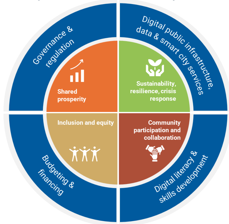
Figure 1 – thematic areas and enablers of the guidelines

equity, should be embedded within key enablers (i) governance structures and regulations, policies, (ii) digital infrastructure, data and smart city services, (iii) digital literacy and skills development, capacity building efforts and (iv) procurement, budgeting and financing (referred to as “enablers” here in under).