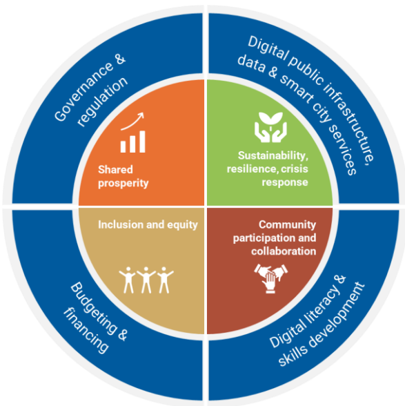
Figure 1 – thematic areas and enablers of the guidelines

The principles in the thematic areas of (i) shared prosperity, (ii) sustainability, resilience, crisis response, (iii) community participation and collaboration, (iv) human rights, inclusion and, equity, should be embedded within the four key enablers enabling pillars : (1) governance structures and regulations, policies, (2) digital infrastructure, data and smart city services, (3) digital literacy and skills development, capacity building efforts and (4) procurement budgeting and financing (referred to as “enablers” here in