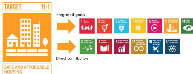
Figure III Housing at the centre of sustainable and inclusive development

29. Access to adequate housing, as a fundamental human right, in all seven of its aspects (see figure II) 30 is a cornerstone of a new social contract and is crucial to fostering inclusive, sustainable and equitable development. Due to its multifaceted and cross-sectoral nature, adequate housing has shown its potential as the engine of inclusive and sustainable urbanization with linkages to most of the other Sustainable Development Goals (see figure III), in particular Goal 1 (End poverty in all its forms everywhere), Goal 10 (Reduce inequality within and among countries), and Goal 5 (Achieve gender equality and empower all women and girls). Many of the Goals cannot be achieved if people do not have adequate housing.