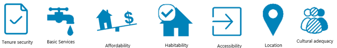
Figure II The seven aspects of adequate housing

29. Access to adequate housing, as a fundamental human right, in all seven of its aspects (see figure II) 30 is a cornerstone of a new social contract and is crucial to fostering inclusive, sustainable and equitable development. Due to its multifaceted and cross-sectoral nature, adequate housing has shown its potential as the engine of inclusive and sustainable urbanization with linkages to most of the other Sustainable Development Goals (see figure III), in particular Goal 1 (End poverty in all its forms everywhere), Goal 10 (Reduce inequality within and among countries), and Goal 5 (Achieve gender equality and empower all women and girls). Many of the Goals cannot be achieved if people do not have adequate housing.