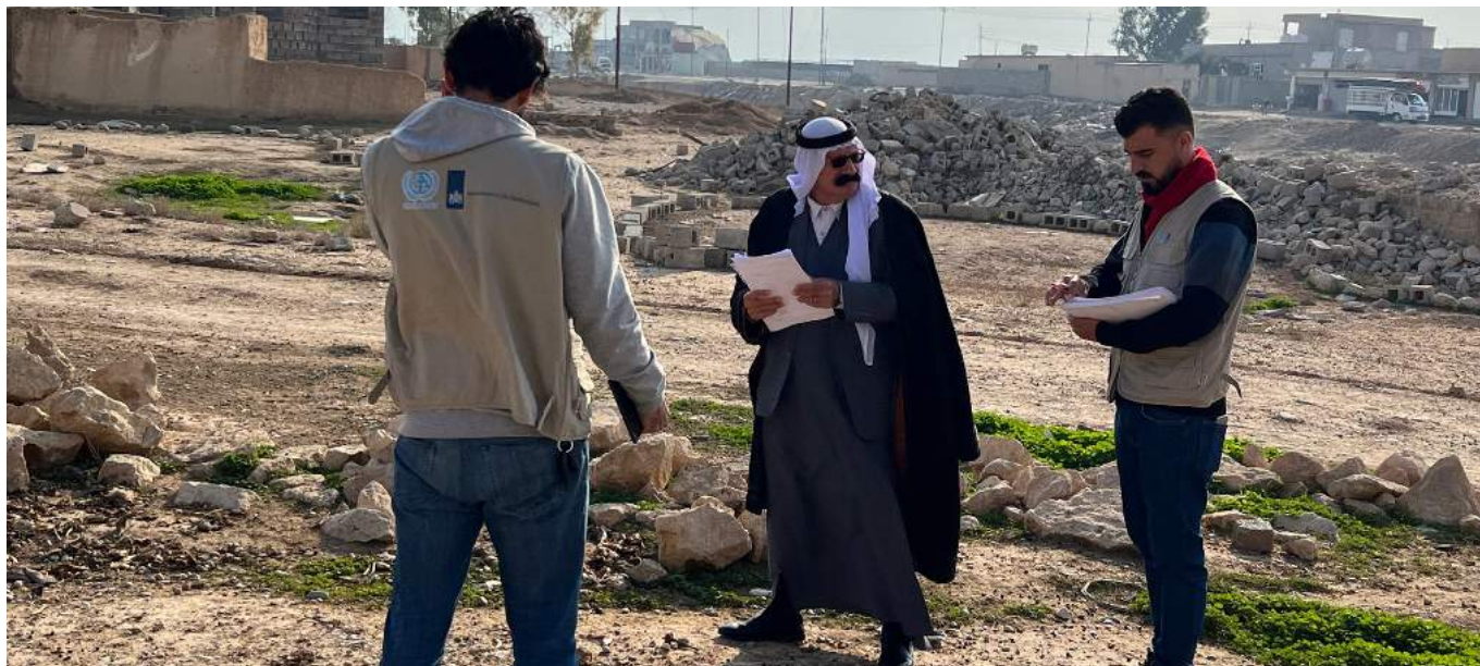
Collecting HLP Claims in Sinjar (UN-Habitat Iraq, 2023)