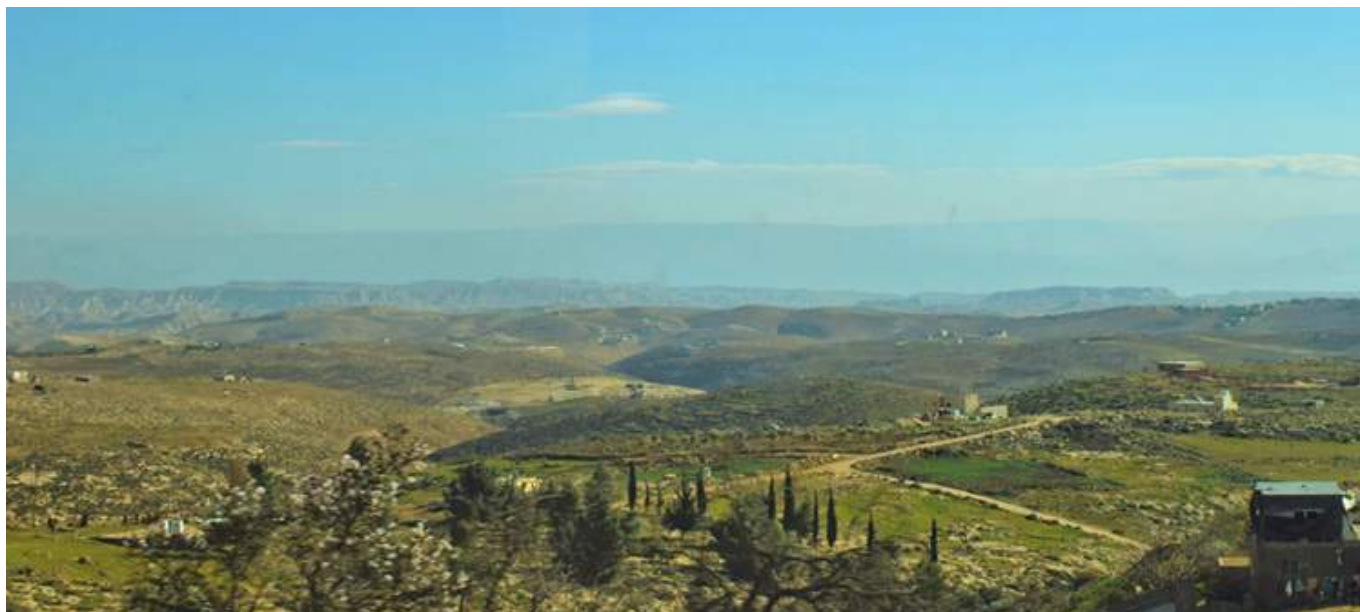
Hebron, Palestine

PROJECT GOAL - Promote inclusive and sustainable economic development within a better functioning Palestinian democracy by improving socioeconomic conditions of Palestinian communities in Area C of the West Bank.