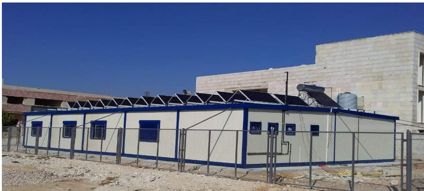
Prefabricated cadastral service center established in Qusayr city (UN-Habitat Syria)

PROJECT GOAL - Restore HLP services in Al-Qussayr, Homs Governorate - a district that experienced mass displacement during the crisis.