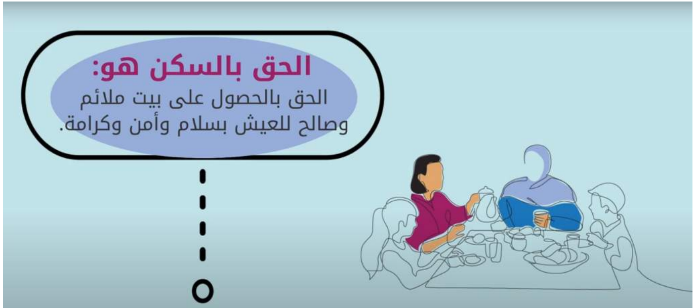
Screenshot of an advocacy video on women's HLP in Lebanon (UN-Habitat Lebanon, 2022)