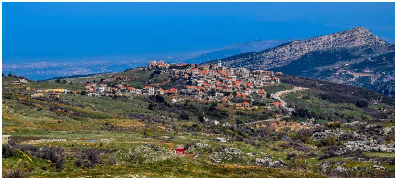
Hadath El Jebbe, Lebanon