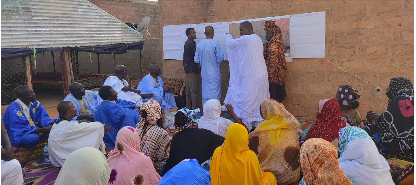
Participatory mapping in the neighborhoods of Tinzah and Inity (UN-Habitat/UNDP).

PROJECT GOAL - Better equip local leaders and communities in facing rapid urbanization to understand the risks and plan practical actions to progressively improve the urban resilience of Kaedi.