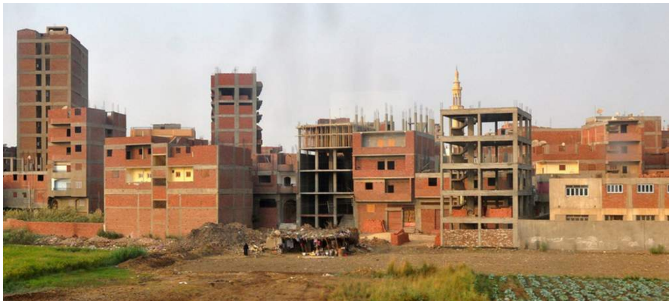
Urban Sprawl at Qalyoubia Governorate (UN-Habitat Egypt)

PROJECT GOAL - Introduce innovative concepts and tools in order to explore processes and methodologies for enhanced and more sustainable urban practices.