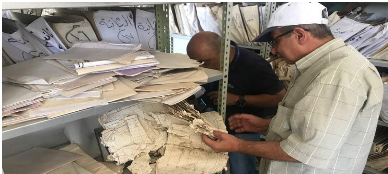
Safeguarding of tenure documents (UN-Habitat)