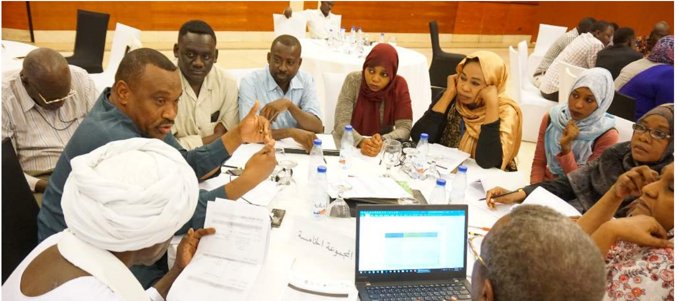
Group discussion on land issues (UN-Habitat Sudan)

PROJECT GOAL - Facilitate knowledge sharing to establish a common understanding of the role of civil society in land governance across the Arab region, with a particular focus on land and property rights and tenure security.