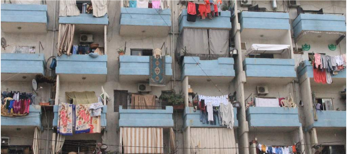
Part of the report cover (UN-Habitat and UNHCR, 2018)