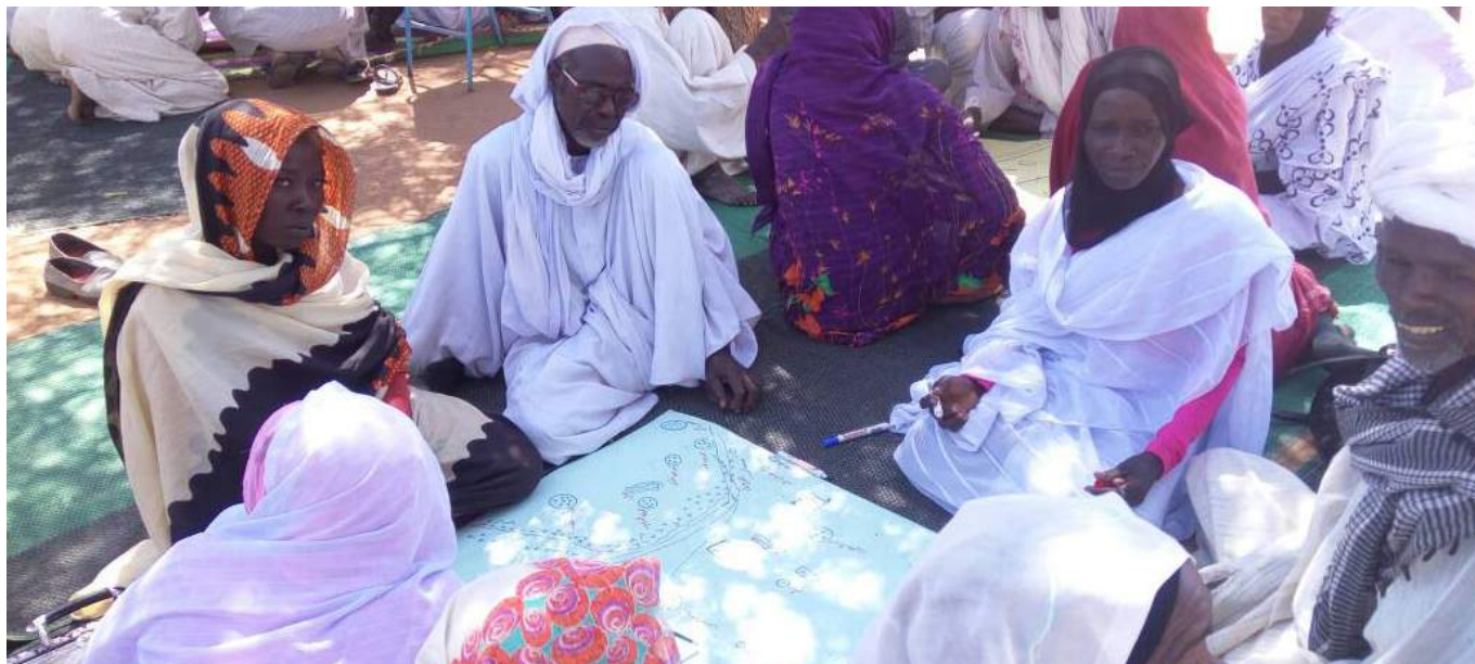
Sketch mapping in Koma Garadaya, Sudan (UN-Habitat Sudan)

PROJECT GOAL - Enhance the capacity of land institutions, including traditional administrative bodies, to improve land management in Darfur by developing effective mechanisms for resolving land rights disputes and providing recommendations to competent authorities on essential reforms, policies, and legislation.