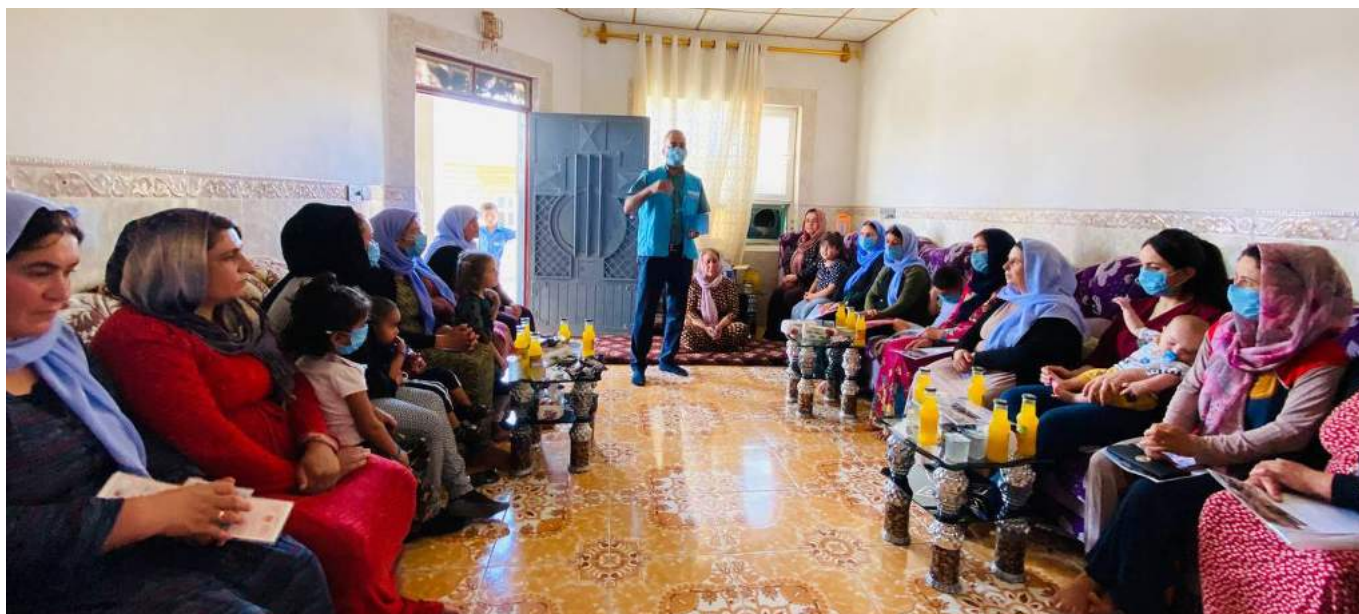
Awareness-raising session on HLP in Sinjar district (UN-Habitat Iraq, 2022)

PROJECT GOAL - Improve the rights and living conditions of the Yazidi minority population in Ba'aj and Sinjar Districts