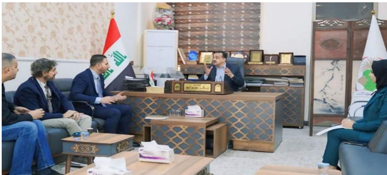
Project engagement and advocacy session with the Deputy Governor in Anbar (UN-Habitat Iraq)

PROJECT GOAL - Improve legal, institutional and operational framework regulating e-land governance and housing, land and property (HLP) rights digitization.