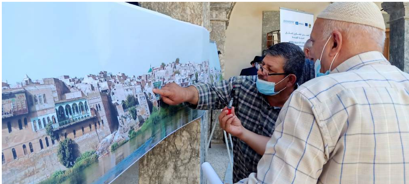
Reviving Mosul and Basra Old Cities (UNESCO, 2020)