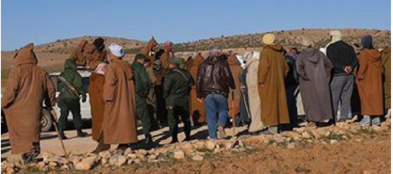
(Arab Group for the Protection of Nature)