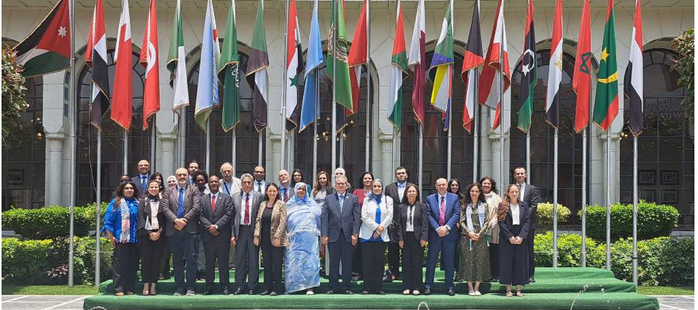
Arab Land Initiative Reference Group Meeting, Cairo, Egypt (UN-Habitat, 2024).