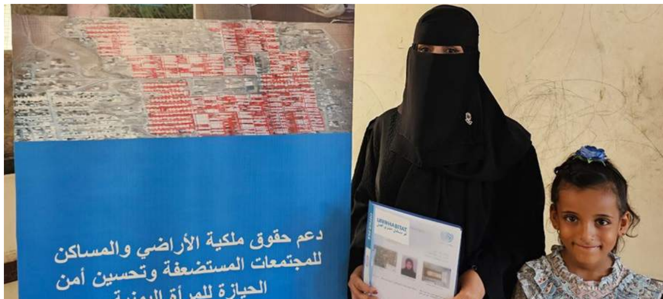
HLP Certificate Distribution, Aden

PROJECT GOAL - Accelerate urban recovery and peacebuilding by documenting HLP rights violations and challenges and improving access to HLP rights of vulnerable community members, particularly women.