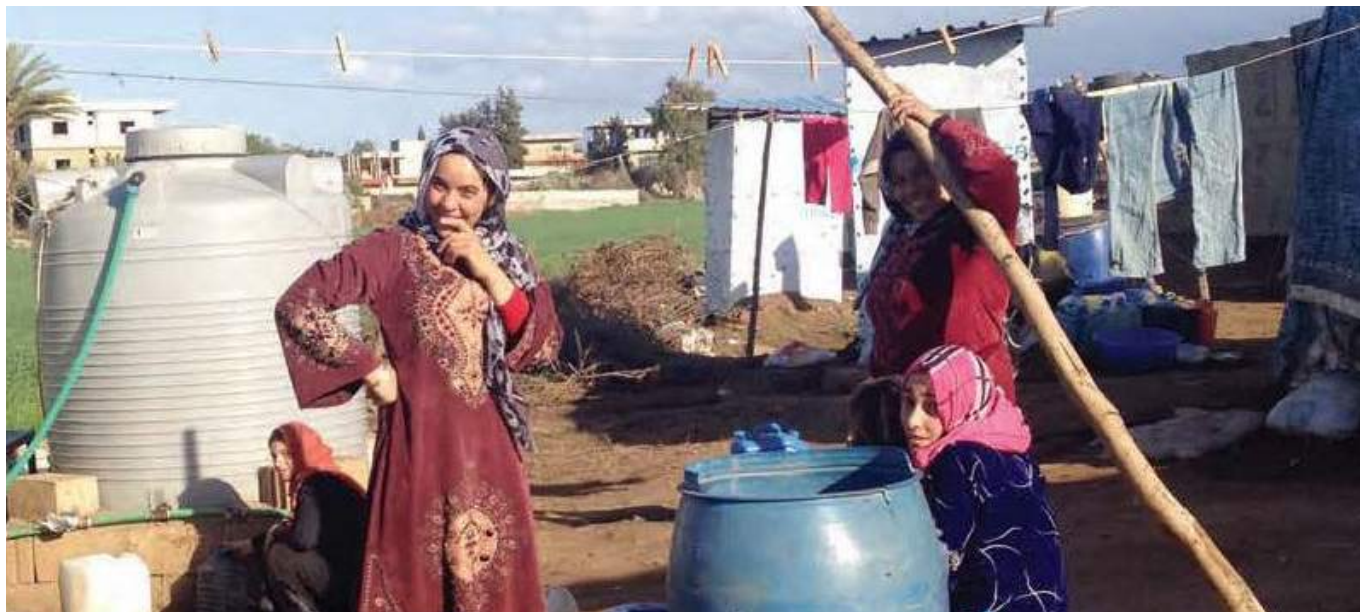
Syrian refugees in an informal tented settlement in Akkar, Lebanon (UN-Habitat and UNHCR, 2014)

PROJECT GOAL - Develop a research study to inform humanitarian and government entities in designing policies, planning decisions and programmes that ensure refugees and vulnerable Lebanese households' security of tenure and the rights to safe, affordable and adequate shelter.