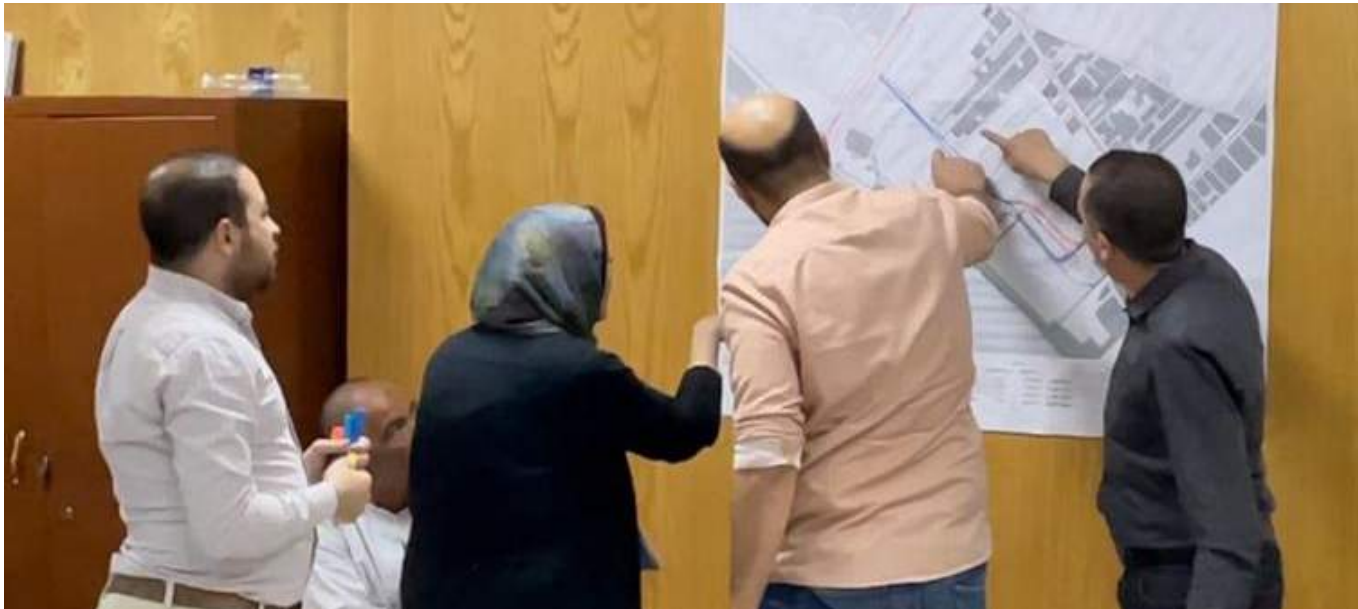
Participatory Urban Planning sessions with Almana landowners in Qena