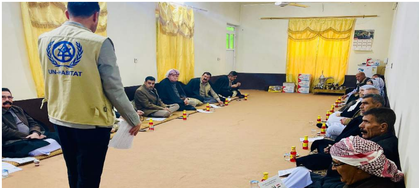
Awareness session in Tel Uzair, Sinjar (UN-Habitat Iraq)