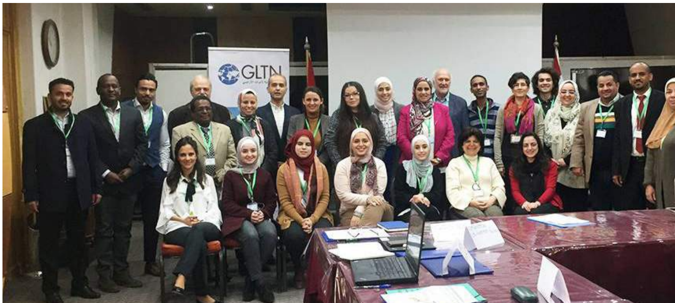
Induction workshop, Cairo, Egypt (UTI, 2020)

PROJECT GOAL - Assess the land sector capacities in the region, identify the learning offers and define a capacity development strategy and a set of priority capacity development initiatives to be led by leading experts and institutions from the region.