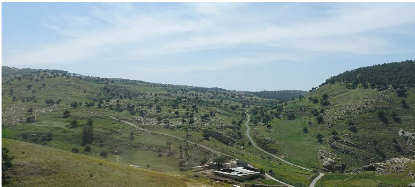
Jordan countryside