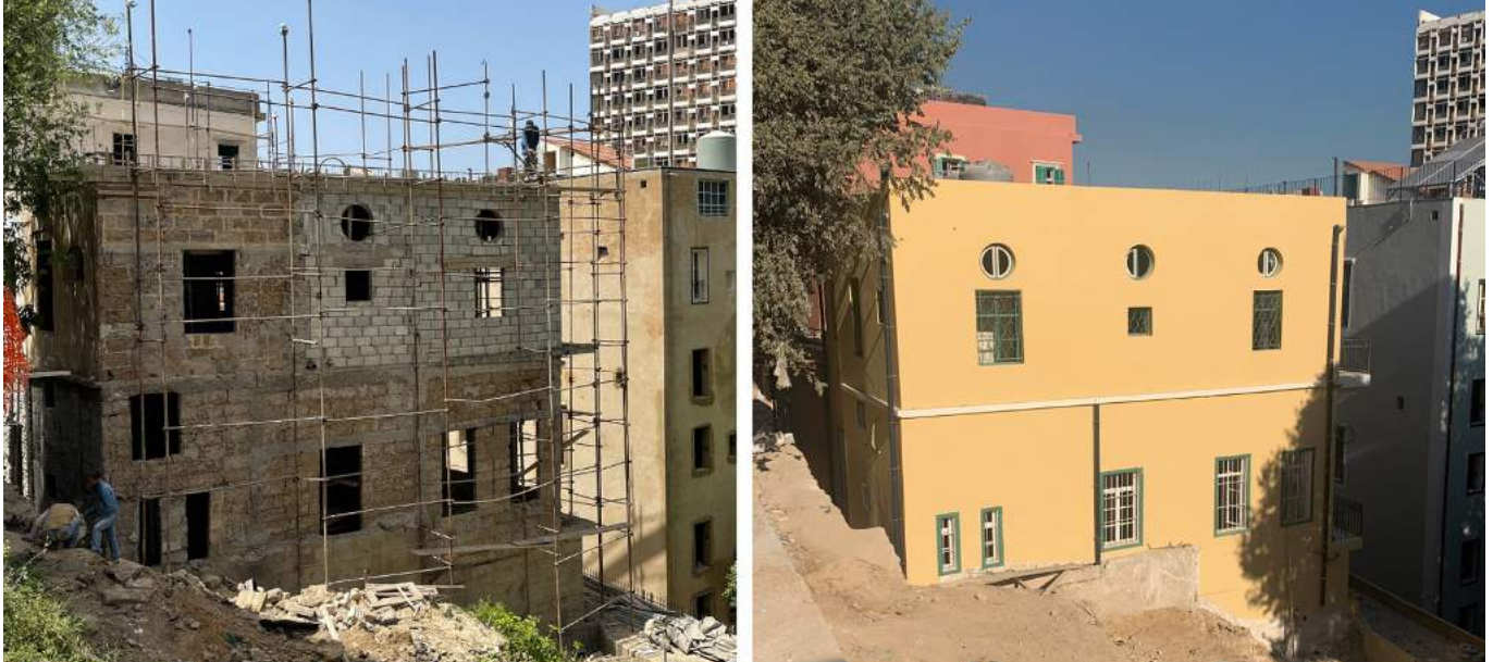
A sandstone facade of heritage value, before and after undergoing its rehabilitation under the Rmeil Cluster project (n.d.)