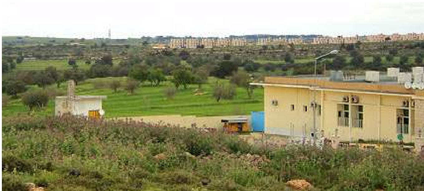
Libyan countryside

PROJECT GOAL - Assess the land and conflict nexus in Libya to provide information on the status of land tenure security and HLP rights, land use, land development, land value, and land disputes resolution in relation to their broader role in sustaining peace within the humanitarian-peace-development nexus.