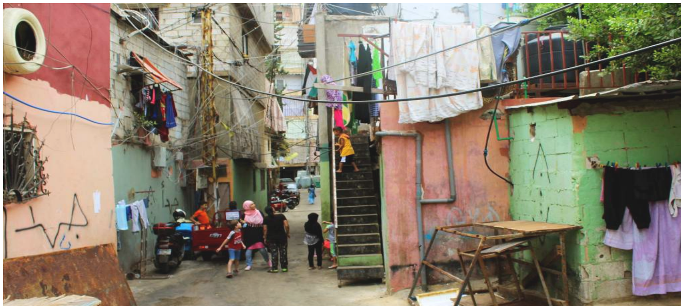
Daouk Ghawash gathering in Beirut, Lebanon

PROJECT GOAL - Identify and analyse trends and patterns of housing, land and property issues that selected Syrian refugee communities currently residing in Lebanon face back in Syria.