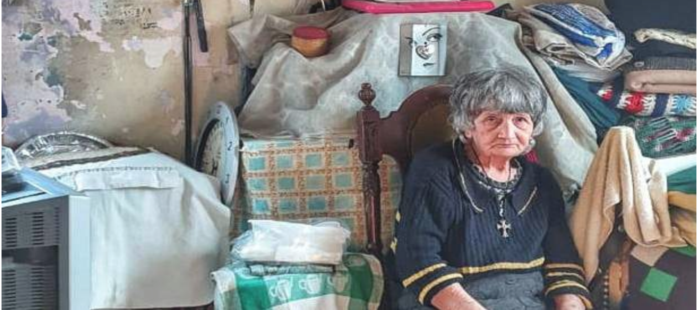
Armenian elderly woman in her damaged house in Naba'a, Lebanon