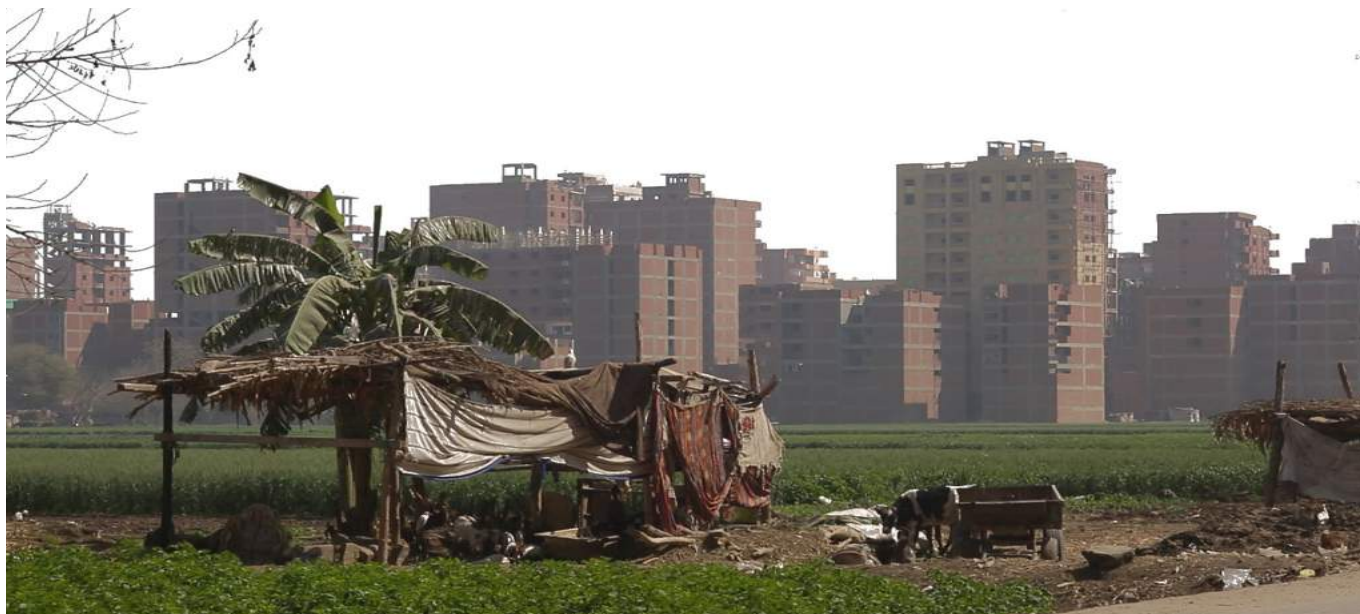
Urban Sprawl at Qalyoubia Governorate (UN-Habitat Egypt, 2017)

PROJECT GOAL - Enhance governance and management of urban expansion in the Greater Cairo region through piloting land readjustment methodology.