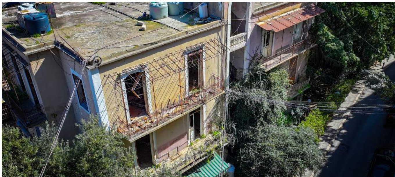
A building of heritage value from the 1930s in Rmeil before its rehabilitation under the BERYT project

PROJECT GOAL - Support the rehabilitation of prioritized historical housing for the most vulnerable people and provide emergency support to creative practitioners and entities in the cultural sector in areas affected by the Port of Beirut explosion.