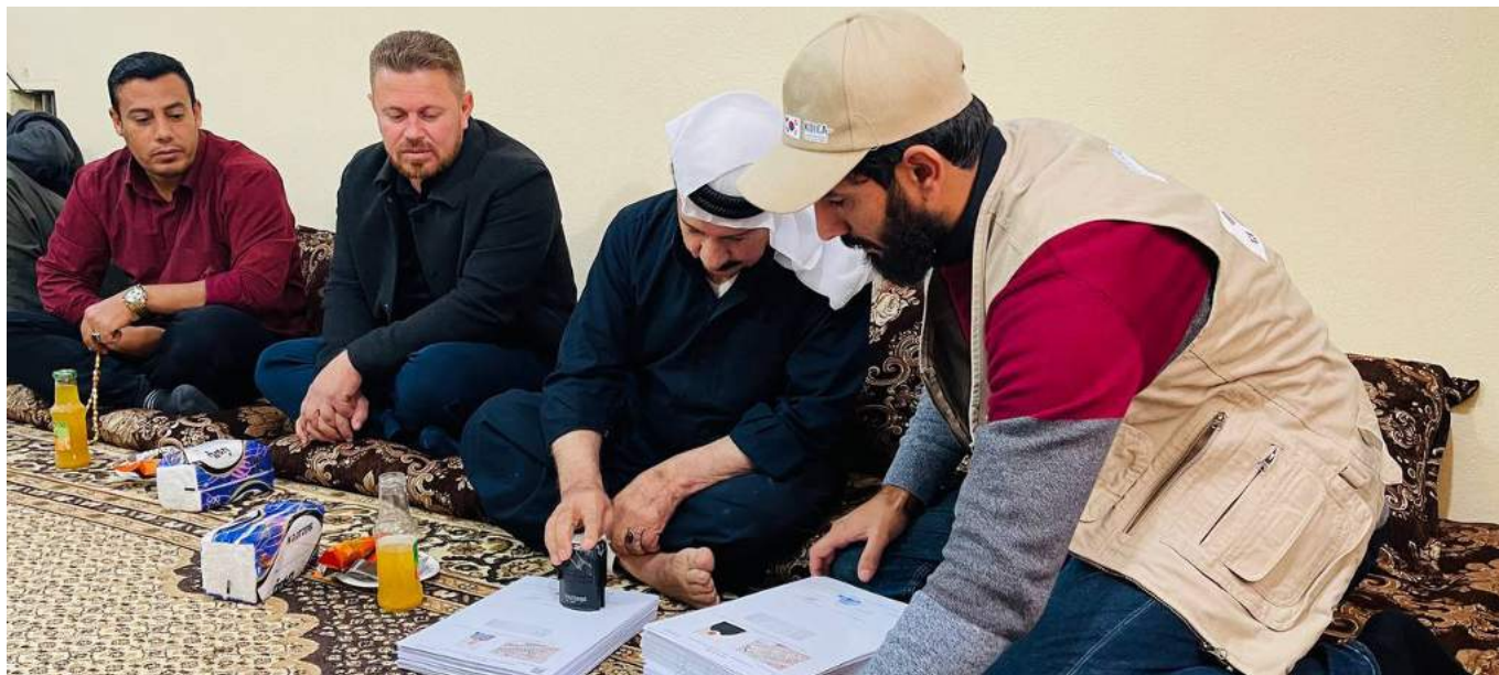
Delivery of occupancy certificates (UN-Habitat Iraq)