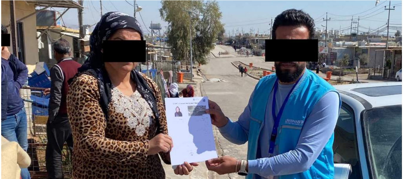
Delivery of certificates in Domiz Camp, Dohuk, Iraq (UN-Habitat, 2022)