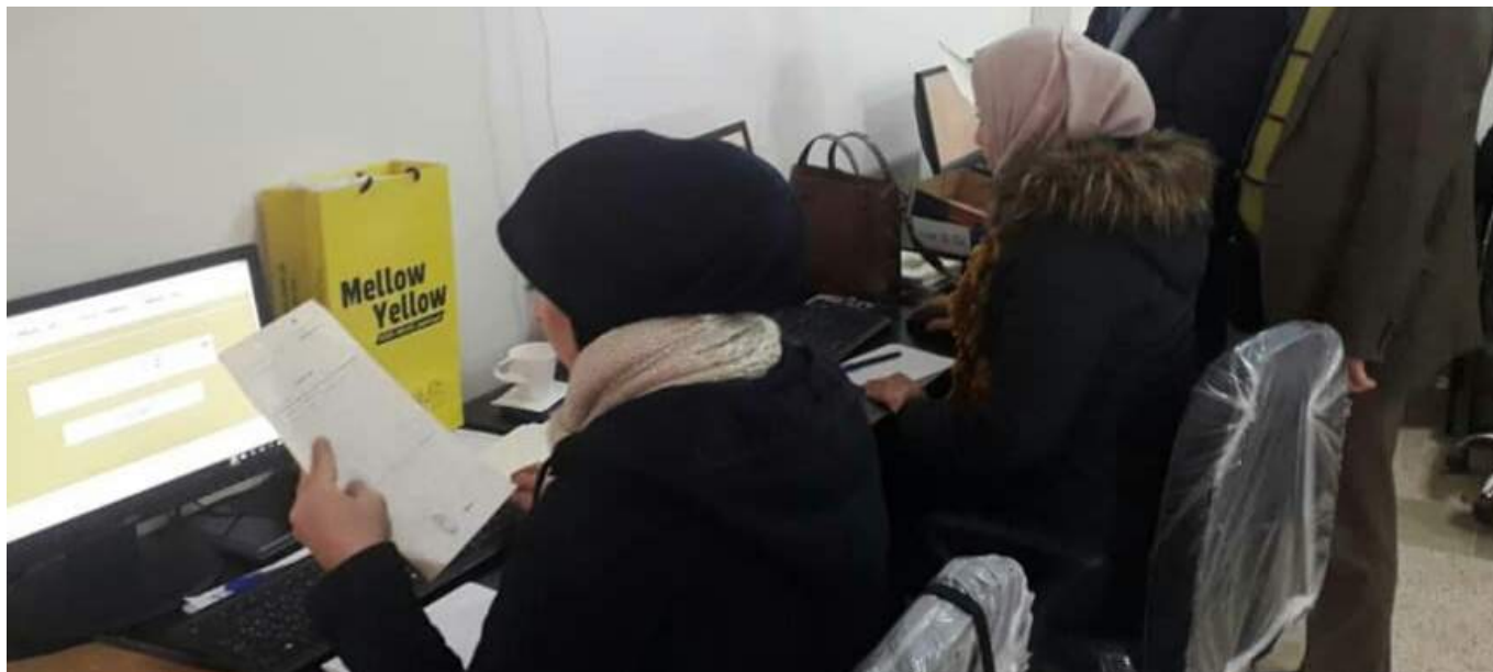
Developing data management system for scanning and archiving tenure documents (UN-Habitat Syria)