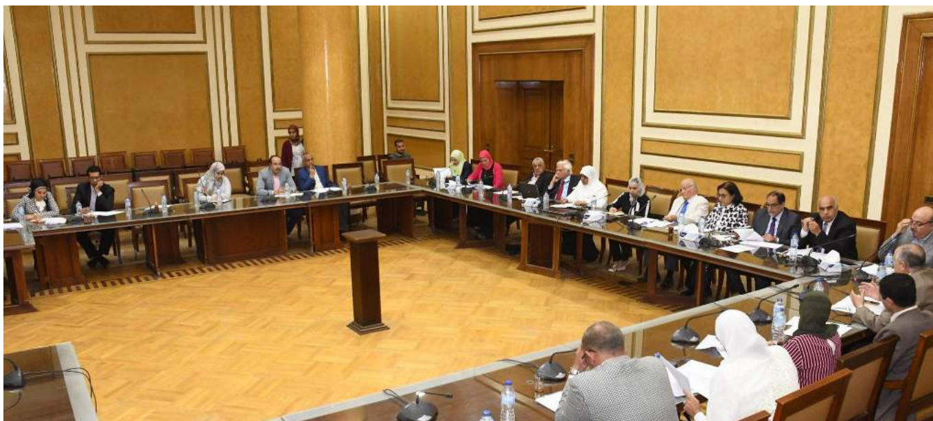
Consultation session with national housing experts during the development of the national housing strategy for Egypt (UN-Habitat, 2020)

PROJECT GOAL - Advance the right to adequate housing for all in the Arab region through supporting countries to identify policies framework and priority interventions.