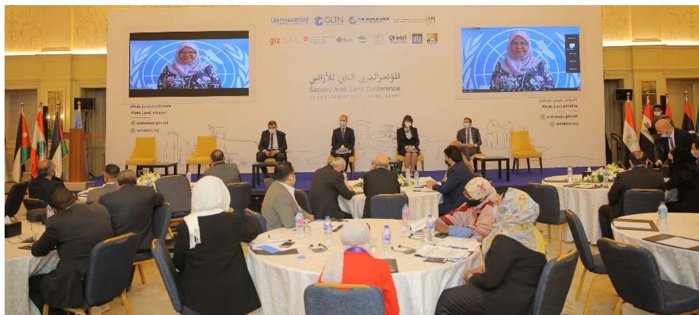
Second Arab Land Conference, Cairo, Egypt (UN-Habitat, 2021)

PROJECT GOAL - Improve the capacity of regional and national stakeholders to manage and administer urban, peri-urban and rural land in the Arab states to achieve inclusive socioeconomic development - particularly for women, youth and displaced - peace and stability.