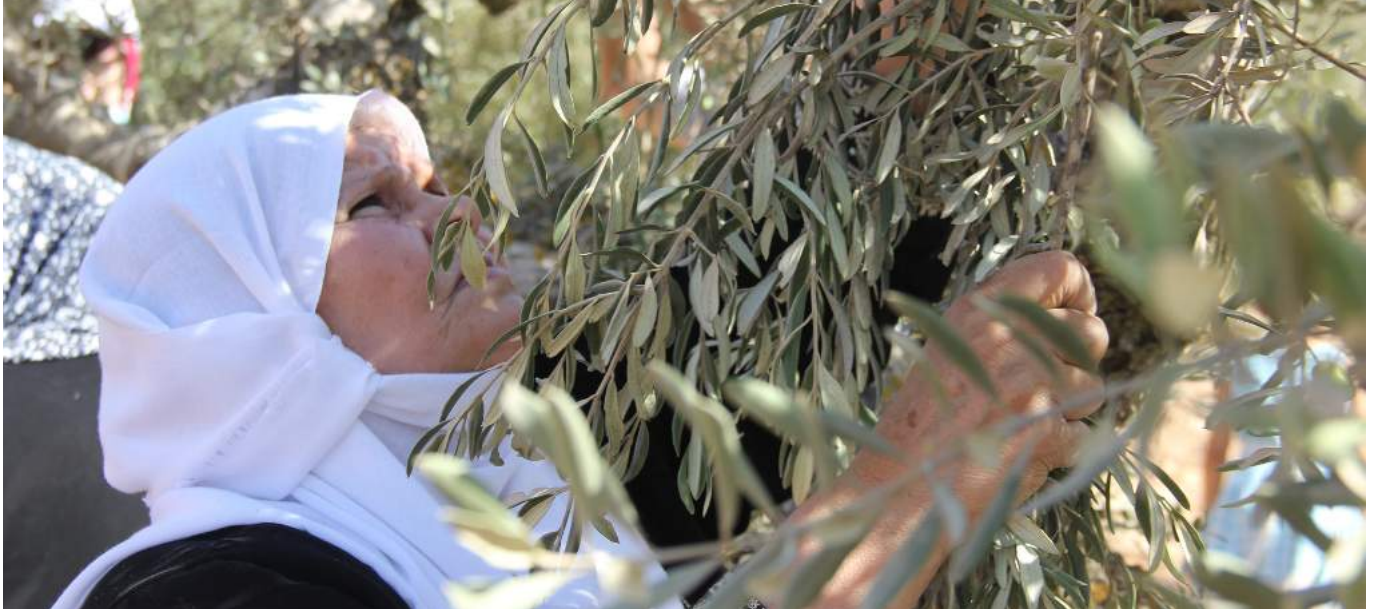
(Union of Agricultural Work Committees)