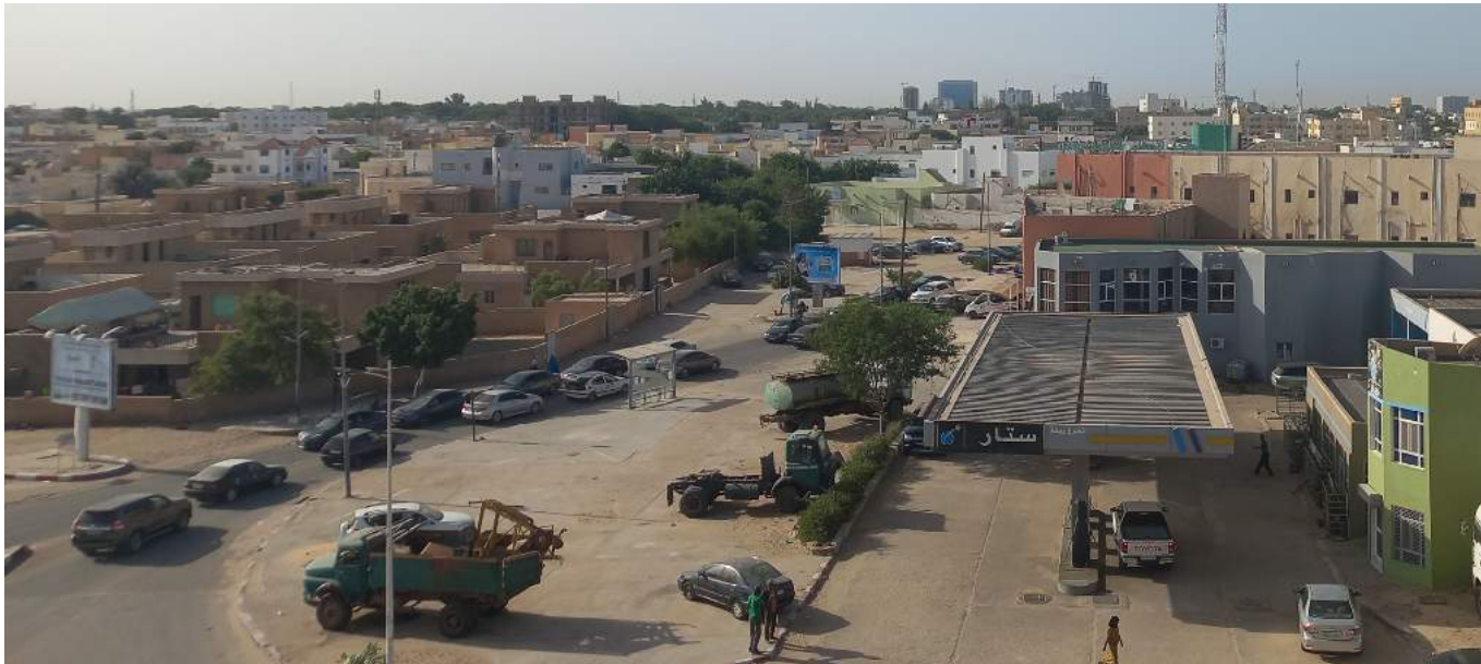
View of Nouakchott, Mauritania (UN-Habitat)