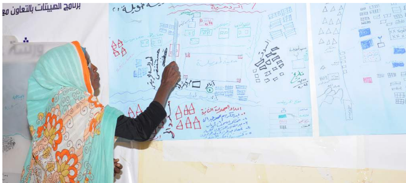
Capacity Building on sketch mapping, Darfur (UN-Habitat)