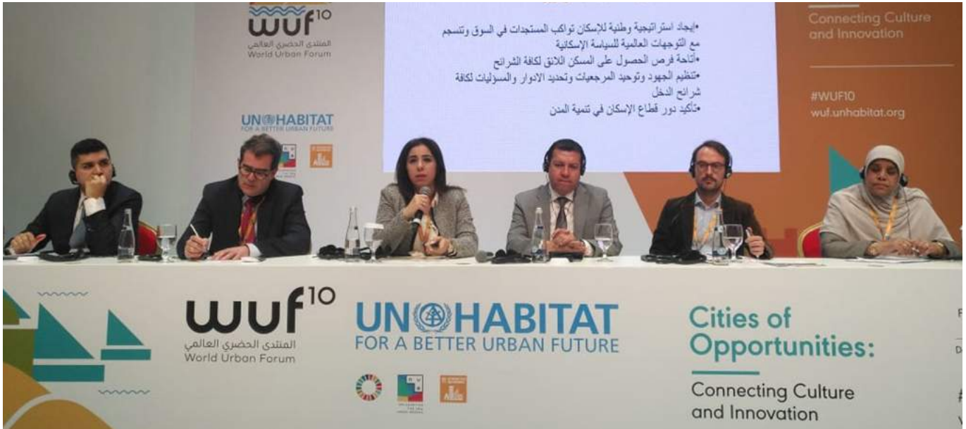
Launch of the National Housing Strategy during the World Urban Forum 10 (UN-Habitat, 2020)