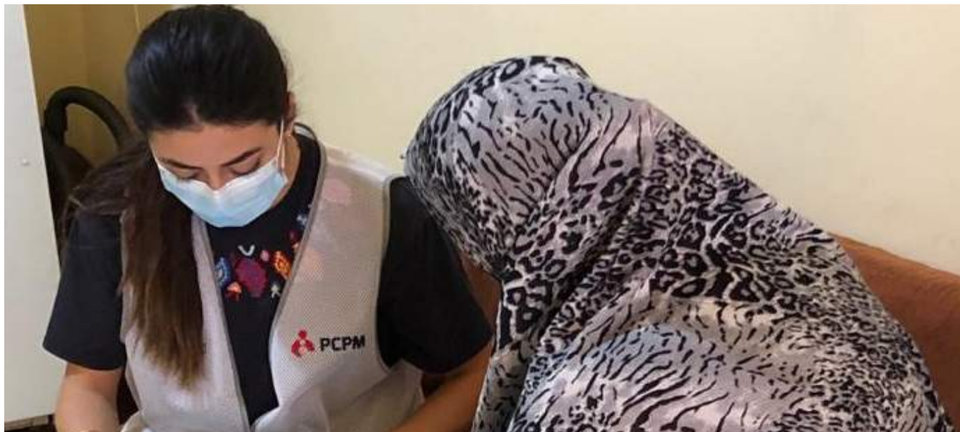
A household visit to assess the vulnerability of the identified family (UN-Habitat Lebanon, 2020)

PROJECT GOAL - Enhancing the life-saving of most vulnerable families affected by the August 2020 Beirut Port explosion, ensuring adequate housing and temporary shelter options.