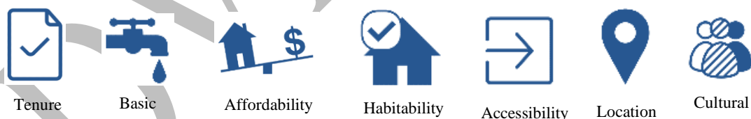
Figure 1 The seven aspects of adequate housing 10

18. Access to adequate housing, as a fundamental human right, is a cornerstone of a new social contract, crucial to fostering inclusive, sustainable, and equitable development. Housing is recognized as a common good, not as an asset, alongside the important social and ecological functions of land. Due to its multi-faceted and cross-sectoral nature, adequate housing has shown its potential as the engine of inclusive and sustainable urbanization with linkages to most of the other SDGs – particularly to addressing poverty (SDG 1), reducing inequality (SDG 10), particularly for women (SDG 5). Many of the SDGs cannot be achieved if people do not have adequate homes.