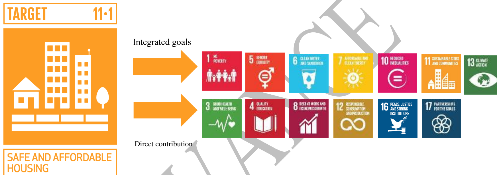
Figure 2 Housing at the centre of sustainable and inclusive development

19. The New Urban Agenda elevates housing as fundamental to economic development and poverty reduction. Housing is essential for health, dignity, safety, and social inclusion, as recognized in earlier global frameworks including the Istanbul Declaration and Habitat Agenda 11 of 1996. Adequate housing provides secure access to services, employment, and urban life, enhancing social cohesion and well-being. Secure housing and land tenure are particularly vital for women and girls, increasing their independence, reducing poverty, and protecting against exploitation and violence.