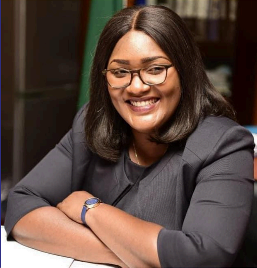
Ms. Mpsa Mwaya Mayor of Kitwe City/ Zambia High-level Speaker