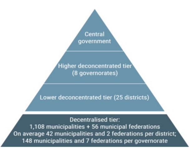
Figure 2: Government tiers in Lebanon.