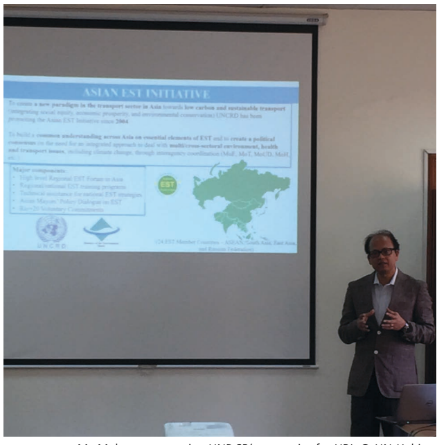
Mr. Mohanty presenting UNDCR's strategies for URL

He also described UN-Habitat's current work in developing methodologies and systems for countries to collect data in cities.