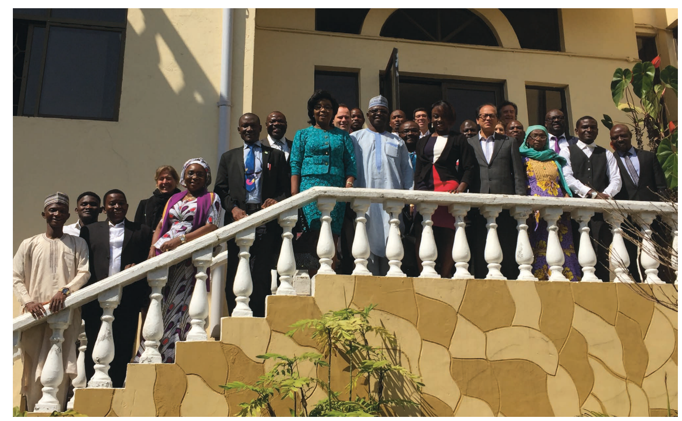
Participants from UNDA project countries, neighbouring countries and UN-Habitat during the workshop