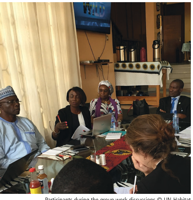
Participants during the group work discussions