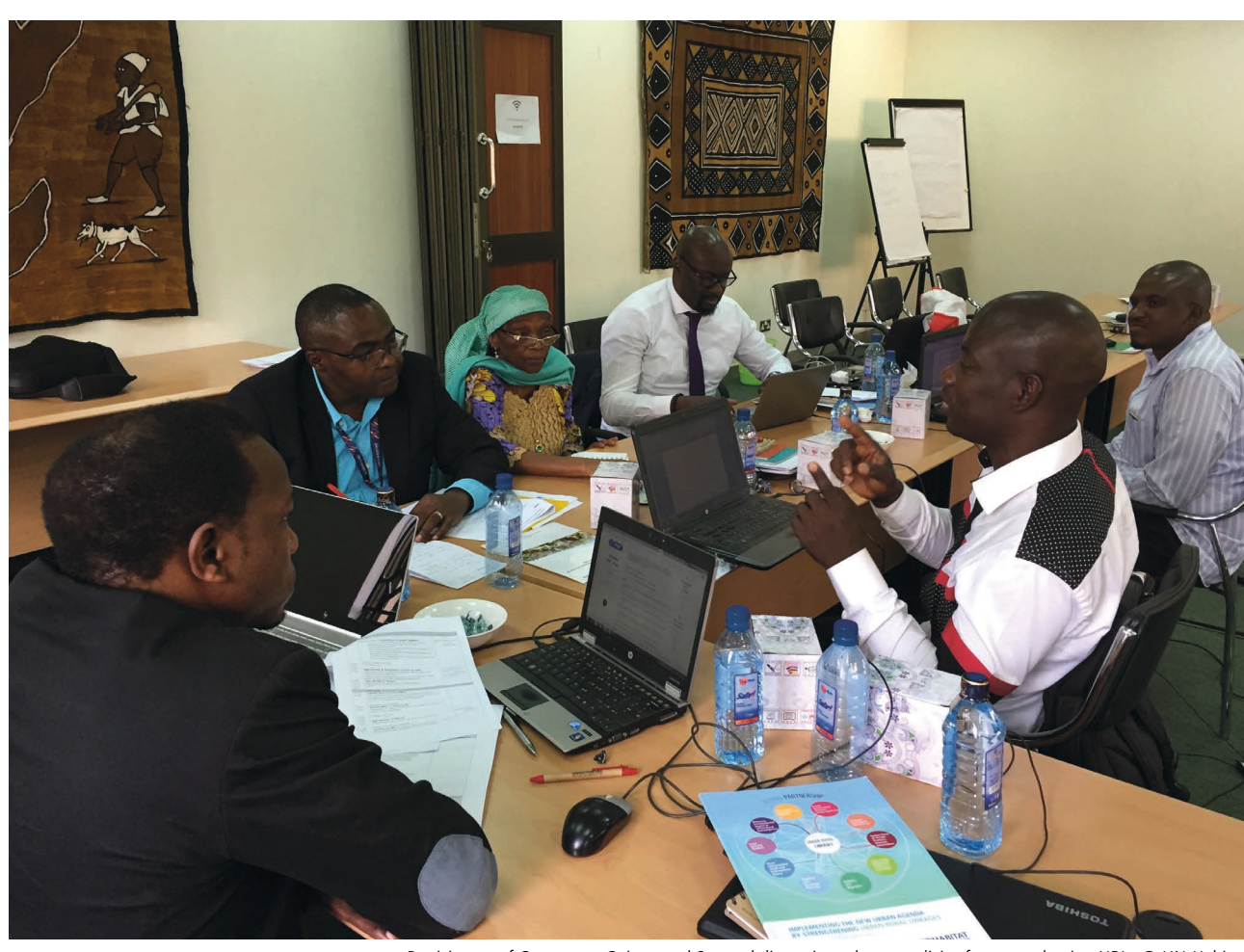
Participants of Cameroon, Guinea and Senegal discussing relevant policies for strengthening URLs

local levels spatial planning maps exist. The country participant recognized there is a need for coherence between the master plan and regional and/or local plans. Regulations should be reviewed to support the main stakeholders in mainstreaming URLs into NUP and other policies in Guinea, Senegal and Cameroon.