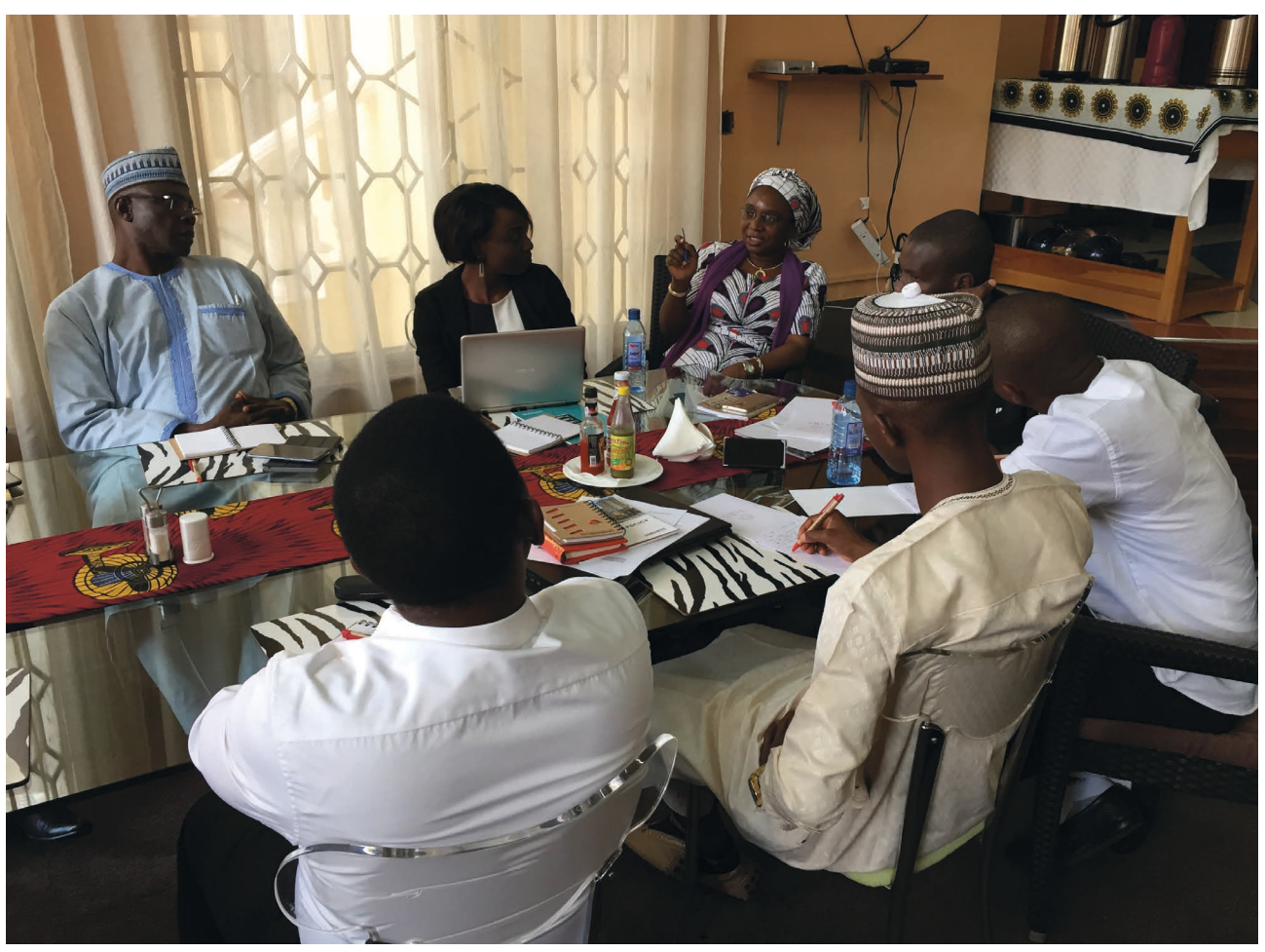
Participants from Niger State, Nigeria, Zambia and Zanzibar during their group discussion on stakeholder engagement

National Urban Policies, as a coordinating and integrating framework, were identified as potential solutions in coordinating different sectoral actors, plans and policies. Zanzibar explained that different sectors had traditionally worked in silos, but that the new NSDS was raising their awareness of their shared responsibility within a national spatial strategy.