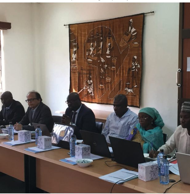
Participants and partners during the plenary discussion