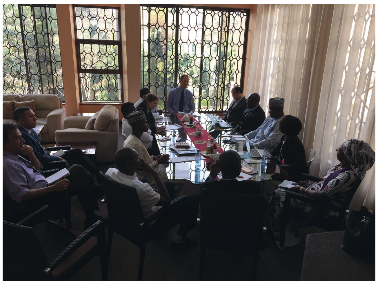
Participants during the afternoon group session discussing indicators for strengthening Urban-Rural Linkages