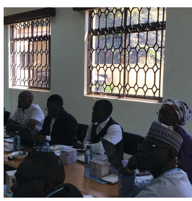
Participants during the plenary discussion

Finally, the discussion on stakeholder engagement led to a debate about power, influence and vulnerability, and how to strike the balance between two very different groups: those with power, and those without. In the discussions, the following points were highlighted: