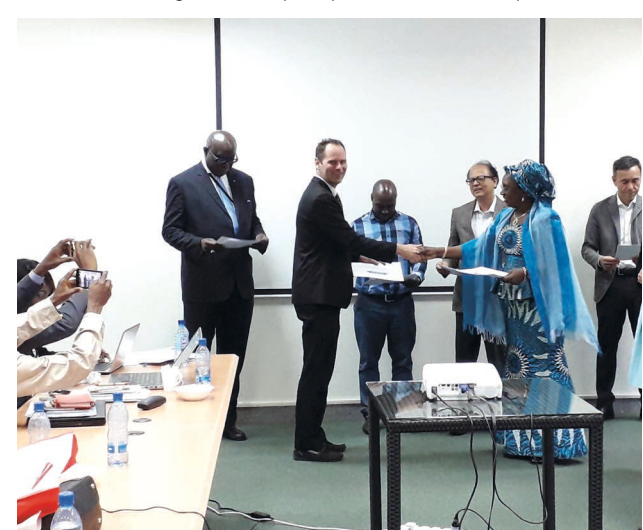
Participants receiving their certificates after the workshop