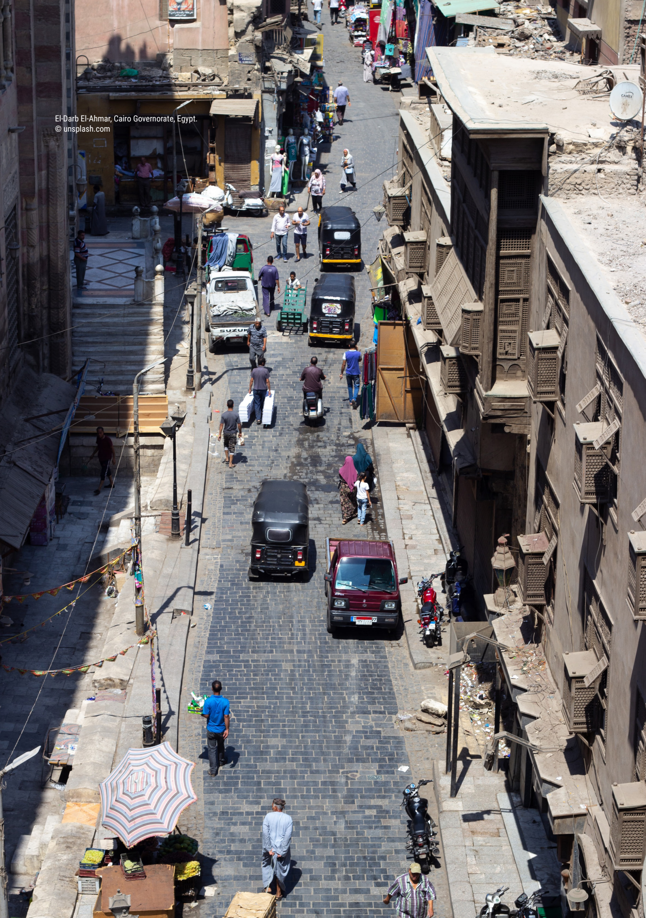
El-Darb El-Ahmar, Cairo Governorate, Egypt.