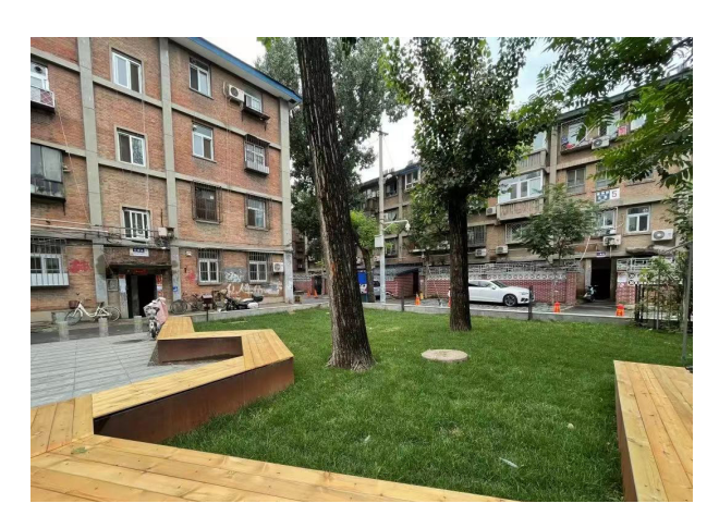
Figure 11: Updated Public Space

In addition, in order to optimize the allocation of public service facilities, Shuangjing guided to disperse and vacate the spaces, and continuously explored various types of unused urban resources and public spaces to prioritize the development of a sharing life circle. Shuangjing has built a community library for residents' reading and cultural