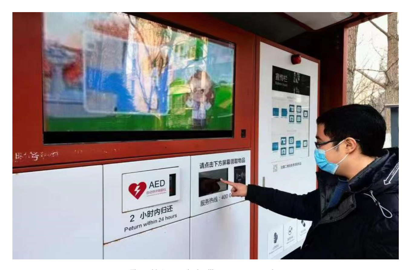
Figure 29:Community intelligent emergency station