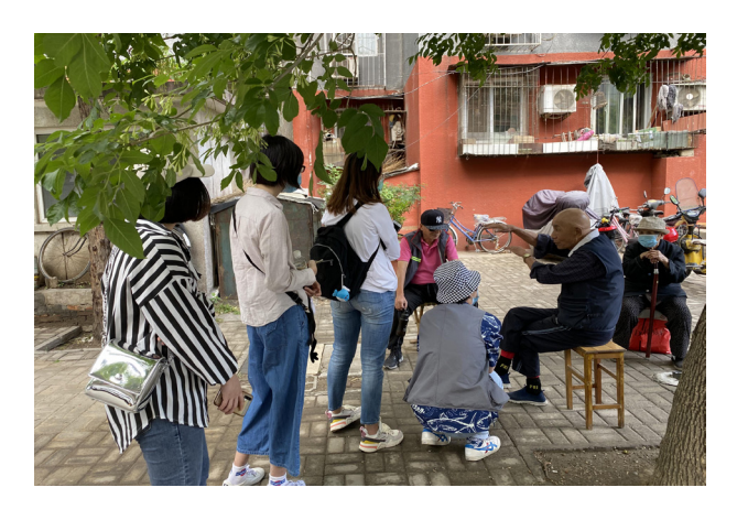
Figure 38: Field Research for the Spots of Design Festival

planning and design organized a community design festival, which opened to colleges and universities in a participatory way. The festival also provided a complaint hotline and big data analysis of physical space, which guaranteed communication with the surrounding residents, and organized expert review, resident voting, and algorithmic model review of the program to enhance the participatory and scientific nature of the planning and design.