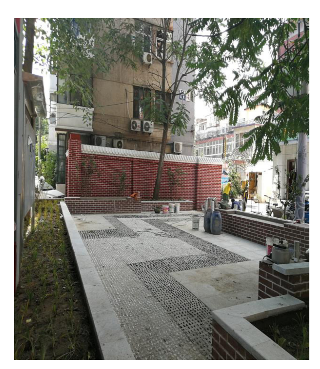
Figure 31: Before and After of Community Environment Renovation