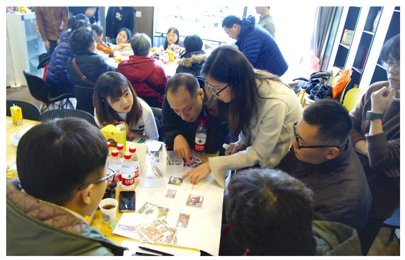
Figure 32: Participatory Design Workshop for Jingdian No.1