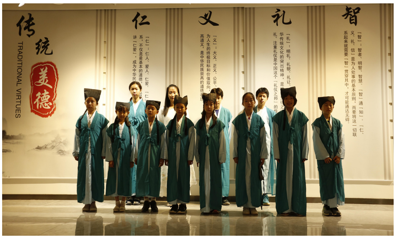
Figure 24: Cultural Activity

The aim of Community Mini Spring Festival Gala is to collect performance ideas from the residents through online registration, and call on residents to celebrate the annual cultural event altogether. Shuangjing Chinese Zodiac Design Competition is for residents to design freely with the Chinese Zodiac of the current year as the object. A list of art pieces will be selected as shortlisting for exhibition, which audiences and experts will select the final winning art pieces and issue awards to the designers afterward. Various forms of design work in the exhibition, such as beading, paper cutting, seal carving, painting, clay sculpture, sugar painting, and straw weaving, not only let the residents feel the fun and charm of traditional culture and handicraft, but also provide the residents with the opportunity to exchange works, interact and exchange ideas.