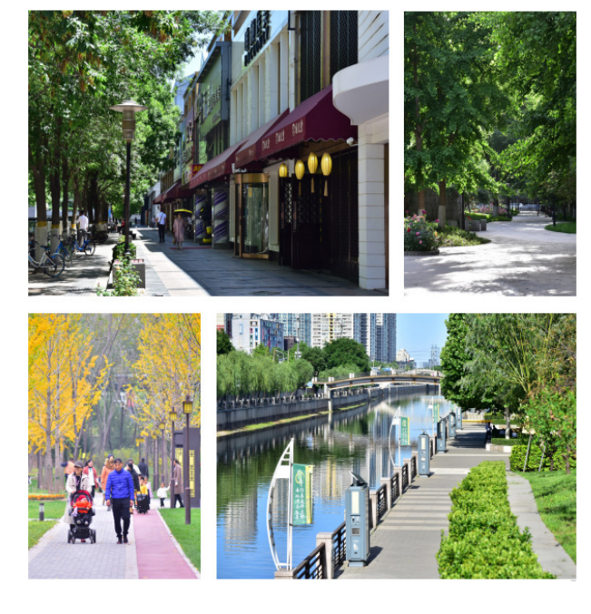
Figure 4: Livable Shuangjing

In 2019, the China Center for Urban Development (hereinafter referred to as "CCUD") and the United Nations Human Settlements Programme (hereinafter referred to as "UN-Habitat") conducted the International Sustainable Development Pilot Community Assessment for Shuangjing. Through online and onsite communication, the pilot cities and communities were actively engaged in localizing the implementation of the