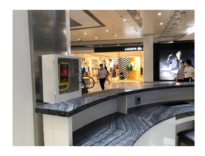
Figure 27: AED Facility Installed in a Shopping Mall

When tackling with public health crisis such as the COVID-19 pandemic, Shuangjing can quickly mobilize various agencies, property management sectors, health related organizations, housekeeping companies, social workers, volunteers and other related parties to continuously ensure the stable process of community lockdown management, NAT test, quarantine personnel services, public space disinfection, and so on. Shuangjing established an integrated management system for subdistrict pandemic prevention and management to enhance the refinement of Internet plus urban governance and achieve effective results.