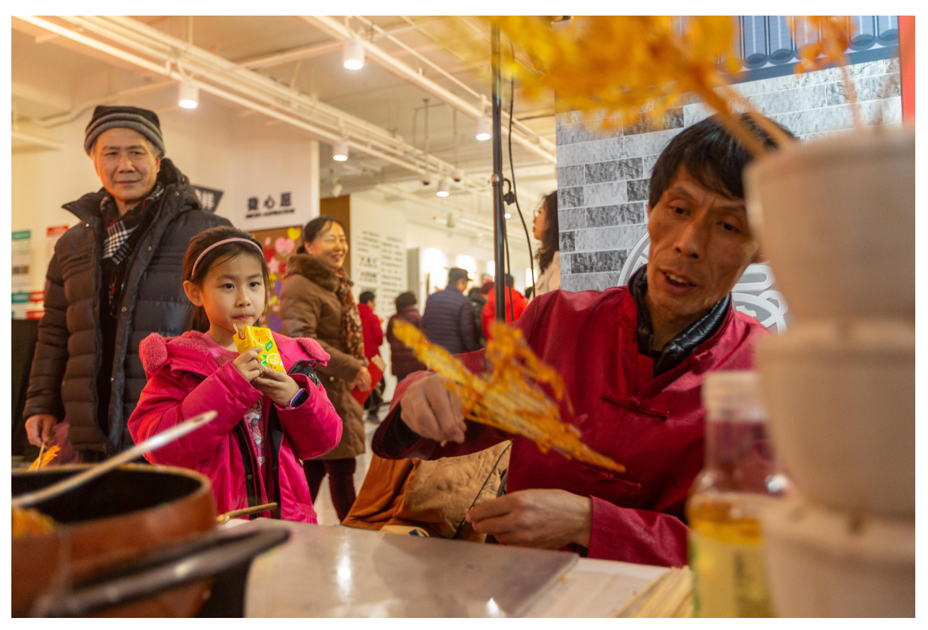
Figure 25: Chinese Zodiac Design Competition