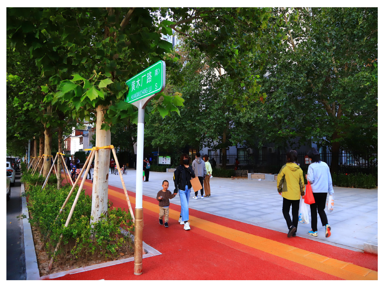
Figure 10: Updated Walkway