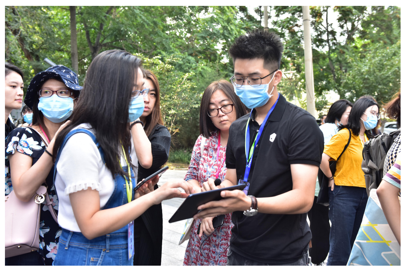
Figure 39: Introducing the Project to the Visitors