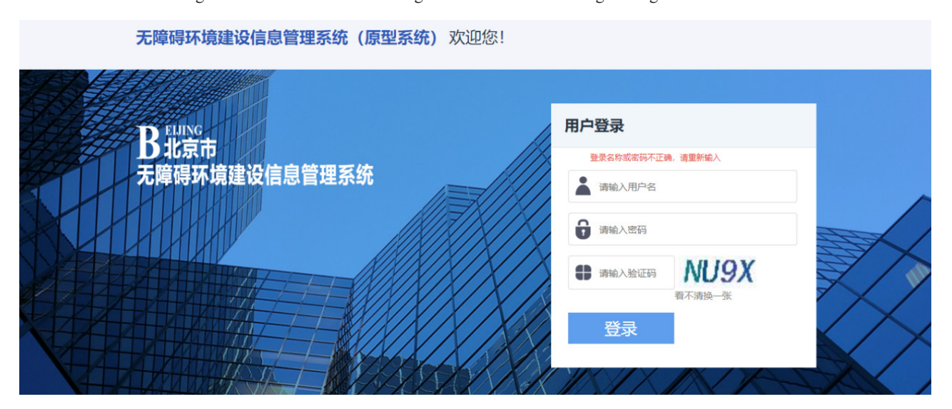
Figure 19: Beijing Barrier-free Built Environment Development Information Management System