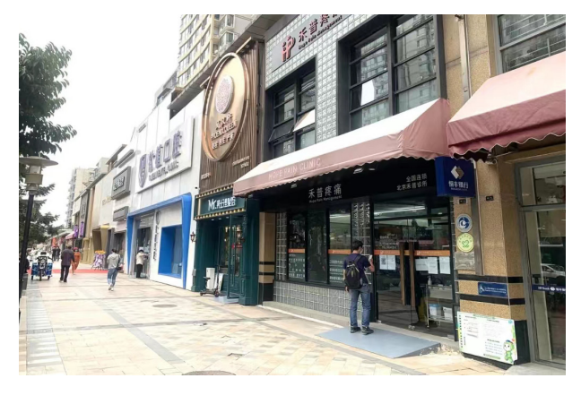
Figure 21: Renovated Walking Path