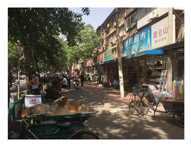
Figure 16: Old Residential Area Before Renovation