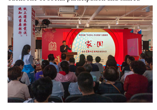
Figure 23: Cultural Activity

collaborate with the sub-district, community, and urban planners. Shuangjing has held several villager think tank seminars to foster ideas on sustainable development methods, plans, and visions. In 2021, Shuangjing Social Organization Service Center recruited more than 20,000 registered volunteers, with 8,704 active members, forming the backbone of social participation and shared