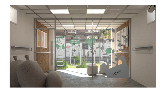
Figure 36: Jingdian No.2 Interior Renovation