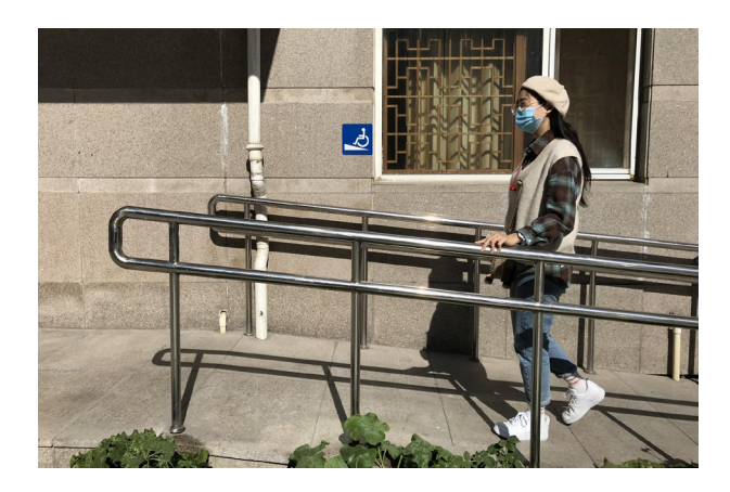
Figure 20: Renovated Wheelchair Accessible Rampway