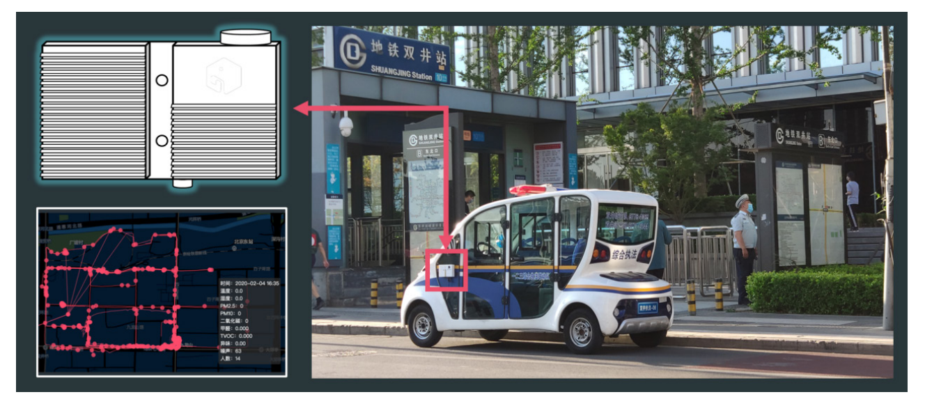
Figure 30: Environment Monitor Sensor Installed on the City Management Patrol Vehicle

stations were improved, 12 domestic waste sorting stations were built by coordinating the resources of regional enterprises, 61 recycling bins for old clothes were installed<sup>8</sup>. These actions actively promoted the establishment of an ecology waste and resource recycling system.