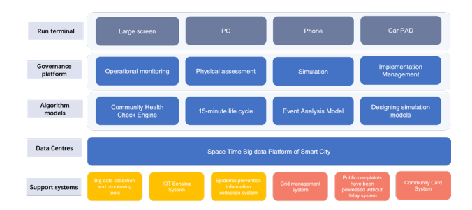
Figure 7: "Jingjingyoutiao" Big Data Platform

Based on the database established by the system, the data algorithms and urban models are used to achieve scientific cognition of urban status, accurate diagnosis of problems, scientific proof of decision making, and detailed evaluation of governance effects. In addition, it is used to improve the efficiency of urban spatial resources and social service resource utilization. Furthermore, to improve the rationality of decision-making, Shuangjing has adopted three main algorithmic models, including the urban event analysis model for urban management optimization, the community life circle model for public service enhancement, and the design simulation model for public space design, which significantly support Shuangjing's governance decisions.