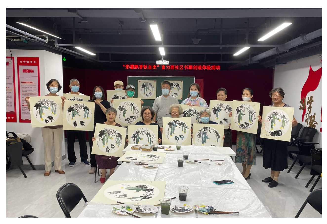
Figure 15: Community Cultural Activities

Shuangjing has carried out extensive residential areas upgrade and renovation for the early-constructed communities with poor living quality and a large number of vulnerable groups by renovating public squares, living and fitness facilities, creating cultural symbols, and greening and upgrading the public green spaces.