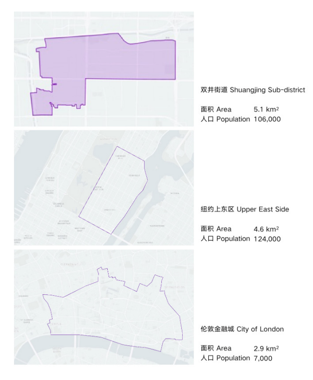
Figure 2: Comparison among Shuangjing Sub-district, Upper East Side in New York and City of London

In recent years, with its distinctive geographical location and population base, Shuangjing has become one of the most rapid areas in Chaoyang District in terms of development. At the same time, Shuangjing