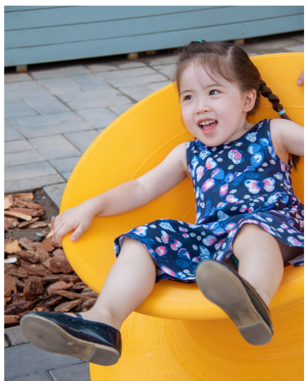
Figure 34: Children Playing at Jingdian No.1

Jingdian No. 2 transforms the abandoned storefront into a community public service space that integrates recycling and culture-derived community service place. The funding for the Jingdian No. 2 renewal comes from diversified sources. The sub-district