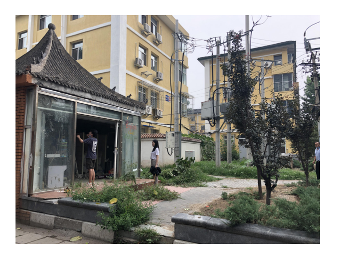
Figure 35: Jingdian No. 2 Before Renovation

provides construction funds for the site's basic renovation, the Beijing Community Research Center is responsible for providing funds for the facilities, and the Beijing Philanthropreneur Foundation is responsible for the site operation cost. Social organizations invest the funds in the form of impact investment, in combination with government subsidies and support from the public welfare foundation, which guarantees the sustainability of the renewal funds. Jingdian No. 2 does not only take space renovation as its single purpose, but also uses the space as a community catalyst for content operation and a series of derivative cultural activities with ecological civilization as its theme. Together with Beijing Aobei Environmental Protection Technology Co. Ltd., the Beijing Community Research Center conducts a series of environmental education and promotion activities for communities and schools, and aims to enhance public motivation for recycling, and use this as an opportunity for community development and community activation to achieve performance synergy between spatial renewal and social governance.