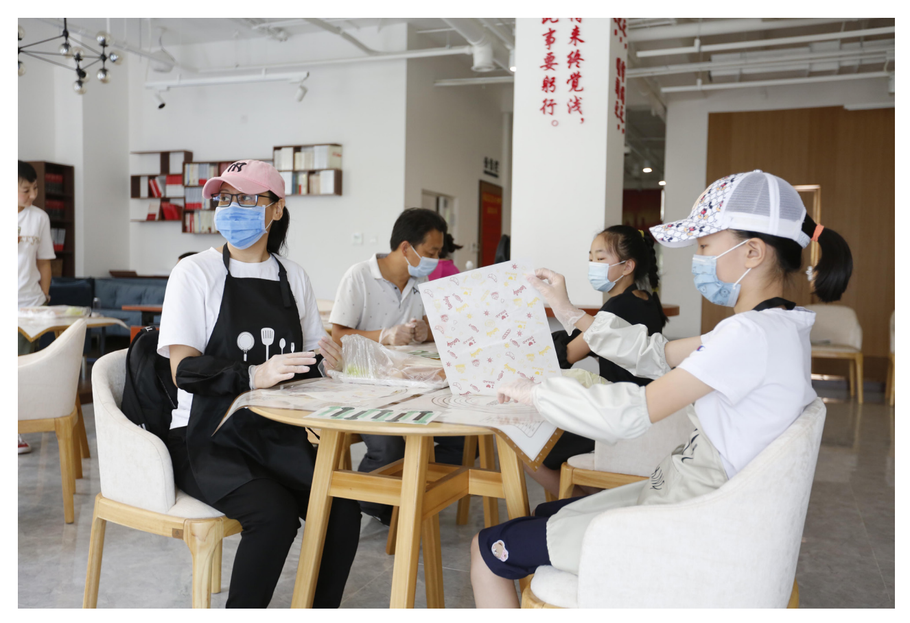
Figure 22: Volunteer Activity

raising, and maintaining a pedestrian-centered environment can all earn points and be stored on the community card. This card integrates resources and tracks public welfare records. Through various online and offline activities, the card attracts and retains "fans" and achieves the goal of "activities support the brand, and participation becomes a habit." At present, there are 80,000 community card users (about 80% of the resident population in the area), and more than 800,000 public welfare points have been accumulated.