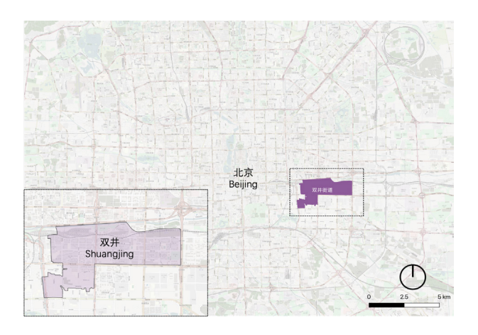
Figure 1: Location of Shuangjing Sub-district

population of 96,000. The size and population of Shuangjing are similar to that of the Upper East Side of New York City in the United States. Compared to The City of London in the UK, the size of Shuangjing is doubled, and the resident population is 14 times larger.