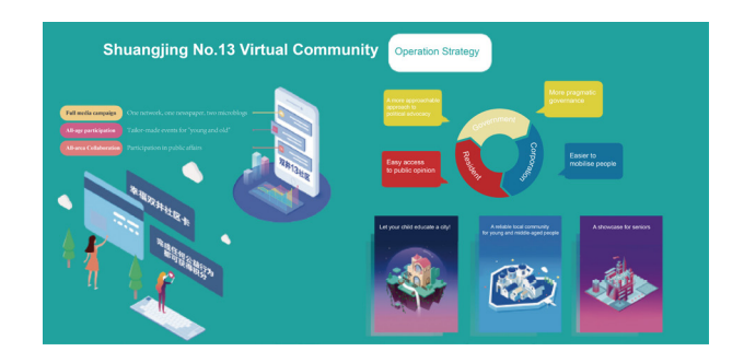
Figure 5: Operation Strategy of Shuangjing No. 13 Virtual Community

In 2014, Shuangjing initiated the concept of transforming Shuangjing as One Community, and proposed the concept of "Shuangjing No.13 Virtual Community". It has also actively explored online community governance and has gained recognition from all walks of life.