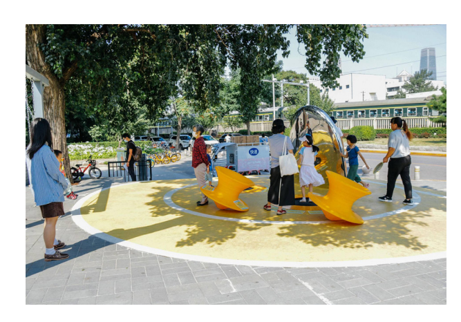
Figure 33: Many Residents are Attracted to Jingdian No.1

site have been significantly improved. The site transformed from the original inefficient, single-function community fitness space into an "outdoor living room" that can carry leisure, entertainment, fitness, and social activities for the elderly, middle-aged, youth, children, and the surrounding urban service groups."