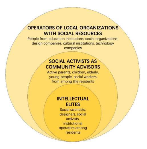
Figure 6: Co-governance System of Shuangjing

The "Pioneer Plan" comprises intellectual elites, social activists, and operators of local organizations with social resources in Shuangjing. They are expected to mobilize their academic, cultural, and social resources to communicate and collaborate with the sub-district office, community, and the team of responsible planners to contribute to the development of Shuangjing. The "Pioneer Plan" has held several online and offline workshops and has made a lot of meaningful suggestions and recommendations for the sustainable development of Shuangjing.