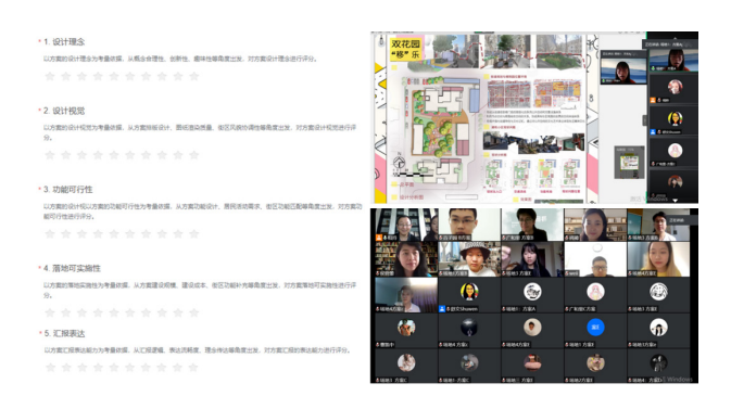
Figure 40: Online Review of the Project Proposals Received during the Design Festival

Shuangjing Sub-district, together with students from the majors of Environmental Design and Landscape Architecture of Beijing Forestry University, and the major of Light Environment Design of Communication University of China, completed the project design by group team work and design competition based on the analysis of 12345 complaints and environmental big data analysis, on-site mapping research and communication with residents around the site, and finally produced 57 sets of works. After the design phase, a number of experts in the discipline formed a judging panel to evaluate the proposals from multiple perspectives, including design concept, visualization, and feasibility. Meanwhile, the Shuangjing public account on the Palm published the voting information of the submissions for two weeks, calling on local residents to vote for their favorite submissions. On the other hand, the MAS model was used to simulate the number of people and duration before and after the site's renovation to predict the effectiveness of the site renovation, and the final winning entries were selected by combining the comments of the sub-district leaders.