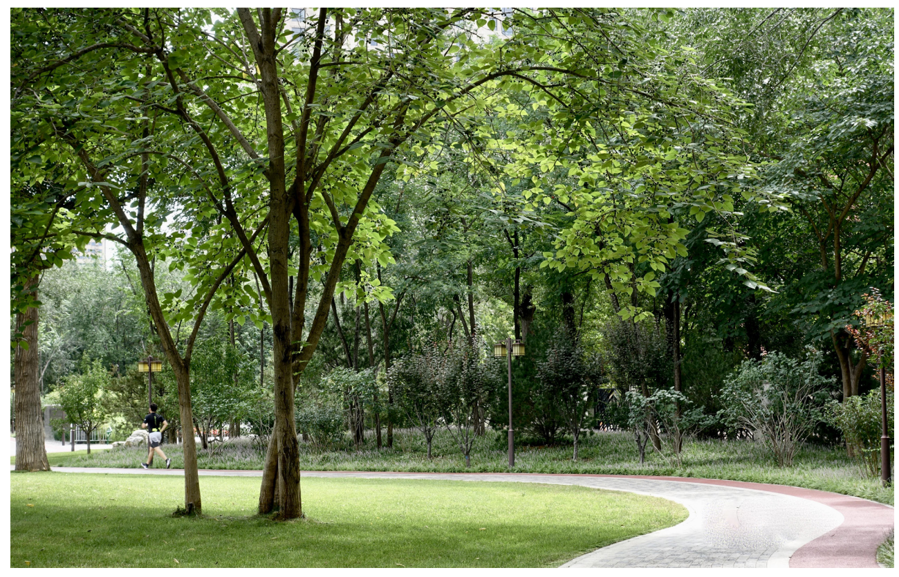
Figure 13: Newly built Park

520-square-meter space has been designated for vulnerable groups who live concentratedly in communities to fulfill the basic needs of people with disabilities in rehabilitation, employment training, cultural activities, sports, and human rights protection activities. The space has a CPC capacity building activity room, a multifunctional activity room, a rehabilitation guidance room, a rehabilitation room, a rehabilitation aids room, a legal consultation room, a psychological consultation room, and a reading room.