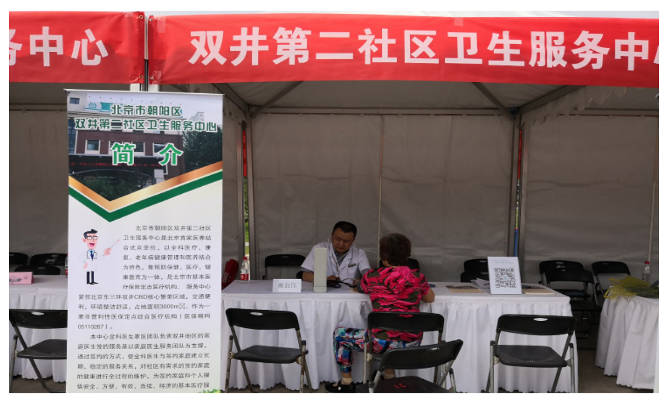
Figure 9: Medical Service Provided to the Elderly