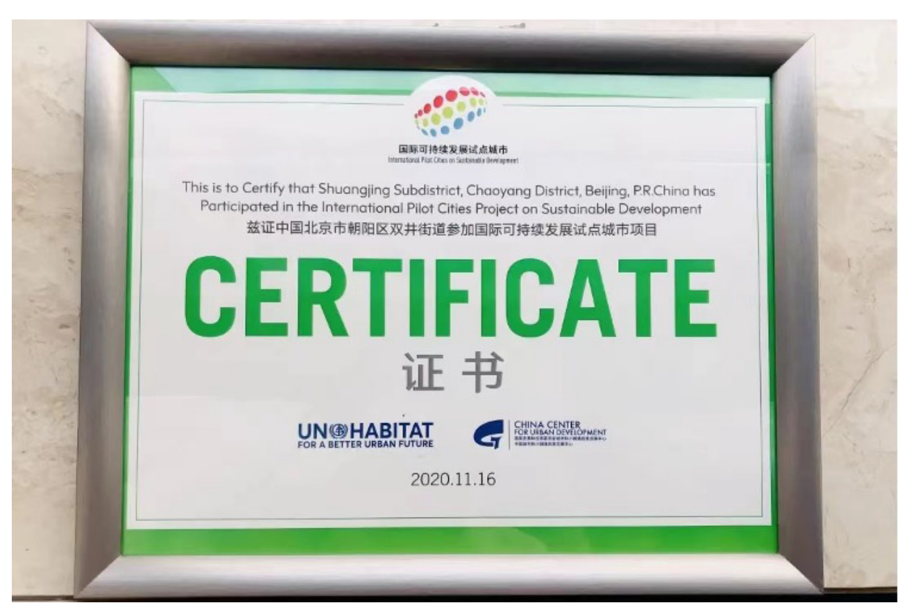
Figure 42: Shuangjing Sub-district Participated in the International Sustainable Urban Development Project

In terms of social impact, the governance practice of Shuangjing has been reported 16 times by numerous media, including Oriental Outlook magazine, the Paper, Southern Metropolis Daily, and Beijing Daily. The People's Daily Overseas Edition reported on the pilot renovation of the small micro-space "Jingdian No.1" at the end of 2019 and agreed on the practical implementation of the small micro-space renovation for the UN SDG11.