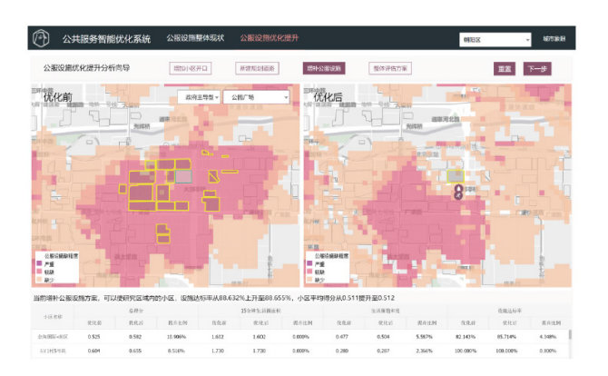
Figure 8: Intelligent Public Service Optimization System

Based on the above ideas, Shuangjing has built the "Well-organized" big data platform, and through the construction of the perception system, data center, algorithm model, and governance platform, an intelligent governance brain system across terminals has been established and deployed. This is also the first sub-district big data platform system in Beijing.