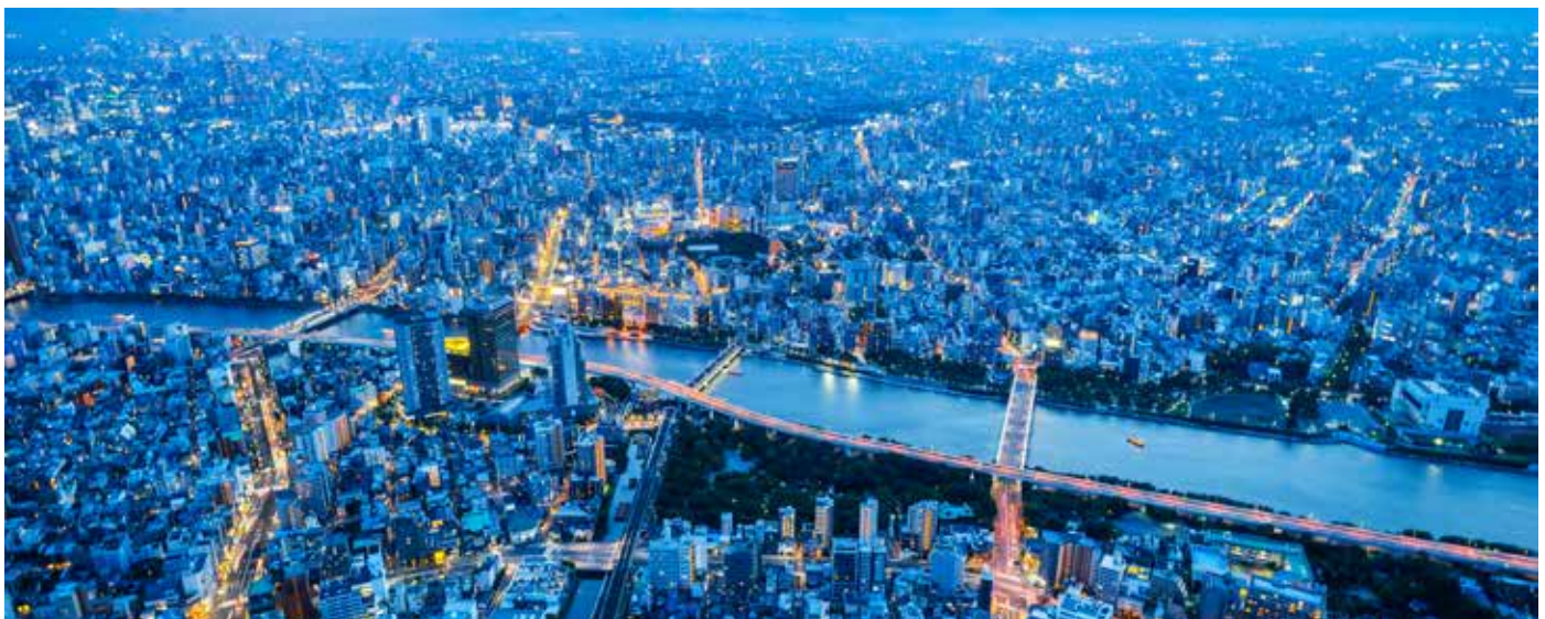
panoramic urban city skyline aerial view under twilight sky and neon night in tokyo, Japan