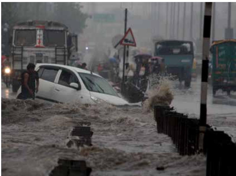
Impact of climate change. Flood on the expressway in Millennium City Gurgaon. Haryana, India