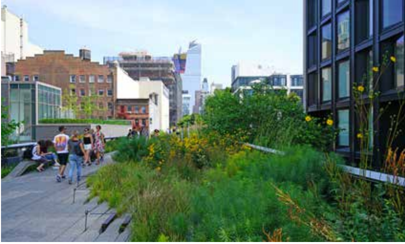
View of the High Line, an elevated green urban park in New York City

tend to disproportionately impact poor communities where local governments have limited resources and capacity to adapt to shocks. Understanding impacts and responses at the local and regional levels can furthermore help address these imbalances and promote capacity for SDG localization and acceleration.