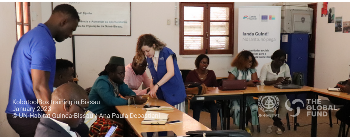
KobotoolBox training in Bissau