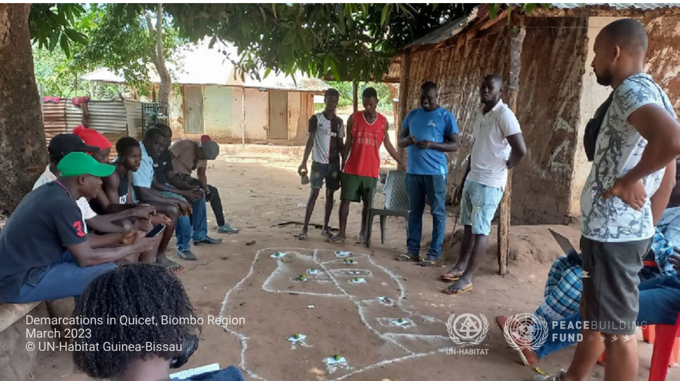
Demarcations in Quicet, Biombo Region March 2023

cross-cutting issues: Gender, Youth, Climate Change and Human rights.