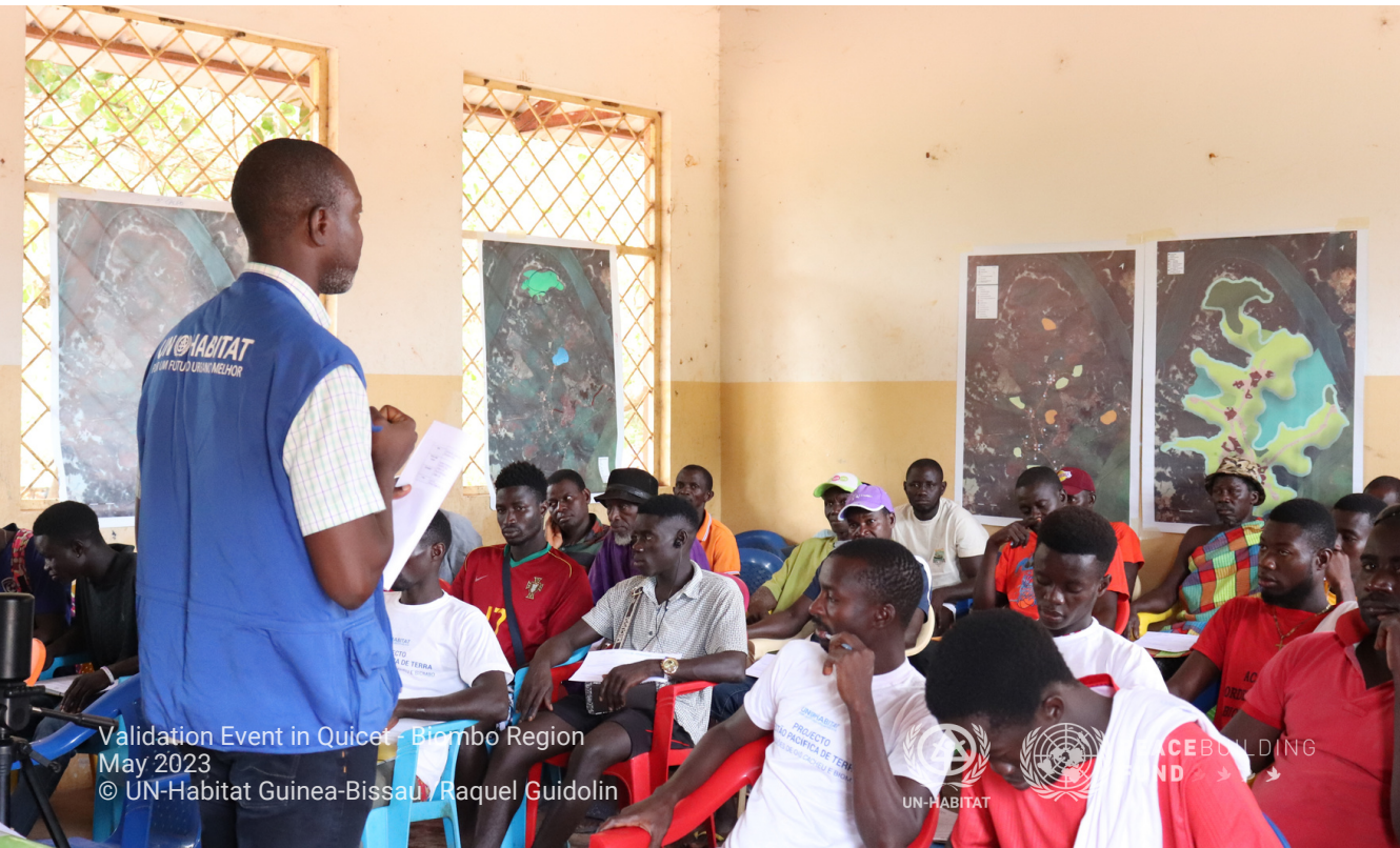
Validation Event in Quicet - Biombo Region May 2023