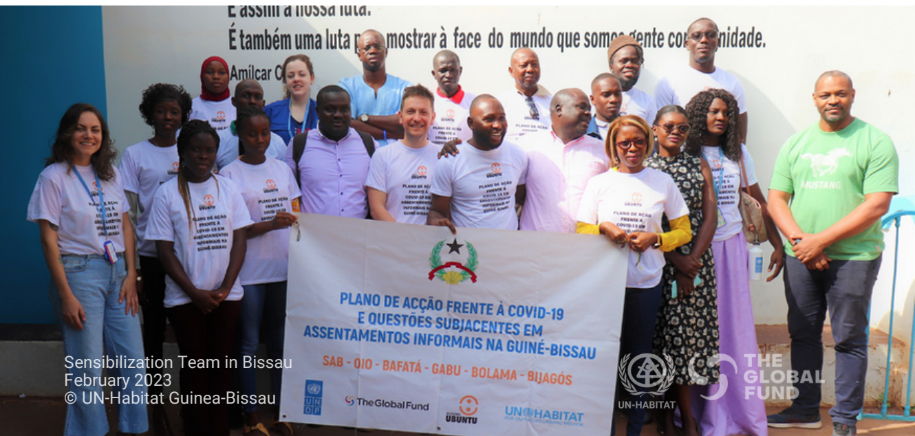
Sensibilization Team in Bissau February 2023

The main objective of the project is to reduce and prevent conflicts based on natural resources and transhumance in Bafatá and Gabu regions. In particular, the project intends to respond to conflicts on land between farmers and herders and to marginalization of transhumant herders, which have become more prevalent due to climate change effects. UN-Habitat's role includes the establishment of institutional and strategic and spatial frameworks for improved management of water and land resources, and the installation of infrastructure aimed at reducing conflicts between the different groups trying to access these resources.