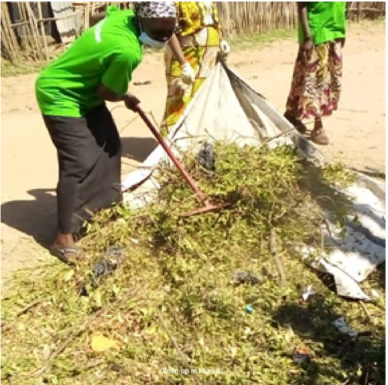
Clean-up in Munuki