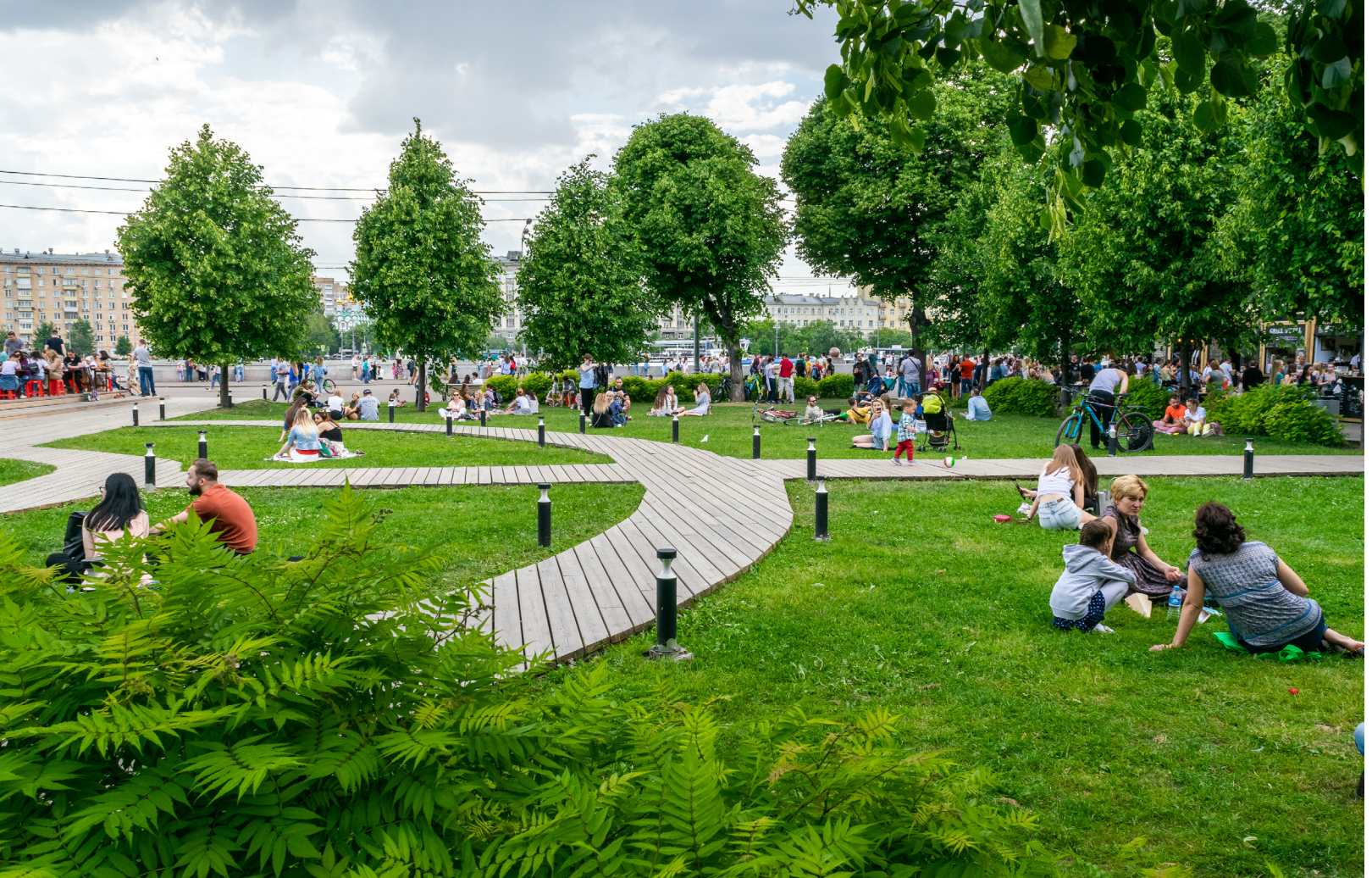
Gorky Park in Moscow, Russia.