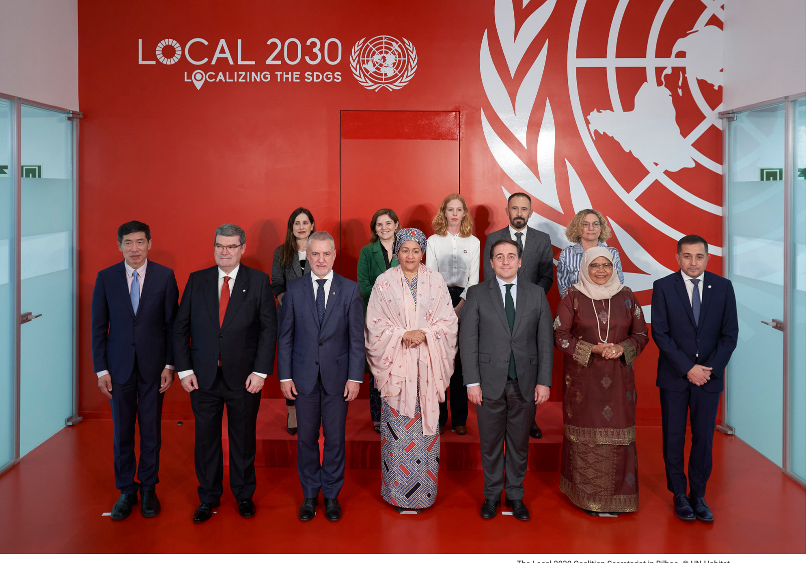
The Local 2030 Coalition Secretariat in Bilbao.

resident coordinators gathered, with the support of the Development Coordination Office, to review progress and identify ways to accelerate joint urban programming as a means of implementation of Development Cooperation Frameworks in 29 countries. A total of 20 United Nations resident coordinators participated in the World Urban Forum to engage with key constituencies of the New Urban Agenda and design strategies to promote joint urban programming at the country level.