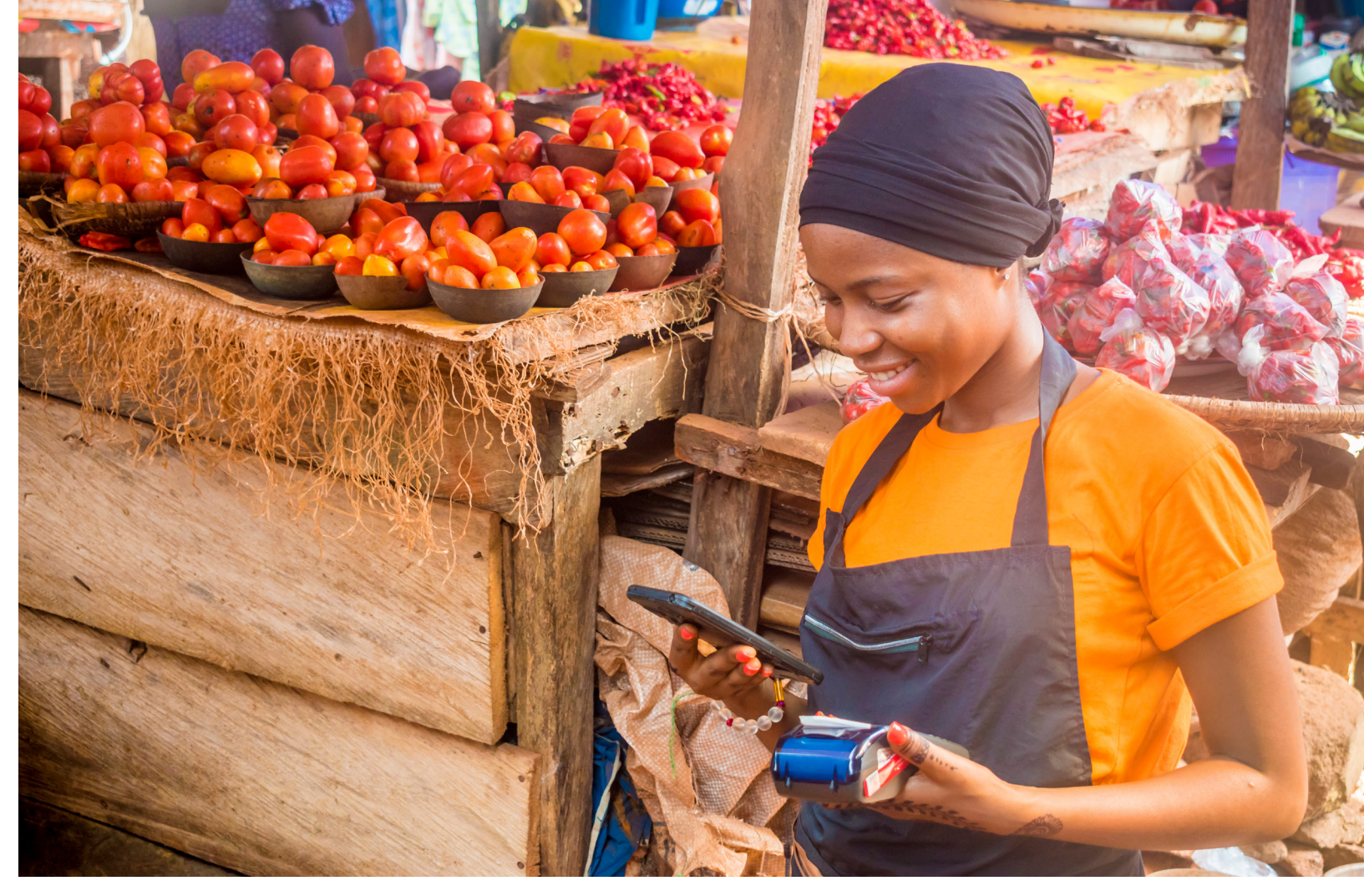
Young African woman selling in a local African market using a mobile point of sale system and her mobile phone.