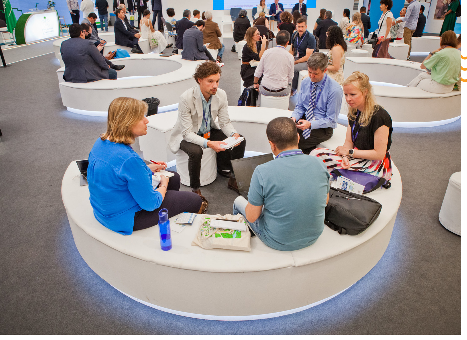
World Urban Forum 11 Urban Expo in Katowice, Poland.