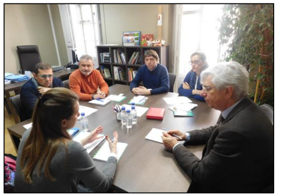
The Cooperation Directorate and UNDP ART Brussels team working on this systematization