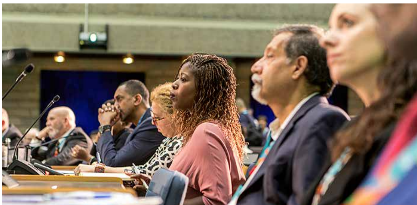
UN Habitat Business Leaders Dialogue organized prior to the first session of the UN-Habitat Assembly © UN-Habitat.