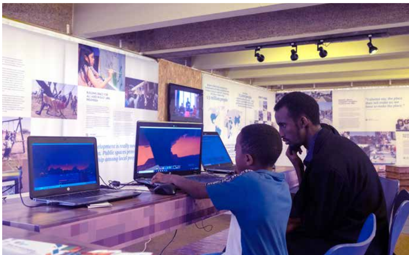
Visitors to an exhibition booth at the UN-Habitat Assembly © UN-Habitat/George Muriama.