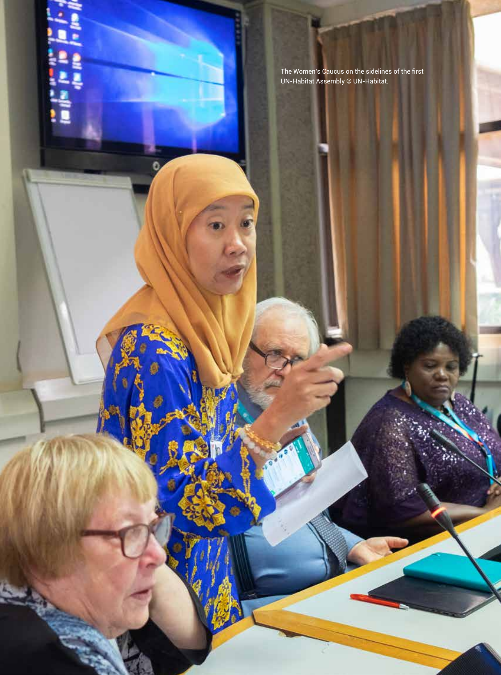
The Women's Caucus on the sidelines of the first UN-Habitat Assembly © UN-Habitat.