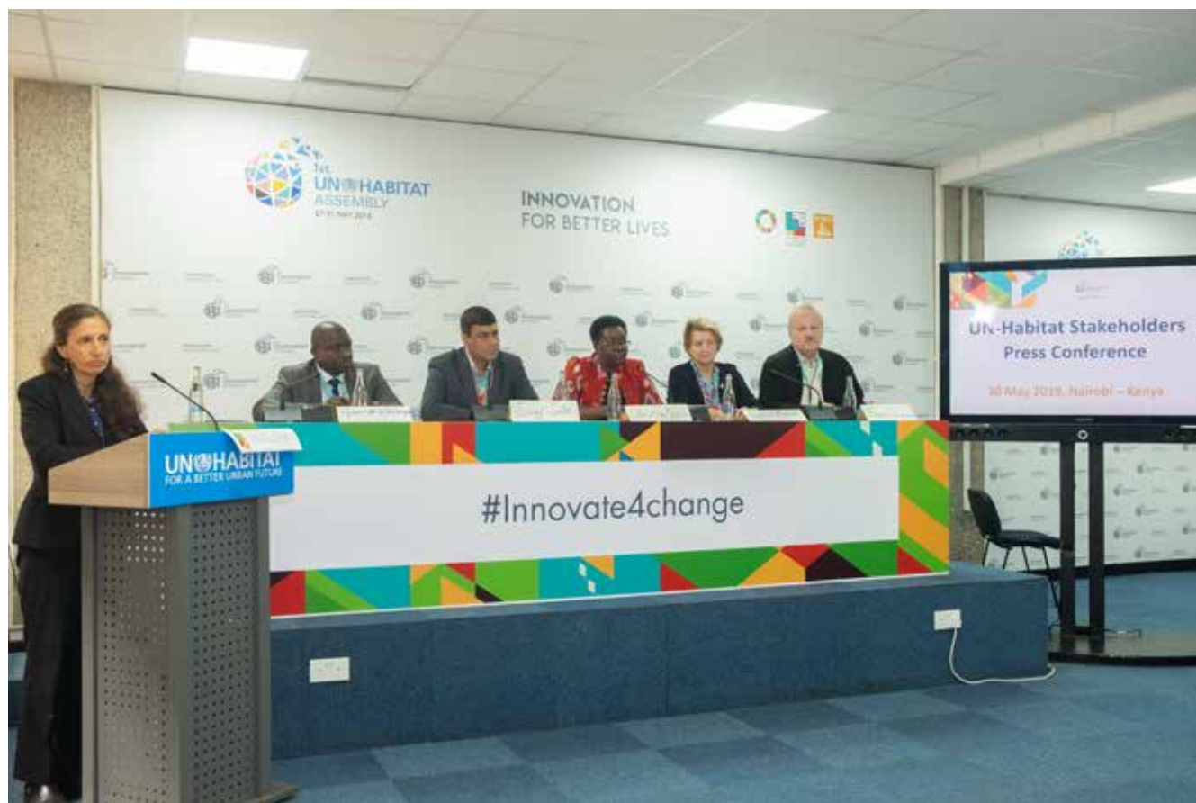
Stakeholders press conference at the UN-Habitat Assembly © UN-Habitat/George Muriama.