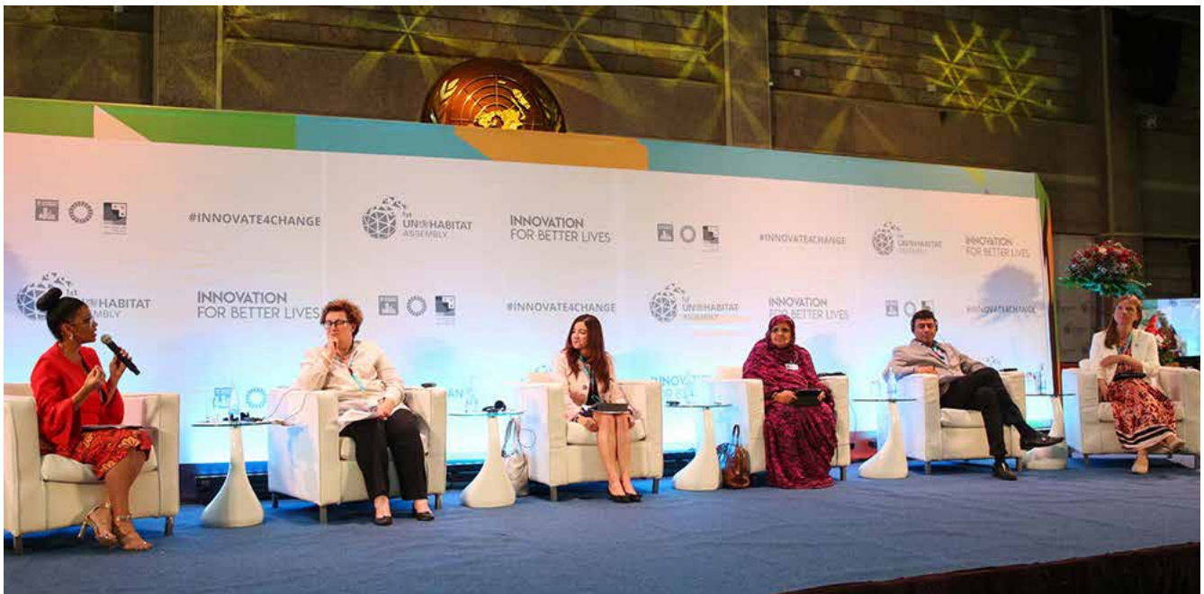
Cities and communities segment of High Level interactive forum at UN-Habitat Assembly © IISD/ENB/Kiara Worth.