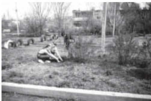
Children Planting Trees and Bushes in a Playground Area.

The adults discussed with the Children-Youth Board plans for preparing a compost pit for using waste matter to make fertilisers for their green zones, which lacked good soil.