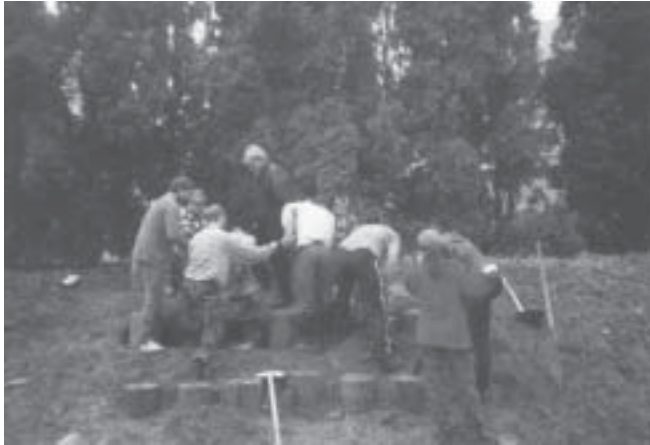
The playground construction begins through volunteer work!

The local elections in November 2002 brought a new set of elected leaders and a new mayor to power. Sensing the need to establish their position as allies of the newly elected officials, the Mother Centres Working Group started a dialogue with the newly elected local authorities, fourteen days after the election. And while all parties declaimed support for local clubs and associations, 2 out of 6 parties taking part in the local elections in Breznice named Mothers Center Pampeliska in their programmes as a local association they were willing to support.