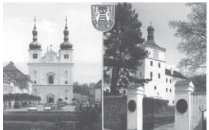
Breznice, the home of the Czech Republic Local to Local Dialogues.

Local to Local Dialogues started in three different Prague representative Mothers Centres—one in the capital, one in a big town and one in a small town in country area. The Network of Mothers Centres in the Czech Republic