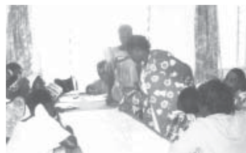
Identifying Area Priorities

The Central Group identified domestic violence as their key issue and identified women council leaders, councillors, religious and opinion leaders, members of parliament, women on the executive committee of the local councils, local councils and police as actors whose support they would seek to address the problem. Following the workshop, they organised a series of meetings with their women councillors to work on a structured questionnaire to collect more information on the problem.