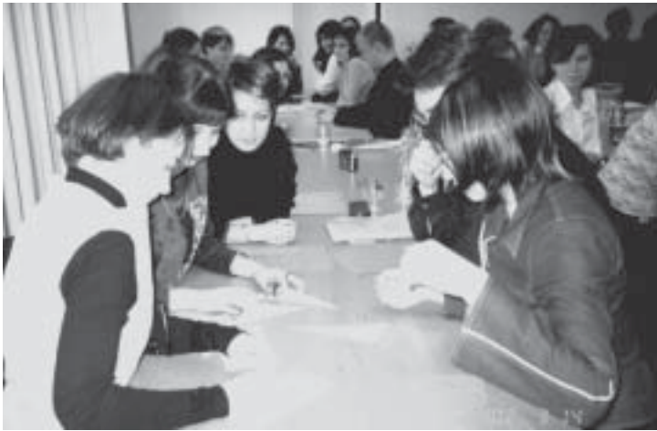
Grassroots women working together in Russia

Grassroots women recognise that they are rarely able to gain from individual negotiations. Collective efforts to influence state actors have been far more successful than individual ones. Increasingly, women are recognising the power of networks of collectives across neighbourhoods, villages and cities. When individual women break away from rigid institutional structures they are deified or vilified. It is easier for powerful interests to isolate them. They are seen as exceptions to the norm. This does not help to create institutional change. It simply enables the marginalisation of those who threaten the status quo. 7