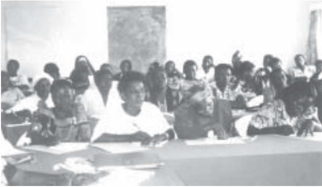
Women Listening and Taking Notes at the Workshop.

Grassroots women present at the workshop not only saw this as an opportunity to get information and advocacy skills but also wanted to develop links between their community based organizations and NGOs such as FOWODE as a means to create an alliance with an organization that could help to create new institutional mechanisms to dialogue with the government.