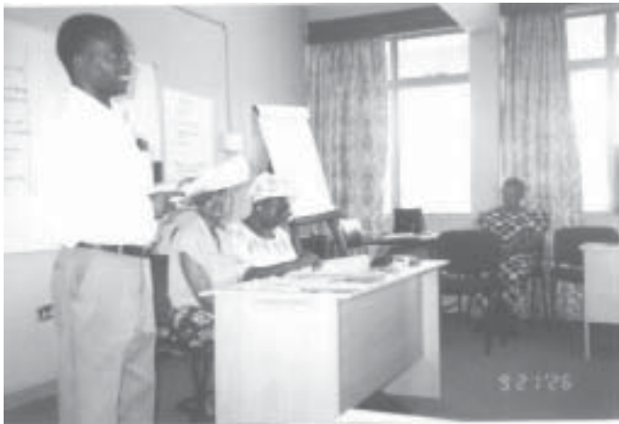
Local Authorities Responding to Community Priorities

properly registered under Tanzanian laws. It is also necessary to have legal status to qualify for loans under the Women Special Fund (which is managed by the local authority) and from other financial institutions that are funding community groups through loans and grants.