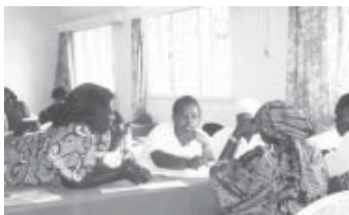
Planning for Community Surveys and Other Future Action

The North Group also identified domestic violence as their issue. They decided to survey the problem, organise a meeting of women leaders from the communities, use radio programmes to discuss the problem and send a delegation to talk about the problem of domestic violence in the Division Council.