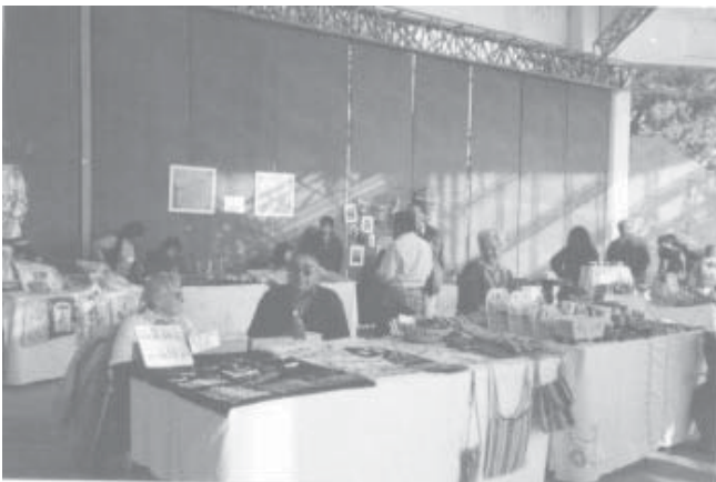
The Second Entrepreneur Meeting

The Family Community Market held a second meeting with entrepreneurs at the National Plaza for Folklore, a facility lent to them by the Municipal Folklore Commission in order help increase the visibility of Cosquin's family based entrepreneurs.