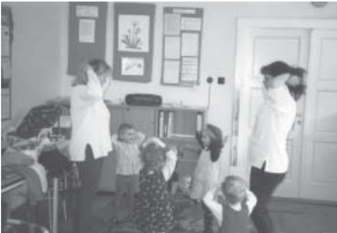
Mothers and children during one of the morning programmes.

The Working Group team presented their project to the public with the help of the media. It was called “Playground for Breznice.” In partnership with the media the Mother Center also organised an art and literary competition for children to draw the attention of both political leaders and communities. The art and literary competitions were called “ My Dream Playground” and “What I would like to have in Breznice.” 120 works by children of all ages were collected, and displayed in a gala afternoon that concluded with the Mayor giving a speech supporting the project.