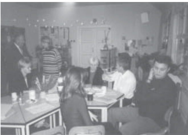
Mothers and local authorities working together in the context of the Joint Working Group.