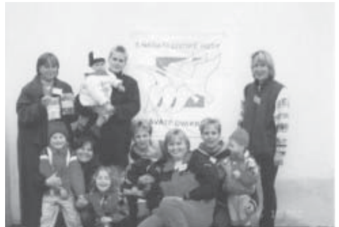
Castle Park March participants raising money for playground expenses.

Sublima Invest, a local timber and woodcraft factory, made an offer to prepare certain wooden items for the project under a contract signed by the Town Council.