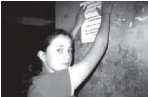
A Children's Board Member Hanging Signs Asking Residents to Help Remove Old Sand from a Playground.