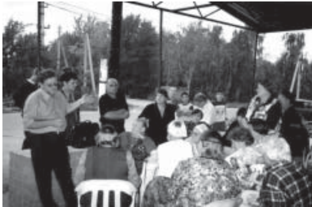
Grassroots women in Russia building alliances with local authorities through a grassroots-initiated meeting.

rarely any incentives to respond to these. Even where national policies have created a favourable environment for grassroots participation in planning, frequently these policies are not reflected in operational mechanisms that enable information flow and dialogue between planners and local communities. Addressing this problem is one of the central challenges for those working towards more decentralised, democratic, gender-sensitive governance.