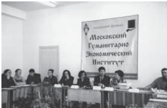
The Roundtable brought stakeholders face to face so they could learn from each other and explore ways in which to collaborate. These different actors expressed their need to share information, learn through community initiatives and transfer experiences and insights across communities.