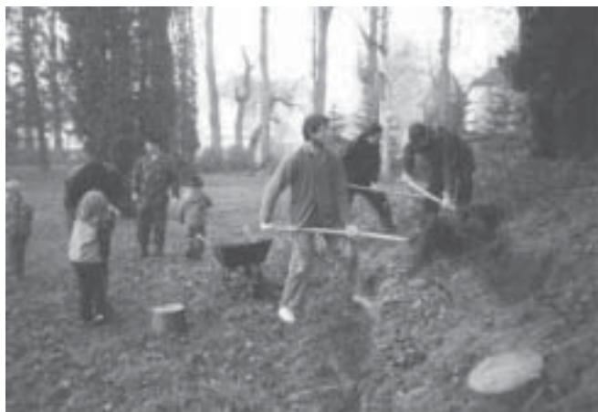
Between November and December 2002, the first steps in the actual construction of the children's playground were initiated.

2. Capacity Building: Local to Local Dialogue enabled the mothers involved to enhance their negotiation skills, solve various problems and learn about local politics. Almost daily documentation helped in dealing with local authorities as well as in writing grant requests for assistance from various local foundations. The women learned to negotiate for resources from the City, the private sector and the non-benefit sector.