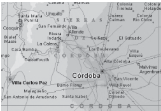
The Local to Local Dialogues took place in the city of Cosquin with a population of approximately 20,000.

The Cosquin River and its surroundings are a major resource for the communities settled in three cities that share the Cosquin River waters. The pristine river waters have not only provided a water source for the settlements but have also drawn tourists from all over the country. In recent years, the pollution of river water and the banks of the river have been steadily worsening because of garbage and sewage disposal