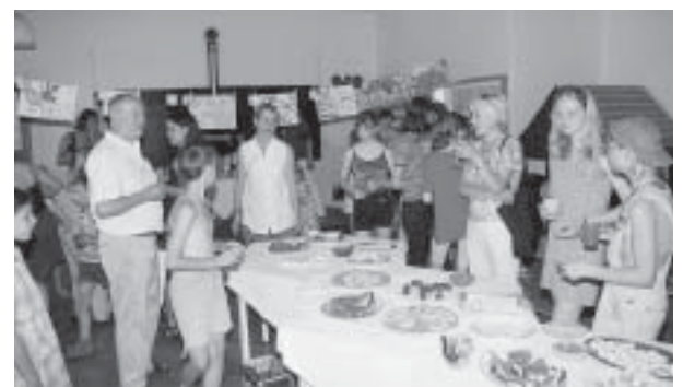
The Mayor (the man in a white shirt to the left) celebrating the Success of the Czech Republic Playground Project with Grassroots Women and their Families

Sometimes it is useful to have a powerful ally within the government who supports women's initiatives. This ally can help support women by talking to colleagues within her organization. He or she can get others within the organization to start a dialogue with women by setting up meetings. He or she can create new rules in the organization to support women's initiatives, provide incentives to those who get involved in dialogues or get personally involved in dialogues. Whatever they do will help to draw the institution's attention to women's capacities, priorities and initiatives.