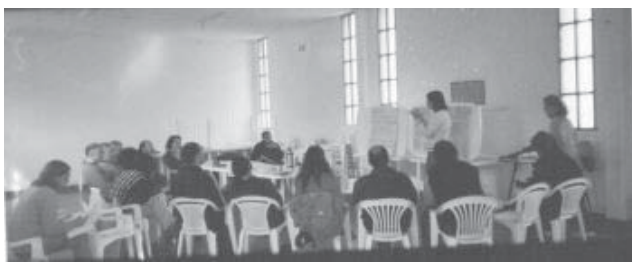
A Meeting in Argentina Where Organizations Could Exchange Experiences and Discuss Themes of Importance to the Inhabitants of their Area.

In Adapazari , women surveyed the settlement and created a map showing the locations of shops, markets, schools, medical centres and community centres. This led to a discussion on the extent to which residents in the temporary prefabricated settlements had access to goods and services. The information collected was then used to go to government officials and discuss ways of improving access to services.