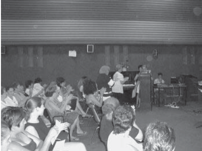
The Women's Day Workshop provided the starting point for these two groups of women to come together around issues impacting them and to find ways to collaborate.

The situation in the Punilla Valley where the Local to Local Dialogues were carried out is marked by a state of recession. There is a crisis at the Municipal level that has created a lack of municipal funds, which means that municipal services are often being neglected. The communities of Santa Maria de Punilla, Biale Masse and Cosquin, who live around the Cosquin River, have thus had to face environmental degradation as well as the lack of municipal services, both of which have an adverse affect on their quality of life.