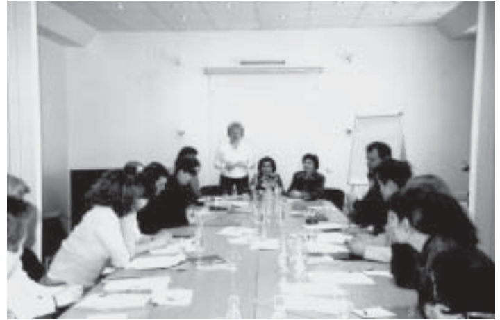
Community Planning Processes

Leaders of the same communities met to review any progress. There was none. In a discussion with a correspondent from the Povolzhsky Information Agency and the newspaper Saratovskya Panorama , they expressed their concerns with the participation of the authorities in all levels of solving the dwellers' problems stated in the letter. They told him they were offended by the indifference of the authorities and had decided to boycott the elections of the regional legislature to be held in September. On 17 July, this was published in an article called "Residents of Zonalnyi and TsDK voted in advance—against everybody."