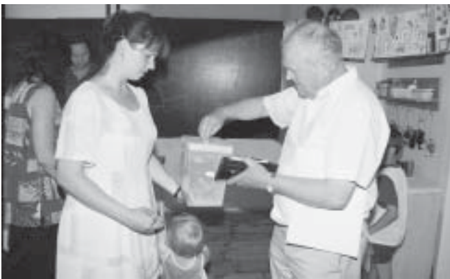
Mothers in the Czech Republic Raising Money for their Playground Project

In order to strengthen their position in any negotiation with authorities, increase their leverage and make the somewhat protracted dialogue process a worthwhile investment, women’s groups need to build their capacities.