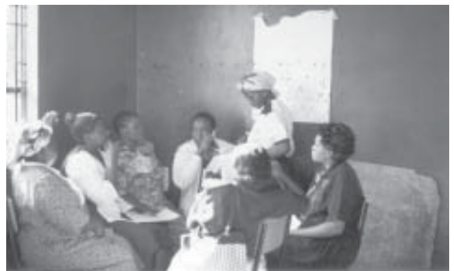
Women's Group Representatives Consulting One Another in Kenya

A key element of the mobilisation process is bringing collectives or communities together to discuss issues and reach a consensus on how to prioritise their actions. Civil society organizations, communities and women's groups have to invest in continually communicating among each other to agree on an agenda for advocacy and identify areas for collaboration.