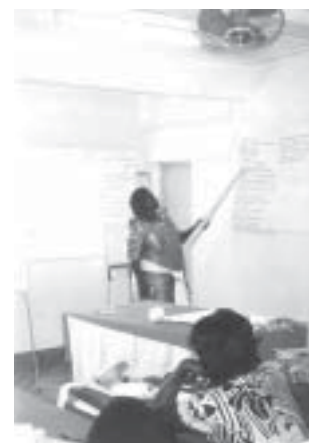
Guiding Women through Advocacy