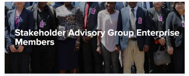
HOME / PARTNERS / STAKEHOLDER ENGAGEMENT / STAKEHOLDER ADVISORY GROUP

"Accelerating urban action for a carbon-free world"