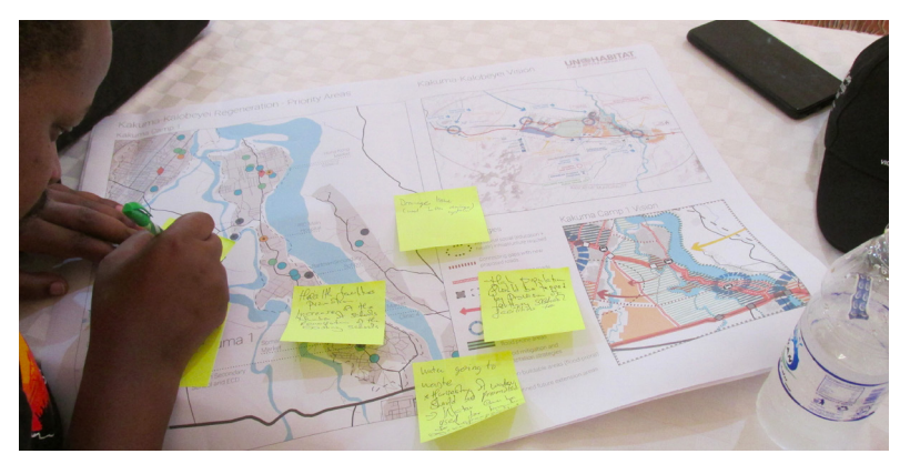
Break-out session to propose potential regeneration strategies.

Throughout 2021, UN-Habitat has been undertaking a process of visioning for Kakuma-Kalobeyei in order to understand the needs and aspirations of the host and refugee communities. The next stage of the EUTF-funded programme is to prepare a comprehensive regeneration strategy that identifies specific projects that will work towards achieving the collectively determined vision.