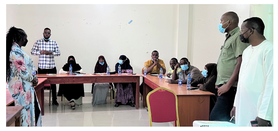
Breakout Session on the Vision with Host and Refugee community. @ UN-Habitat

Inclusive participation of stakeholders and communities in planning for development is critical to developing a sustainable, resilient, and integrated region. To ensure this element in developing the future vision of the Dadaab region, UN-Habitat conducted a stakeholder workshop with the host and refugee communities of the Dadaab region on the 27th of January 2022, as part of a process to capture the community's growth expectation for Dadaab area in the next five to ten years. This vision will encapsulate the positive aspects of Dadaab that should be preserved and protected while identifying and addressing the major challenges that current and future residents will face.