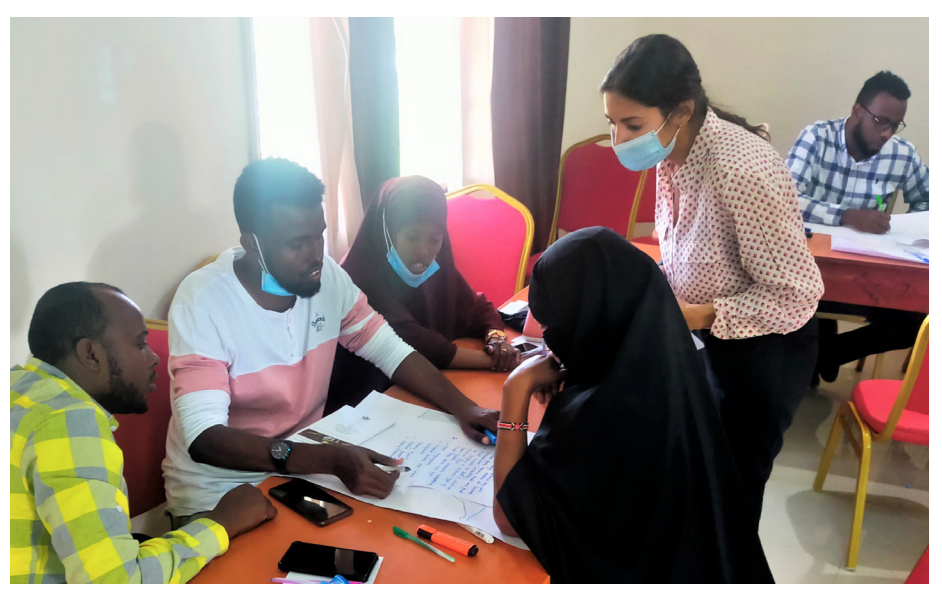
Breakout Session on Scenario Building with the Refugee and Host communities.

UN-Habitat continues to promote participatory planning in its implementation of projects by adopting and promoting participatory methods in policy development and planning exercises. This ensures critical problems are identified and joint priorities are developed, giving the public a chance to have a say in the development decisions that affect them.