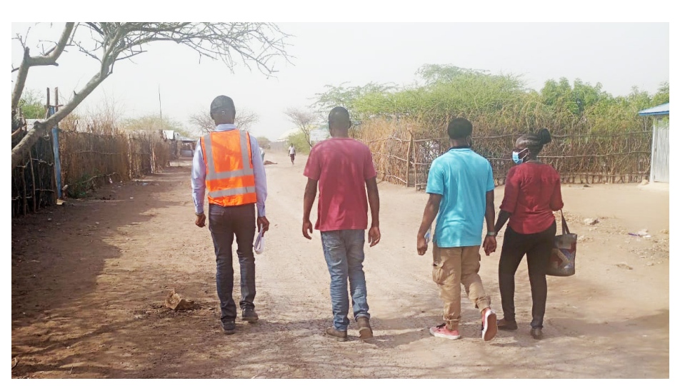
The technical team conducting transect walks on the proposed site.

In a response to community needs and building on its record on implementing flood-resilient infrastructure, UN-Habitat – in partnership with Peace Winds Japan and SPEC Ltd – plans to implement a road project, upgrading it to a paved standard.