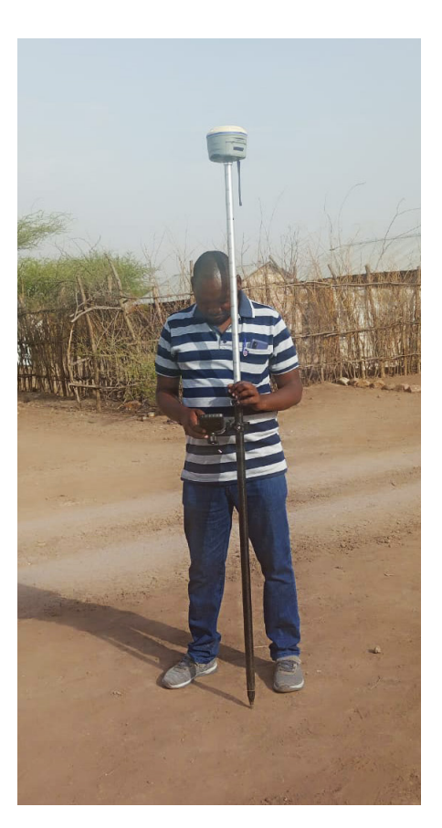
The technical team collecting spot heights during the site visit. UN-Habitat

In a response to community needs and building on its record on implementing flood-resilient infrastructure, UN-Habitat – in partnership with Peace Winds Japan and SPEC Ltd – plans to implement a road project, upgrading it to a paved standard.