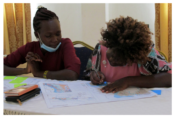
Participants brainstorming regeneration projects during the break-out session.