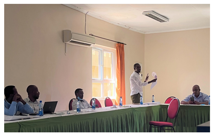
Participants sharing and Discussing during the workshop.jpg.

UN-Habitat and the Garissa County Government hosted a workshop to discuss the desired vision for the future development of the Dadaab area and possible scenarios for longterm and sustainable solutions for the area.