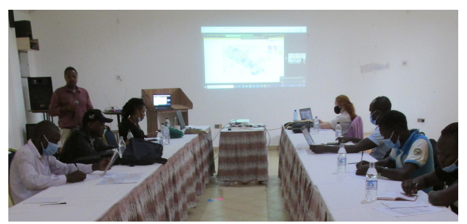
Participants sharing and discussing during the workshop.

In partnership with Kenya's North Rift Economic Bloc (NOREB), Turkana County Government and Cities Alliance, UN-Habitat organised a one-day collaborative workshop to discuss and deliberate on the progress made in support of the development of an Economic Enterprise Zone in Turkana West. This workshop was organised as part a project that is aimed at supporting "Sustainable Economic Development Along Turkana West Development Corridor Through Enhanced Connectivity, Kenya," which is funded by the Swiss Agency for Development and Cooperation (SDC), and as part of strengthening the established working relationship within the region through content and information sharing as well as ensuring collaborative planning for sustainable urbanization and development along the corridor and the NOREB region.