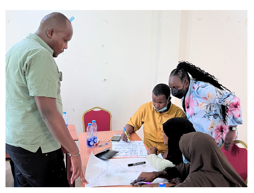
Breakout session on Scenario building session with Refugee and Host community.

The workshop concluded with UN-Habitat indicating the next steps for the visioning process, which consist of refining and compiling all outputs from the workshops. Furthermore, UN-Habitat will conduct bilateral meetings and follow-up with key stakeholders prior to the validation workshop which is to be done in the coming months.