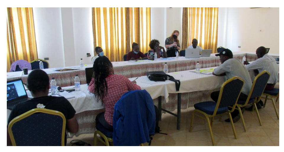
Participants sharing and discussing proposed regeneration strategies.

The objectives of the workshop were to provide updates to the Turkana County Government on the progress of the Kakuma-Kalobeyei Vision, to discuss upcoming projects planned throughout Kakuma-Kalobeyei and to undertake a break-out session to identify potential projects to be included within the regeneration strategy.