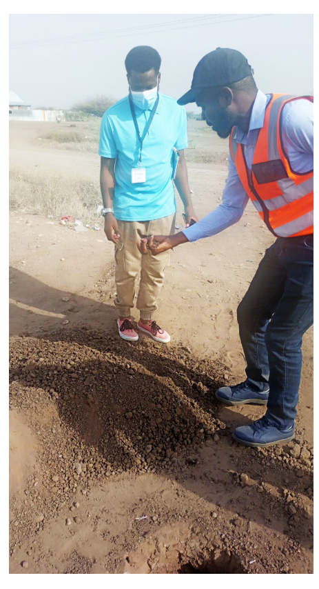
The technical team collecting spot heights during the site visit.

existing services that might be affected by the works, identifying diversion routes and engaging key stakeholders in the Kalobeyei Settlement. This information was used to develop detailed designs, materials, equipment, and labour schedules that will be used during implementation. The actual implementation works are expected to start in mid-February and will be carried out over a period of one week