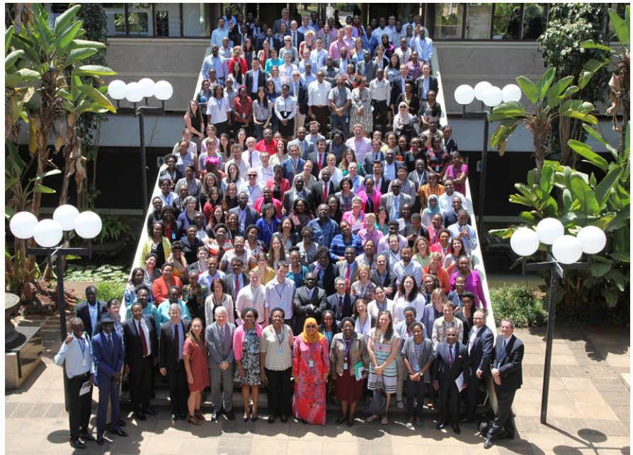
UN-Habitat Executive Director Ms. Maimunah Mohd Sharif with UN-Habitat staff at the town hall in Nairobi, Kenya 24 January 2018

importance of our climate adaptation work and in collaboration with a wide range of partners, meet commitments made to support Member States in our collective effort to achieve greater equity through adapting to a carbon neutral future.