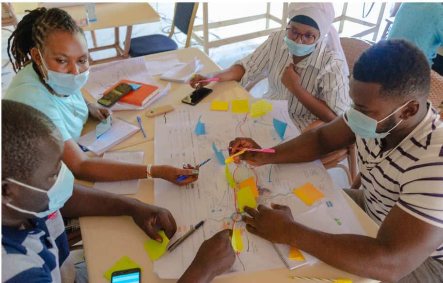
Kakuma-Kalobeyei host and refugee community discuss the proposed vision for Kakuma-Kalobeyei in an engagement session.

To promote urban resilience, self-sufficiency, and communities' integration in one of Kenya's longest-standing and significant refugee camps, UN-Habitat is formulating a detailed Regeneration Strategy focusing on harnessing inclusion and socio-economic opportunities for host and refugees.