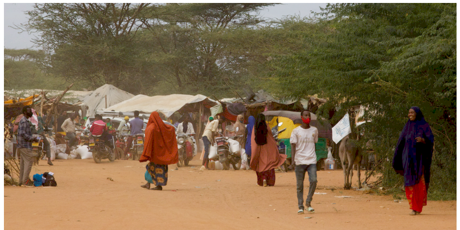
Market place in Dadaab utilised by both Host and Refugee Communities.

The recent Refugee Community Planning Group session was conducted as follow-up to prior sessions with the Dadaab Town host community and aimed to gain insights into the challenges faced by the refugee camps residents and understand the current relationship with the host community. Education, health, security, and infrastructure shortages were discussed.