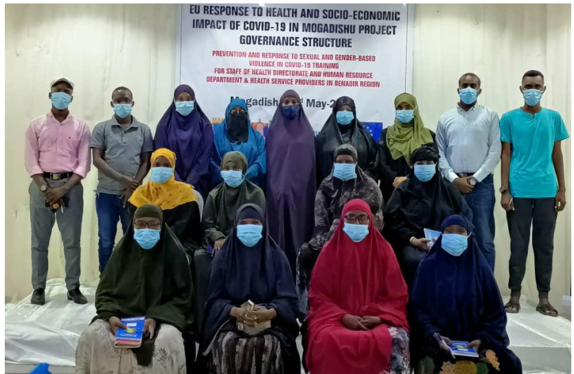
Some of the participants drawn from the BRA Directorate of Health and Human Services, health workers and community surveillance teams from Benadir Region during the training in Mogadishu.