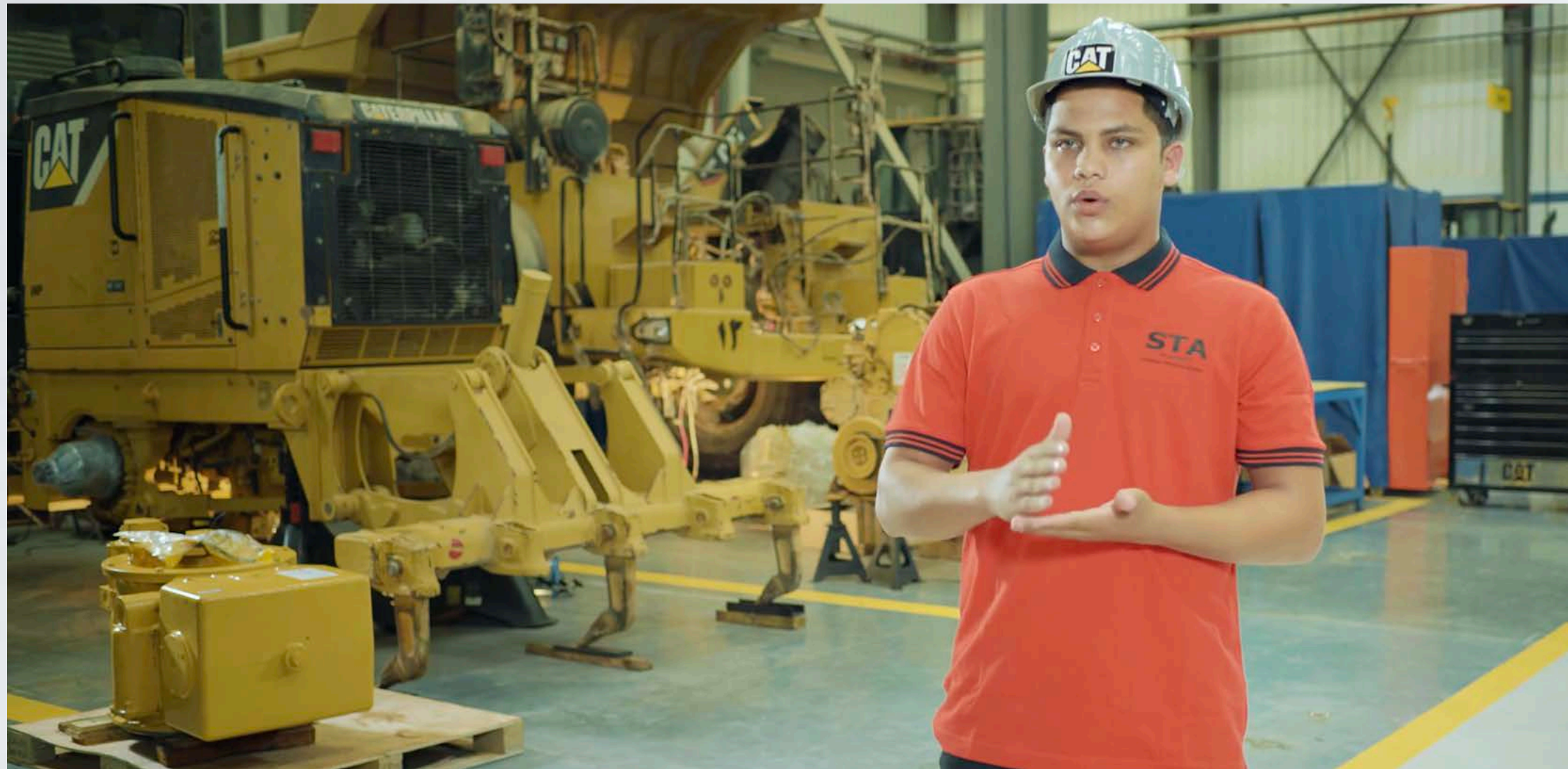
CAMERA 1: WIDE FRAME