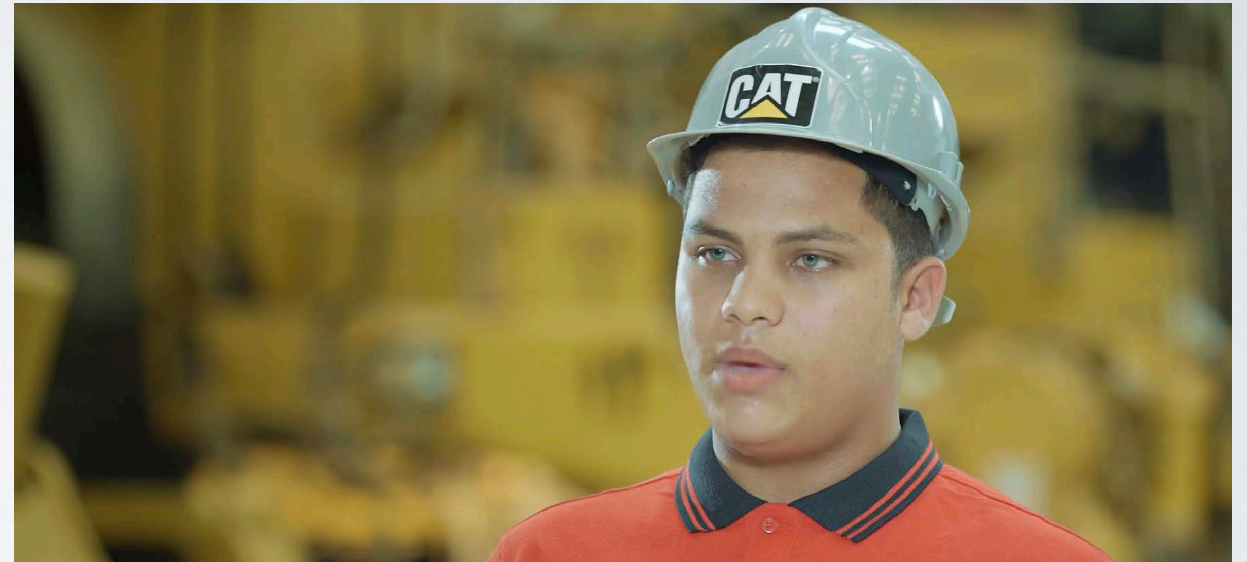
CAMERA 2: CLOSE FRAME

Subject should be standing/sitting in 1/3 of the screen (right or left) (Rule of thirds)