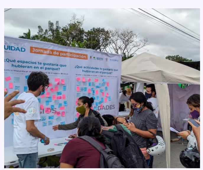
Participatory activities for the planning and design of the Parque de la Equidad.