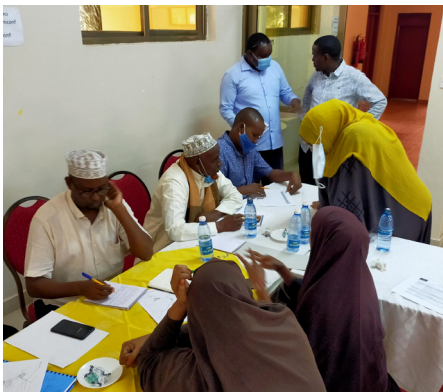
Participants engaging in group discussions.