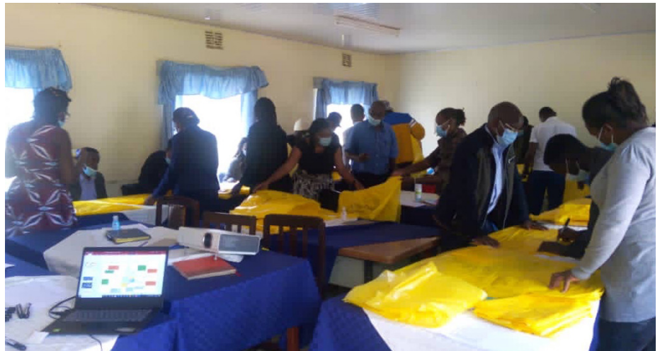
UN-Habitat-JICA conducts survey on Impacts of Covid-19.

The vulnerability mapping exercise involves clarifying problems and the impact of COVID-19 on vulnerable people, such as slum dwellers, in Nairobi, Mombasa, and Kampala. It will include