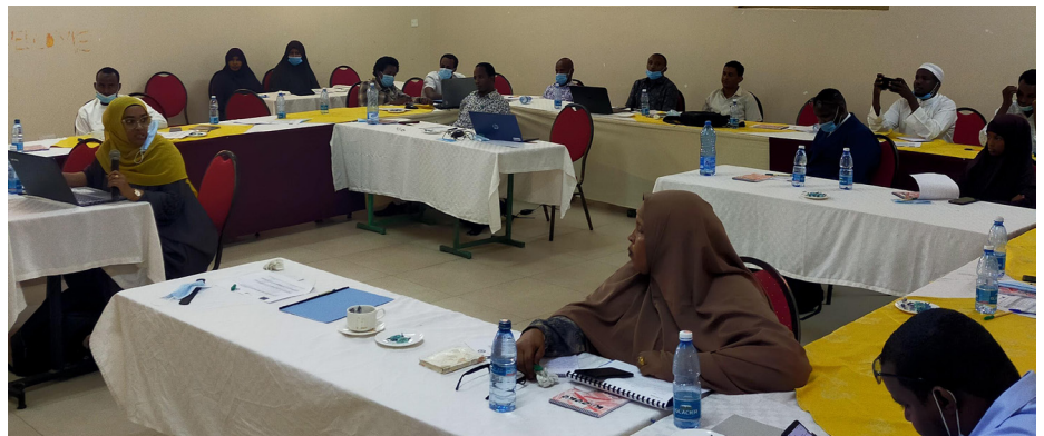
Participant attending the workshop.

In collaboration with Garissa County Government, UN-Habitat led a semi-virtual workshop to discuss the decommissioned refugee camps' future within Dadaab Refugee Complex - Ifo 2 Kambioos under a project focusing on enhancing self-reliance for refugee and host communities in Kenya, funded by the European Union Trust Fund. Garissa County Government Officials and staff, representatives of refugee and host communities, UN agency representatives, and EU donor representatives, were all present.