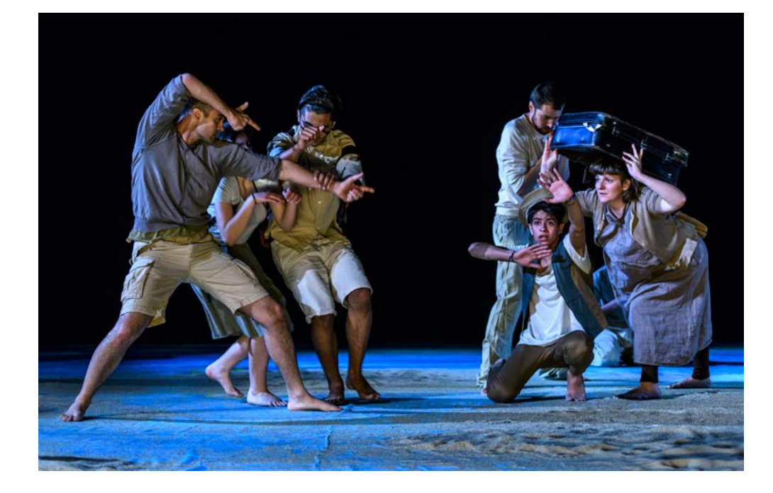
Refugees preforming a play in Greece

The OECD has been working on key indicators for identified action tools and relevant practices from a sample of 72 EU cities.