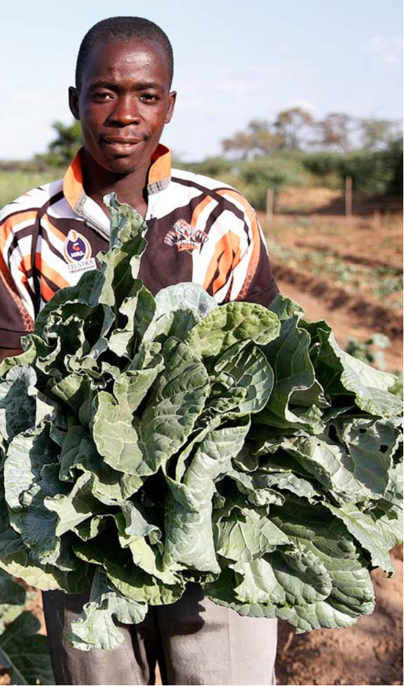
A Burundian refugee tending to his farm in Kakuma in Turkana, Kenya 2016

Vienna, Austria: The Start Wien office is where migrants are oriented from their initial registration in the city. It offers individual counselling in 25 languages, training in different modules (labour, housing, education, health, legislation, society) and language courses (vouchers are offered as newcomers participate in the training modules). The newcomers benefit here from a competence assessment based on which they are referred to the most appropriate municipal service (vocational training, or employment service). The city department for integration and diversity (MAI7) establishes contracts with relevant departments to monitor the delivery of integration-related services, thus creating a successful system of incentives across teams to work together at co-ordinating integration solutions.